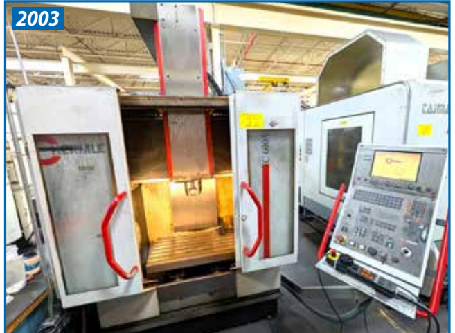
HERMLE C 600 V CNC VERTICAL MACHINING CENTER