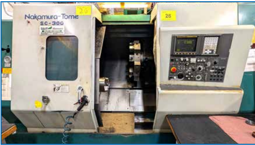
NAKAMURA-TOME SC-300 CNC TURNING CENTER