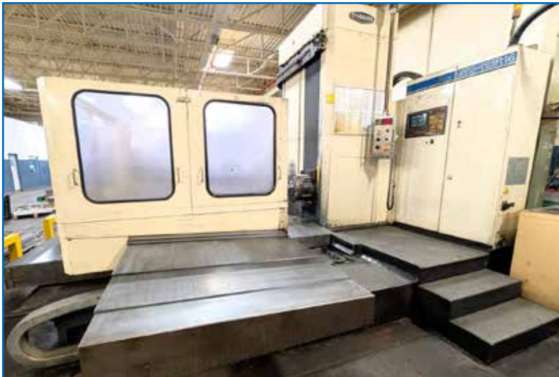
TOSHIBA SHIBAURA 11ER16 CNC HORIZONTAL BORING MILL