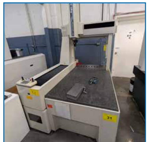
MITUTOYO BRIGHT A710 CMM