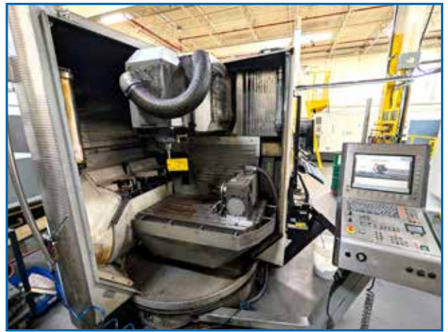
DMG DECKEL MAHO DMU60T CNC VERTICAL MACHINING CENTER