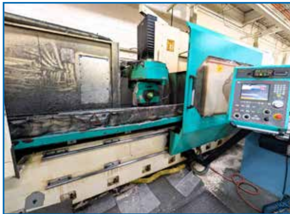
ROSA LINEA SILVER 12.8 CNC SURFACE GRINDER