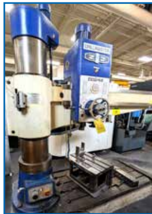
DRILL- MASTER Z3050X16 RADIAL DRILL