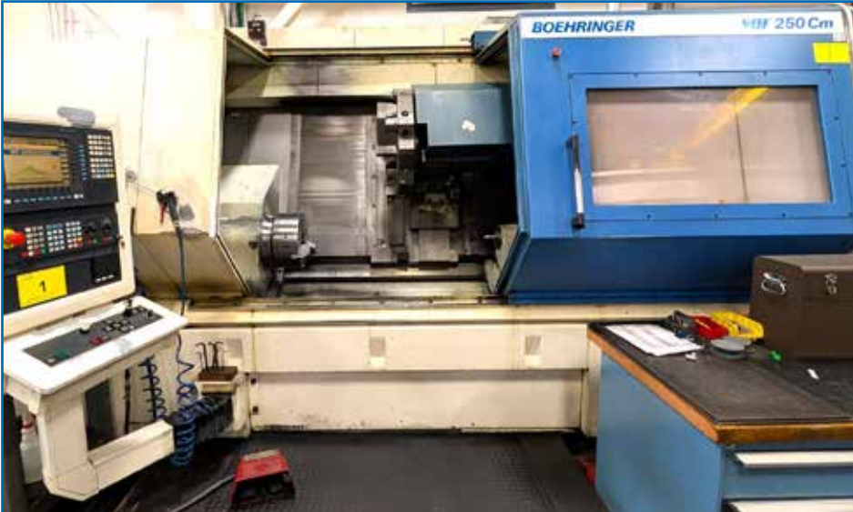
VDF BOEHRINGER 250 CM CNC TURNING CENTER

Industry Leading Plastic Injection Mold Manufacturer 929 Pantera Dr., Mississauga, Ontario