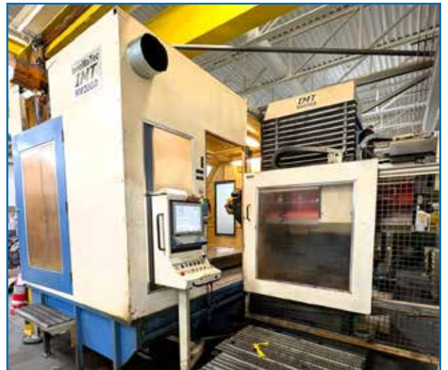
INNOMATEC IMTBM20GD CNC GUN DRILL