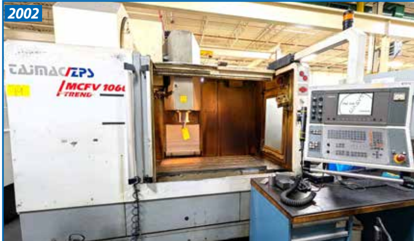
TAJMAC-ZPS MCFV 1060 TREND CNC VERTICAL MACHINING CENTER