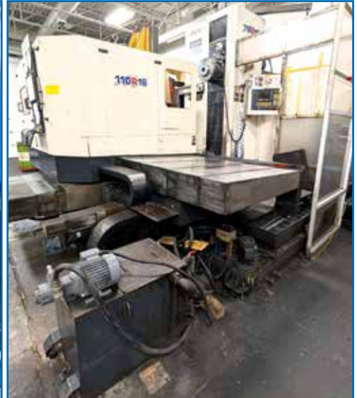
TOSHIBA SHIBAURA LTD-110R16 CNC HORIZONTAL BORING MILL