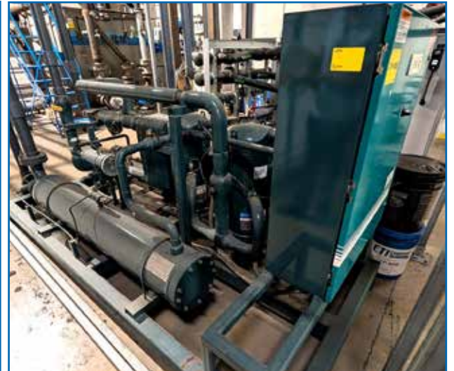
PARTIAL VIEW OF BERG & ADVANTAGE CHILLERS