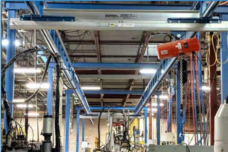
GORBEL FREE STANDING CRANE SYSTEM