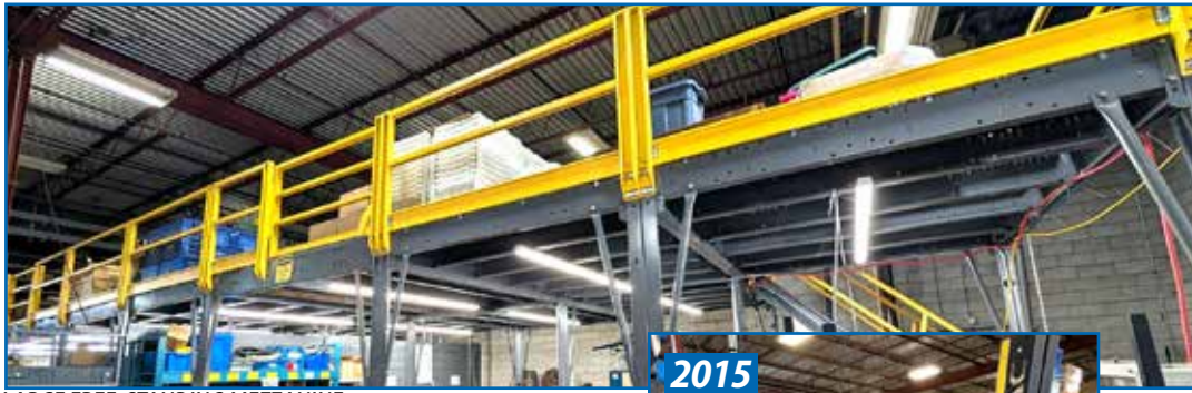
LARGE FREE-STANDING MEZZANINE