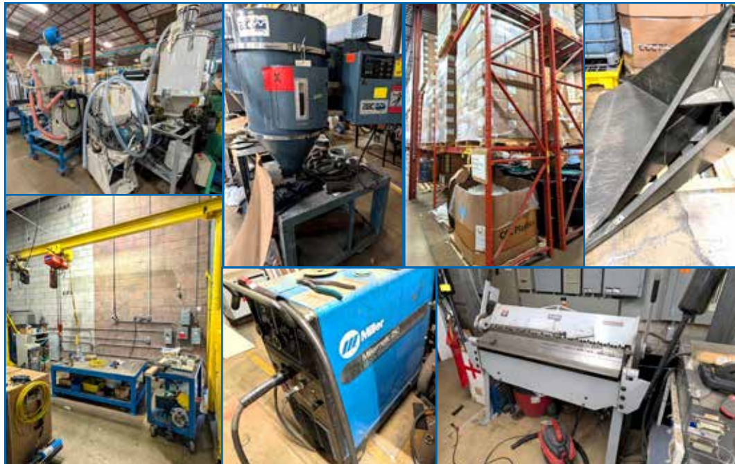
PARTIAL VIEW OF PLANT SUPPORT EQUIPMENT

110 TON MITSUBISHI MODEL 515/100MSII horizontal plastic injection molding machine with approx. 10.6oz shot, approx. 24.0" x 15.75" max mold size, approx. 7.9" mold thickness, 286 cm 3 injection capacity, Year 1989, S/N 2S105033