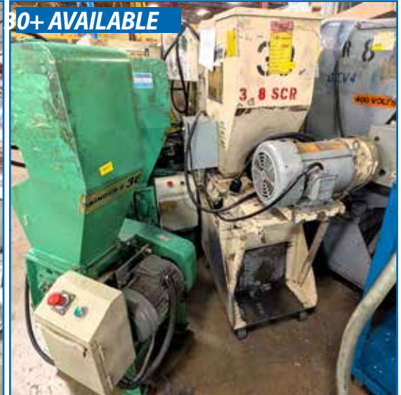
PARTIAL VIEW OF GRANULATORS