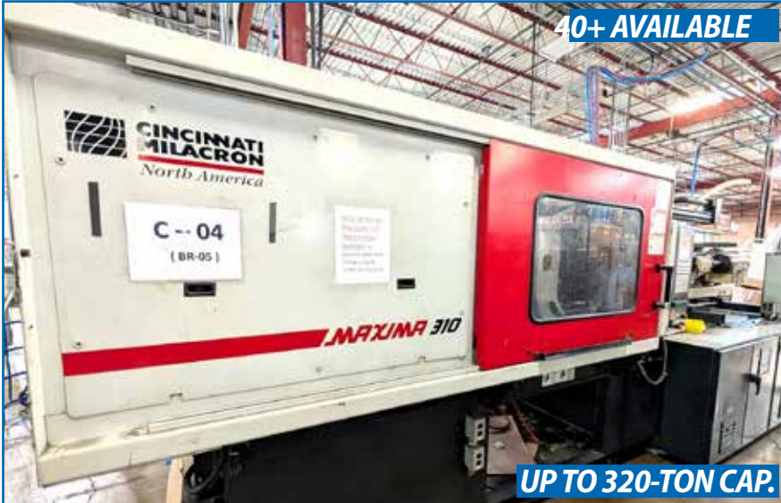
PARTIAL VIEW OF INJECTION MOLDING MACHINES