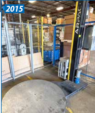
2015 ARPAK PRO-4006-L PALLET STRETCH WRAPPER