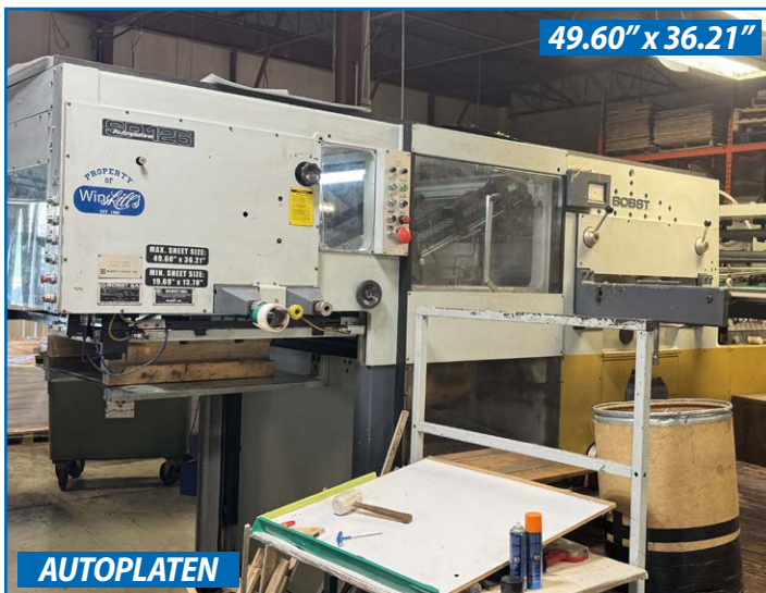
BOBST SP 126-E Die Cutter