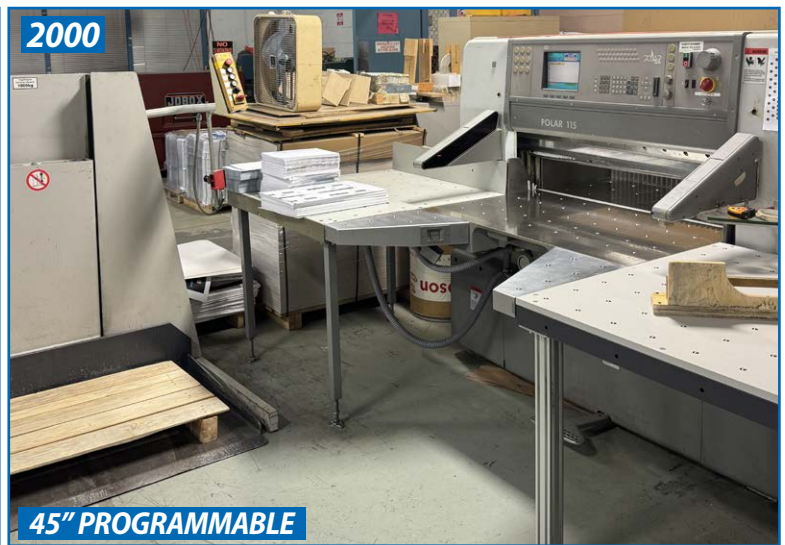
POLAR 115 ED GUILLOTINE