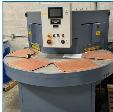
2011 STARVIEW PHS-6-14-18 Blister Sealing Machine 14"x18" Semi-Auto 6-Station Clamshell Sealer s/n 2464