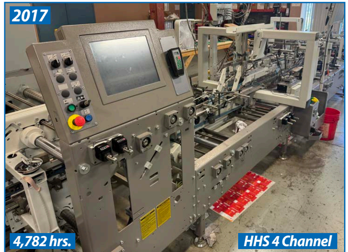
BOBST AMBITION 106 A-1 Folding/Gluing Line