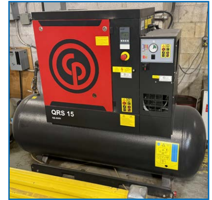
2018 CHICAGO QRS15HPD TM120 15HP rotary screw air compressor with air dryer and tank s/n ITJ714316