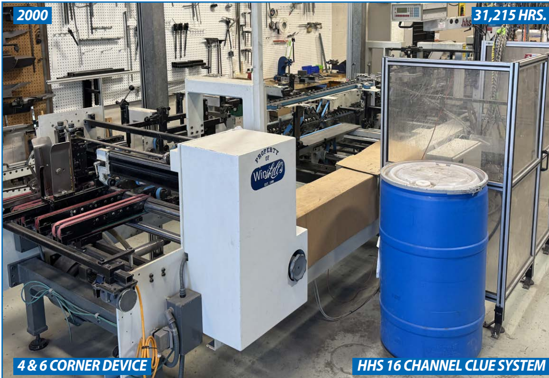
4 & 6 CORNER DEVICE