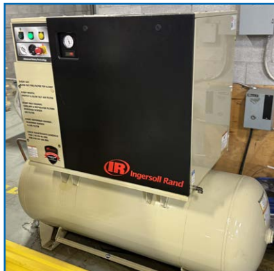
INGERSOLL RAND UP6-10TAS-150 10HP rotary screw air compressor with air dryer and tank