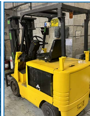
CATERPILLAR 2EC25 Electric forklift s/n A2FC260734