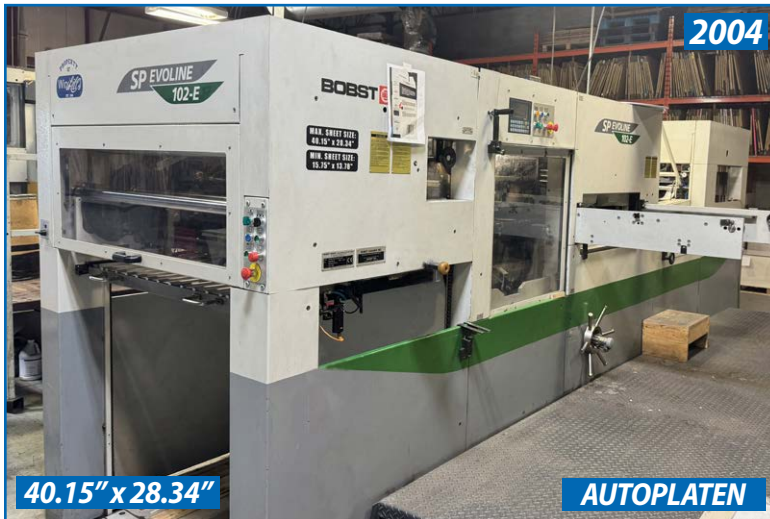
BOBST SP EVOLINE 102-E Die Cutter

1 Select Ave, Scarborough (Toronto), Ontario