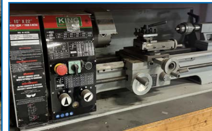
2020 KING KC 1022ML Lathe 10"x22" capacity s/n 202002

Also : FOX Rotary Pallet Wrapper, DICK MOLL Marathon Sprint, DICK MOLL Marathon Regal folding machine, PACKSMART S300 Friction Feeder, (6) Automatic Grommet & Eyelet Machines, Dynatec Hot-Melt & Fugitive Glue Systems, Tape Machines, Mounting Equipment, saws and drill presses, Sealers, Sensors, Pallet Racking, Shelving, Steel Rule Bending & Forming Equipment, Office Desks, Computers, Heavy-Duty Two Door Combination Lock Safe