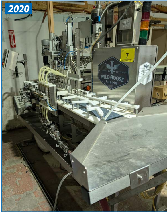
WILD GOOSE 4-HEAD CAN FILLER, MODEL WG4