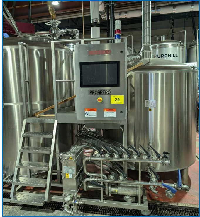
PROSPERO BREWHOUSE – BREW KETTLE AND MASH TUN/HLT