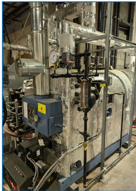
BOILERSMITH LOW PRESSURE STEAM BOILER

AUCTION CLOSES: Thursday May 8 th , 11AM ET