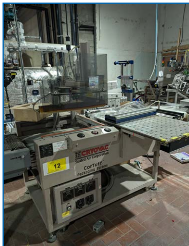
SIGNATURE PACKAGING SHRINK WRAPPER