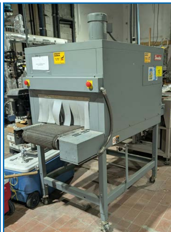
SHANKLIN HEAT SHRINK MACHINE