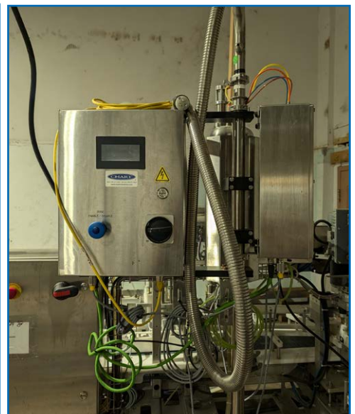
CHART LIQUID NITROGEN DOSER