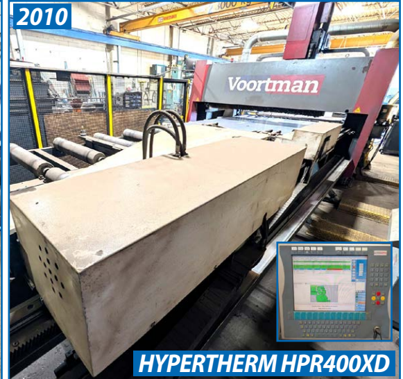
VOORTMAN V320C PLASMA PASS-THROUGH PLATE PROCESSOR