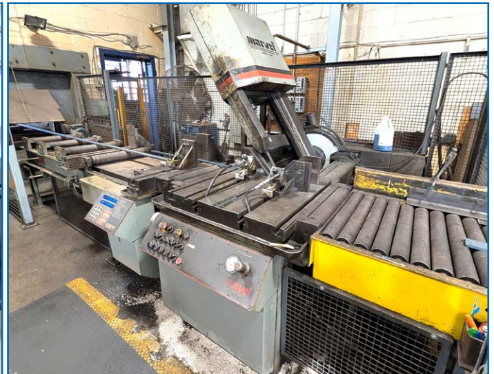
MARVEL SERIES APC VERTICAL BANDSAW