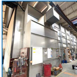
SELECTRA / ELITE AIR SYSTEMS PAINT BOOTH