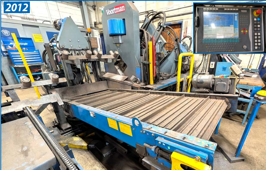
VOORTMAN V505-160M HIGH-OUTPUT FLAT & ANGLE PROCESSING MACHINE

1318 Rymal Road E, Hamilton, ON. & 30 Brentwood Dr., Princeton, ON.