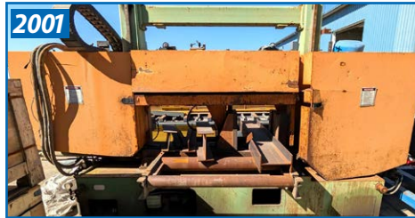
PEDDINGHAUS 44/19-90 BANDSAW