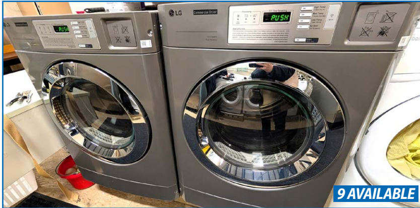
PARTIAL VIEW OF LG, WHIRLPOOL, MAYTAG WASHERS & DRYERS

2018 FORD Transit Cargo Van, VIN# 1FTYR2CM1JKA59969 2010 MULTIMATIC Multi Star GEHC-MS40MS40 Industrial Dry-Cleaning Machine, 40lb Loading Capacity, s/n 40MSHC-R1-1010-7797 2000 ESPORTA ES-3200 8-Load Wash System, Machine Capacity: 8 Sets, s/n ES-32/019/1000 (2) DEXTER Commercial Stainless Steel Gas Dryers, Model DCTD30KCS-10 HUEBSCH Loadstar II Gas Dryer, Model HT035NBCBG2W01 (2) LG Commercial Dryers, Model TLD1840CGS (3) WHIRLPOOL Dryers 2004 CISSELL PS40 SmartSpin Washing Machine, Model IPH60MP21121NRCUSA, s/n 006855