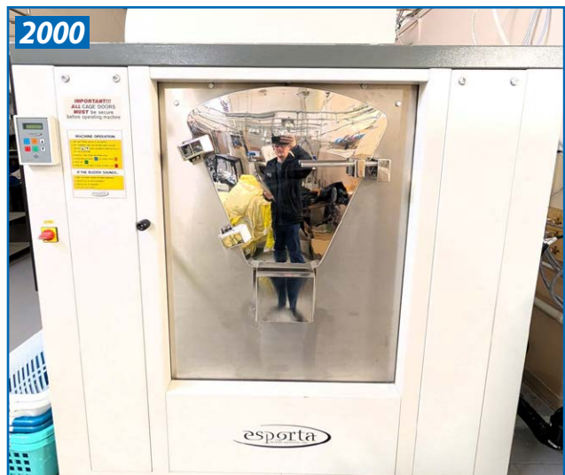
ESPORTA ES-3200 8-LOAD WASH SYSTEM