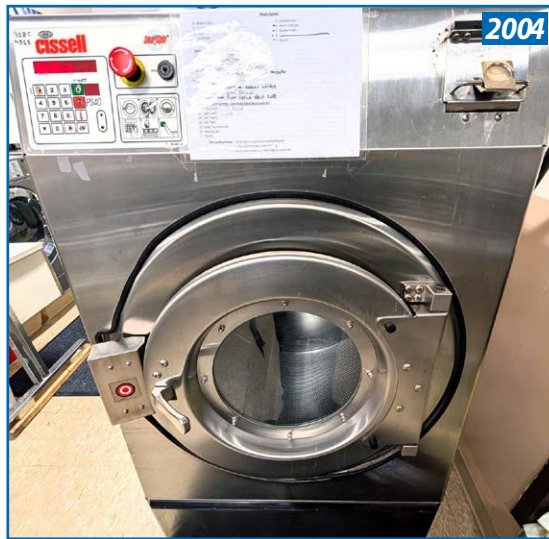
CISSELL PS40 SMARTSPIN WASHING MACHINE

2018 FORD Transit Cargo Van, VIN# 1FTYR2CM1JKA59969 2010 MULTIMATIC Multi Star GEHC-MS40MS40 Industrial Dry-Cleaning Machine, 40lb Loading Capacity, s/n 40MSHC-R1-1010-7797 2000 ESPORTA ES-3200 8-Load Wash System, Machine Capacity: 8 Sets, s/n ES-32/019/1000 (2) DEXTER Commercial Stainless Steel Gas Dryers, Model DCTD30KCS-10 HUEBSCH Loadstar II Gas Dryer, Model HT035NBCBG2W01 (2) LG Commercial Dryers, Model TLD1840CGS (3) WHIRLPOOL Dryers 2004 CISSELL PS40 SmartSpin Washing Machine, Model IPH60MP21121NRCUSA, s/n 006855