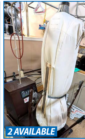
CISSELL CF-600 SUZY STEAM MACHINE

WATERGROUP On Demand Water Softener System (2) PUR AYR R-15 Nano Technology Odour Treatment Machines SINGER Fashion Mate Sewing Machine CAB A4+ Printer REMA RP-3 Vacuum System PLUS: Garment Racking System, (20+) Portable Laundry Tubs, Portable Garment Racks, Metal Shelving, Worktables, Power & Hand Tools, Shop Vacs, Ladders, Storage Trailer, Reznor Gas Heaters, Office & Computer Equipment and Much More!