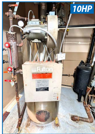
FULTER STEAM BOILER