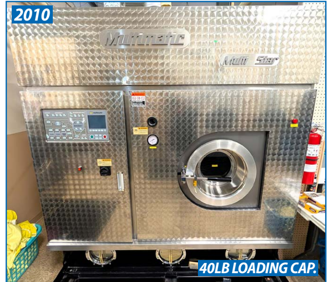
MULTIMATIC MULTI STAR GEHC-MS40MS40 INDUSTRIAL DRY-CLEANING MACHINE