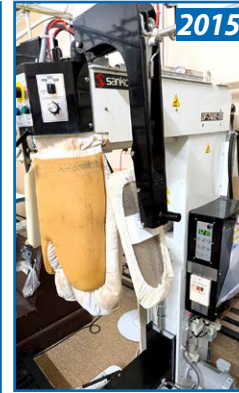
SANKOSHA DF-740U-V3 TENSIONING PANT TOPPER

(3) WHIRLPOOL Washing Machines MAYTAG Washing Machine 2015 SANKOSHA DF-740U-V3 Tensioning Pant Topper, s/n DF740UV3-X0244 (2) CISSELL CF-600 Suzy Steam Machines UNIPRESS 45" Utility Press, Model 45RX, s/n 2173072 NEWYORKER 42" Utility Press, Model REMAA-42, s/n 124069