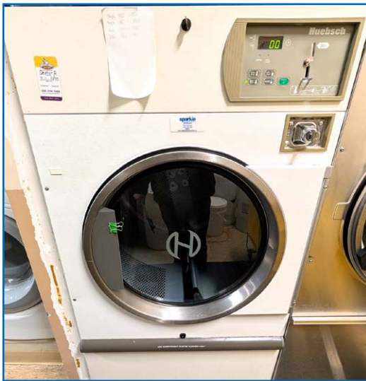
HUEBSCH LOADSTAR II GAS DRYER