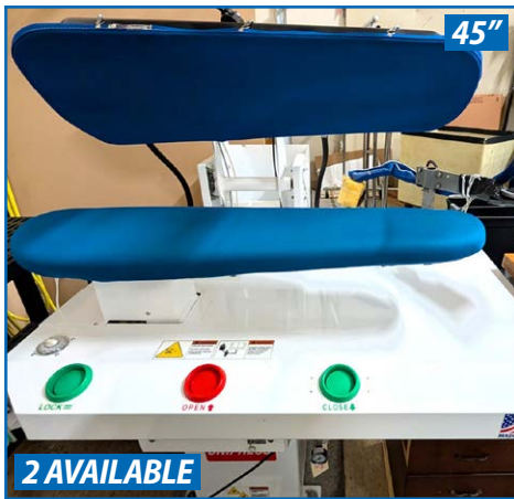
UNIPRESS 45RX UTILITY PRESS

CISSELL Steam Topper Machine CISSELL Steam Spotting Machine FULTON Steam Boiler, 10HP w/ Condenser Tank INGERSOLL RAND 2340L5 Piston Type Air Compressor, 5HP, 60-Gal, s/n 0908270043 2026 JOHN WOOD 50-Gal Water Heater, Model PV50N 200, Natural Gas