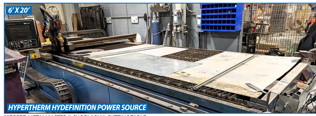
MESSER METALMASTER II CNC PLASMA CUTTING TABLE