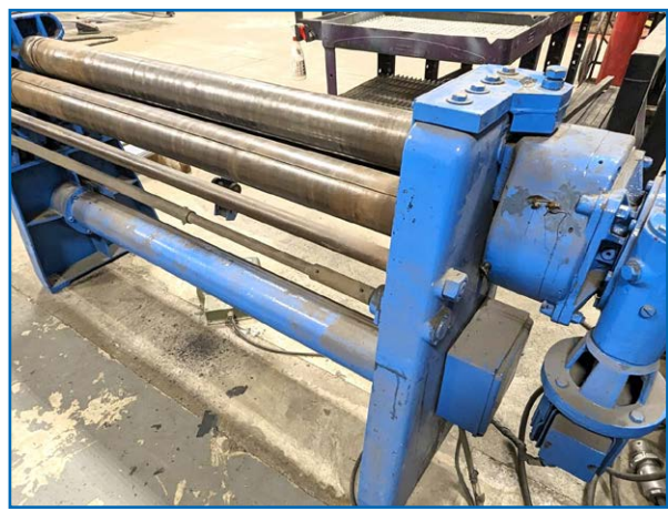
LUNA 8266/15/40 PLATE ROLLS