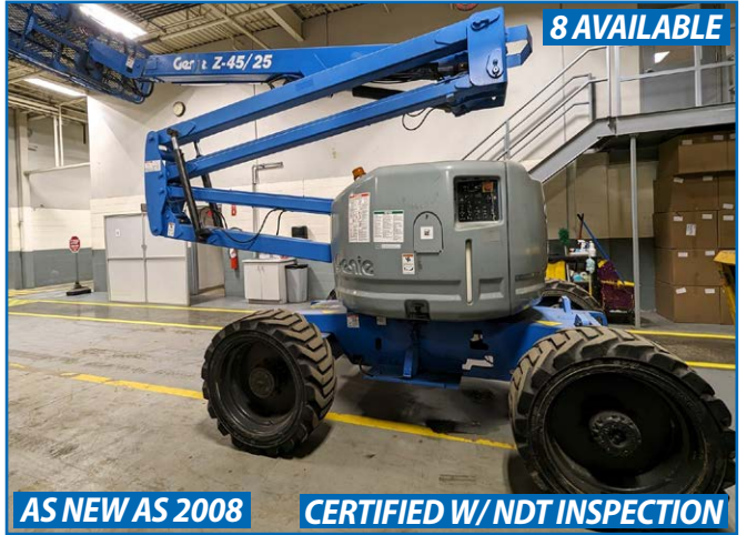
PARTIAL VIEW OF GENIE ARTICULATED BOOM LIFTS