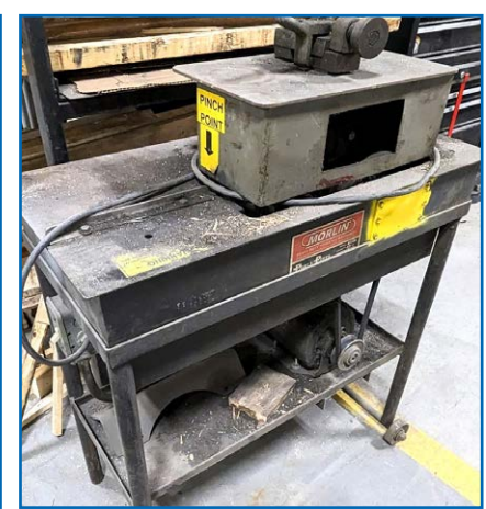
MORLIN PORTA PITTS 2400 24GA ROLL FORMER PARTIAL VIEW OF DEMAG & BUDGIT HOISTS