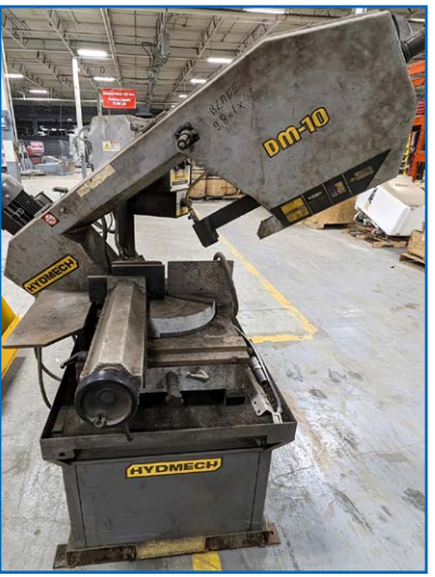
HYD-MECH DM-10 BANDSAW