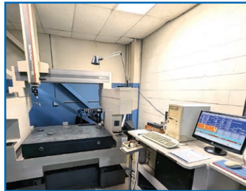
MITUTOYO FN-1106 CMM