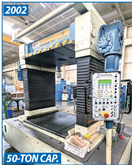
2002 50-TON CAP. MILLUTENSIL BV28E SPOTTING PRESS