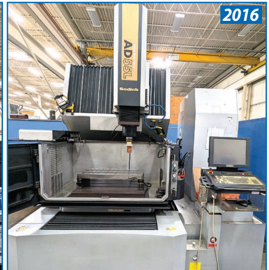
SODICK AD55L SINKER EDM

CLOSES: Thursday February 20 th , 10AM ET