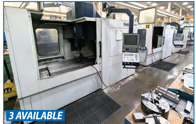
3 AVAILABLE PARPAS PHS 812 CNC VERTICAL MACHINING CENTERS