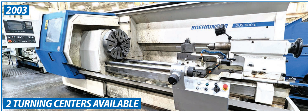
2003 2 TURNING CENTERS AVAILABLE VDF BOEHRINGER DUS 800TI CNC TURNING CENTER