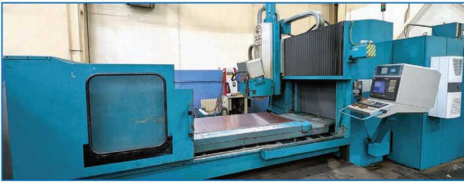
PARPAS P1200 CNC HYDRAULIC SURFACE GRINDER