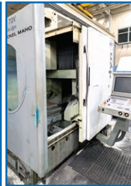
DECKEL MAHO DMC 70V CNC MACHINING CENTER