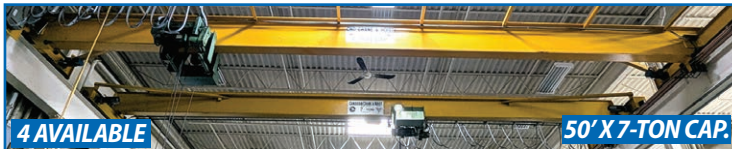
PARTIAL VIEW OF CANADIAN CRANE BRIDGE CRANES