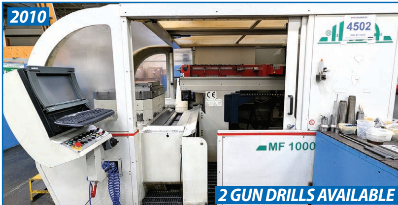
2010 2 GUN DRILLS AVAILABLE IMSA MF1000AF CNC GUN DRILL