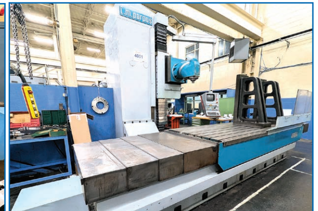
PARPAS SL100/3000 CNC UNIVERSAL MILL