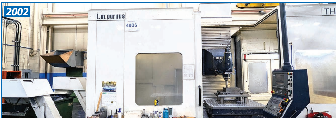
PARPAS THS 125/2000 CNC 2-SPINDLE 4-AXIS CNC VERTICAL MACHINING CENTER

SALE CONDUCTED IN USD. Visit infinityassets.com for complete specifications. Bid Online at BidSpotter.com