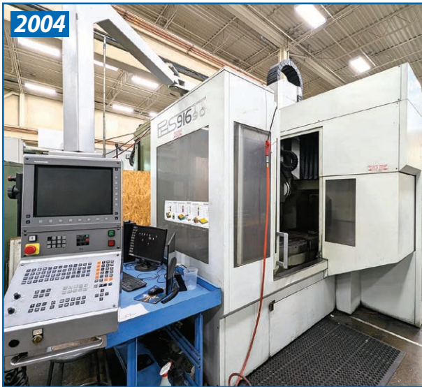
2004 PARPAS (FAMU) PHS 916TT90 CNC 5-AXIS MACHINING CENTER