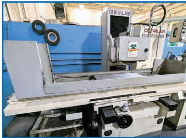
CHEVALIER FSG-1224AD AUTO HYDRAULIC SURFACE GRINDER