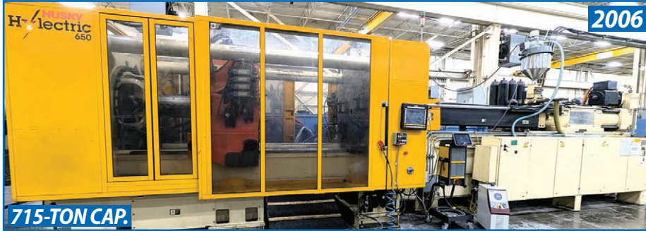
HUSKY ELECTRIC 650 INJECTION MOLDER