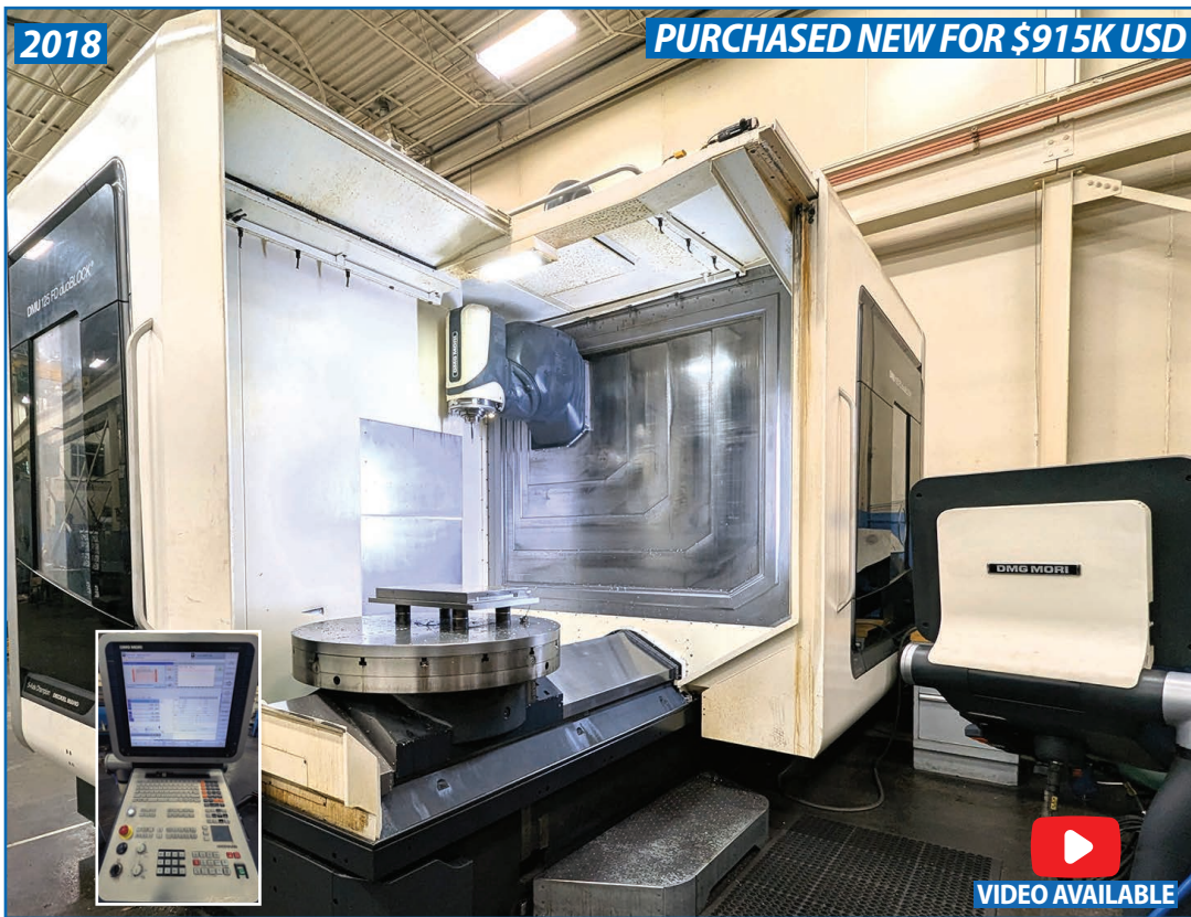
DMG MORI DMU 125 FD DUOBLOCK 5-AXIS CHAMPION CNC MACHINING CENTER