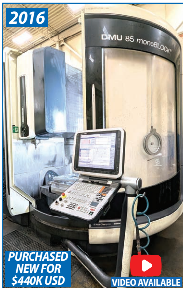
DMG MORI DMU 85 MONOBLOCK 5-AXIS CHAMPION CNC MACHINING CENTER

DECKEL MAHO DMC 70V Machining Center, Heidenhain CNC Control, s/n 28810008092