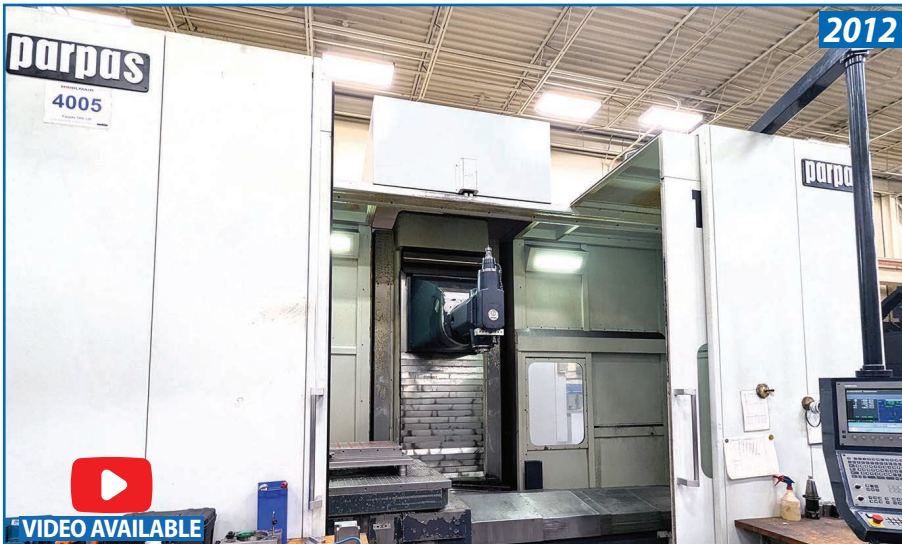
PARPAS THS 120X CNC 2-SPINDLE 4-AXIS CNC VERTICAL MACHINING CENTER