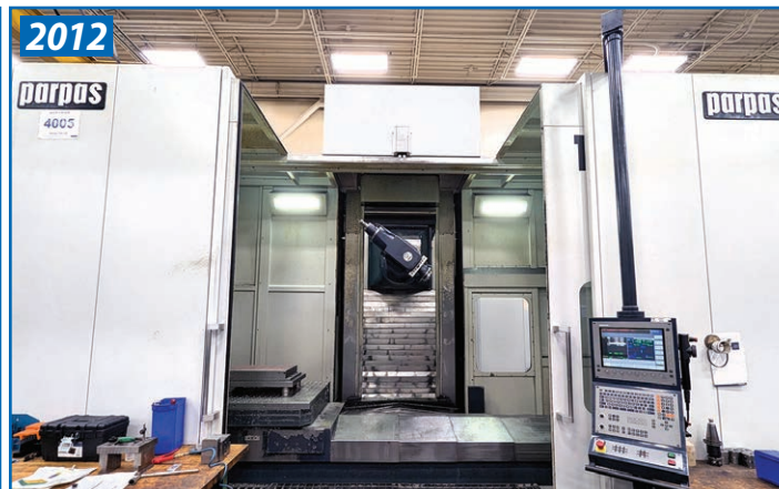
PARPAS THS 120X CNC 2-SPINDLE 4-AXIS CNC VERTICAL MACHINING CENTER