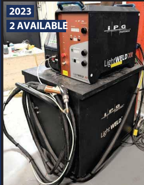
2023 2 AVAILABLE IPG LHW-1500-XR-10 PORTABLE LASER WELDING AND CLEANING SYSTEMS W/ AUTO TIG WIRE FEEDER