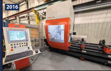
2016 ELUMATEC SBZ151 CNC 5 AXIS PROFILE MACHINING CENTER