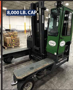
8,000 LB. CAP COMBI-LIFT CL20080LA47