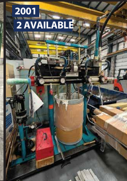
2001 2 AVAILABLE HG 437 BIG BEAR DUAL COMPONENT DISPENSING SYSTEM