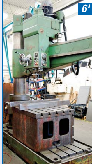
STANKO 2M55 RADIAL ARM DRILL