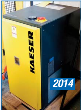
2014 KAESER TCH-32 AIR DRYER