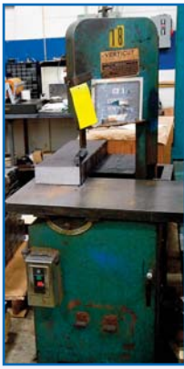
VERTICUT 114-A ROLL-IN