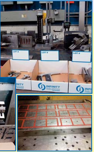
VIEW OF TOOLING