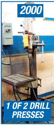
2000 CYCLEMATIC S-245 DRILL PRESS