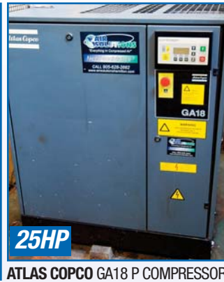
25HP ATLAS COPCO GA18 P COMPRESSOR