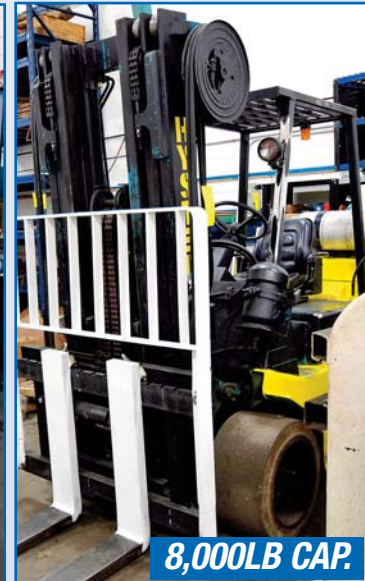
HYSTER S120XLS PROPANE FORKLIFT