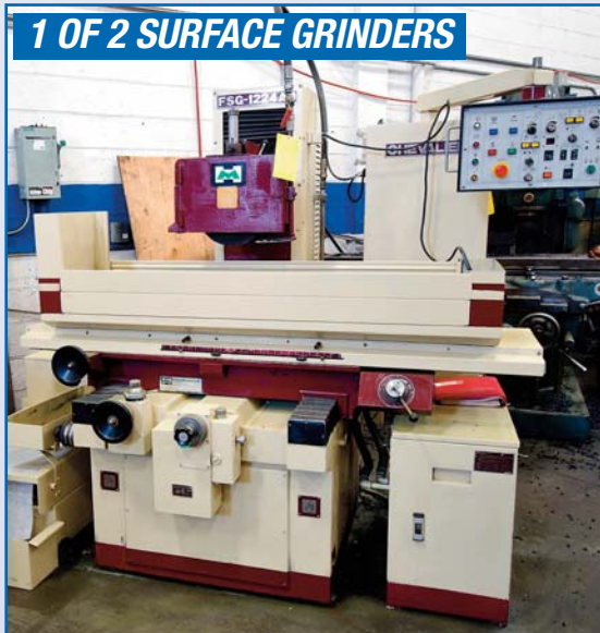
CHEVALIER FSG1224AD HYDRAULIC AUTOMATIC SURFACE GRINDER