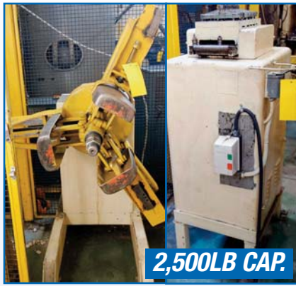
UNCOILER & FEEDER/STRAIGHTENER