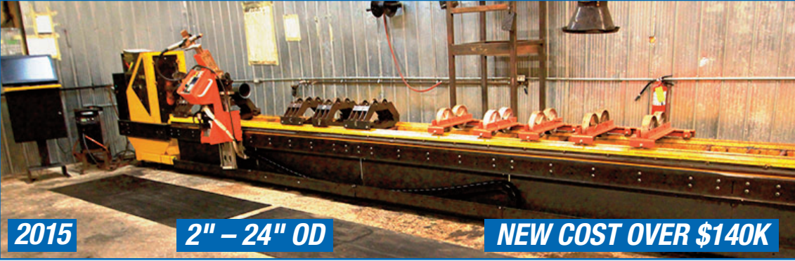
WATTS SPECIALIST INC. W-122 CNC PLASMA PIPE CUTTING SYSTEM