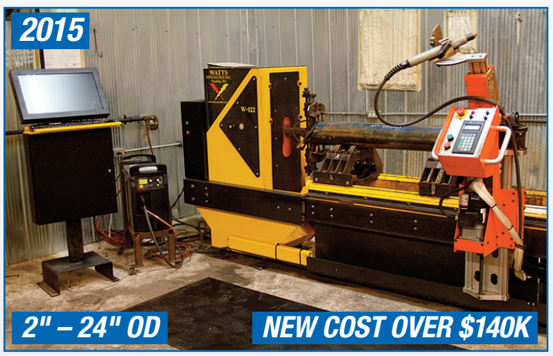
WATTS SPECIALIST INC. W-122 CNC PLASMA PIPE CUTTING SYSTEM