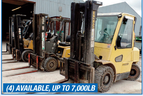
PARTIAL VIEW OF HYSTER/YALE/CAT/TOYOTA FORKLIFTS