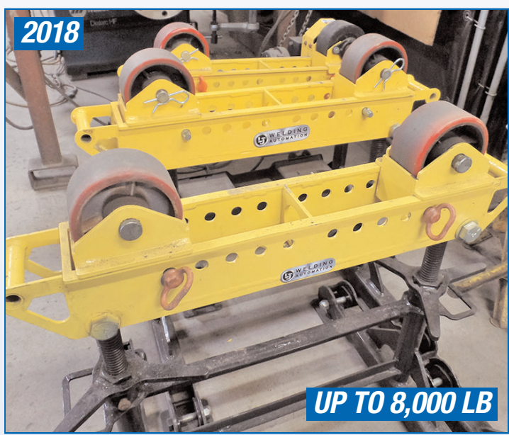
LJ AUTOMATION TANK TURNING ROLLS