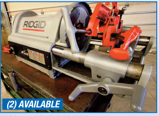
RIDGID 1224 POWER THREADERS