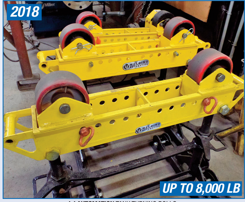
LJ AUTOMATION TANK TURNING ROLLS