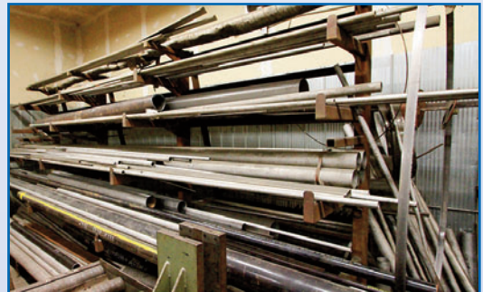
PARTIAL VIEW OF S/S PIPE & INVENTORY