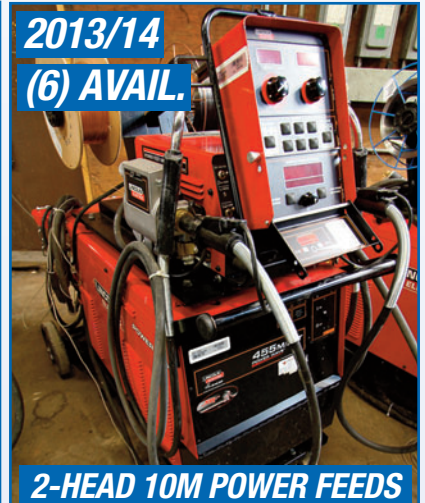
LINCOLN ELECTRIC POWERWAVE 455/STT MIG WELDERS