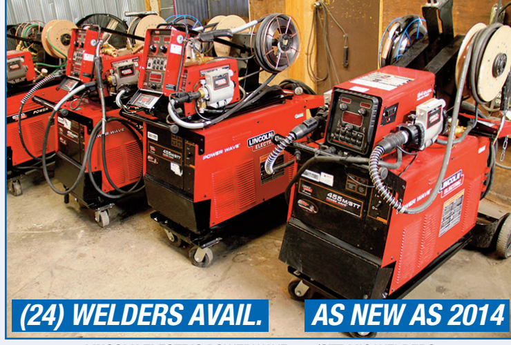
LINCOLN ELECTRIC POWERWAVE 455/STT MIG WELDERS