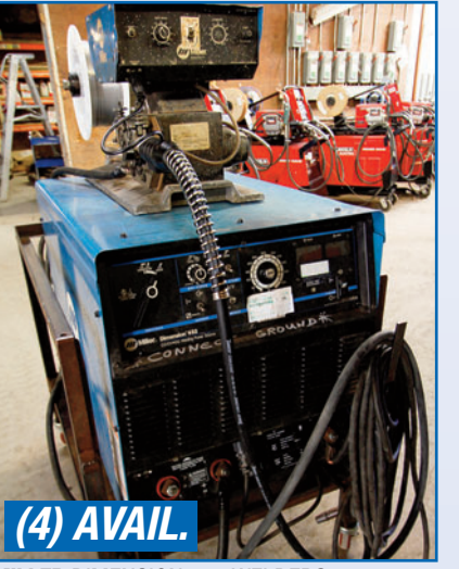
MILLER DIMENSION 452 WELDERS