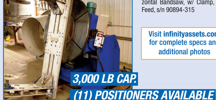
VERNER VD-3000 WELDING POSITIONER

Visit infinityassets.com for complete specs and additional photos