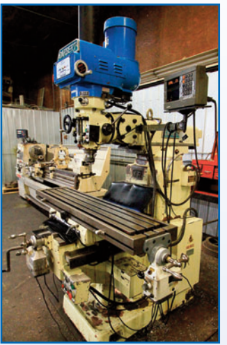
DARBERT VERTICAL MILL