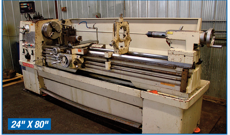
MAXTURN 2180 LATHE