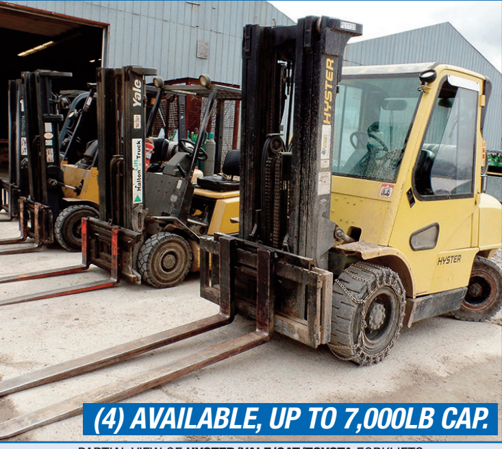
PARTIAL VIEW OF HYSTER/YALE/CAT/TOYOTA FORKLIFTS