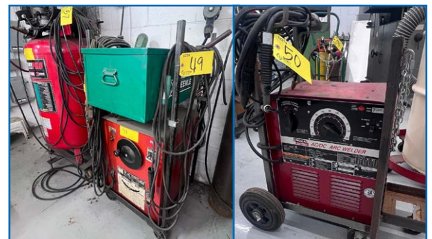
PARTIAL VIEW OF WELDERS

2021 KING INDUSTRIAL KC-712B Horizontal Bandsaw