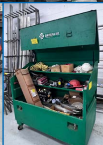
PARTIAL VIEW OF PLANT SUPPORT EQUIPMENT

KOMATSU FG30SHT12 Propane Forklift, 5,410lb Cap., 183" Max Lift, 3-Stage Mast, Outdoor Tires, Side Shift, s/n 560519A