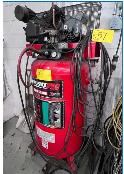
HUSKY PRO COMPRESSOR