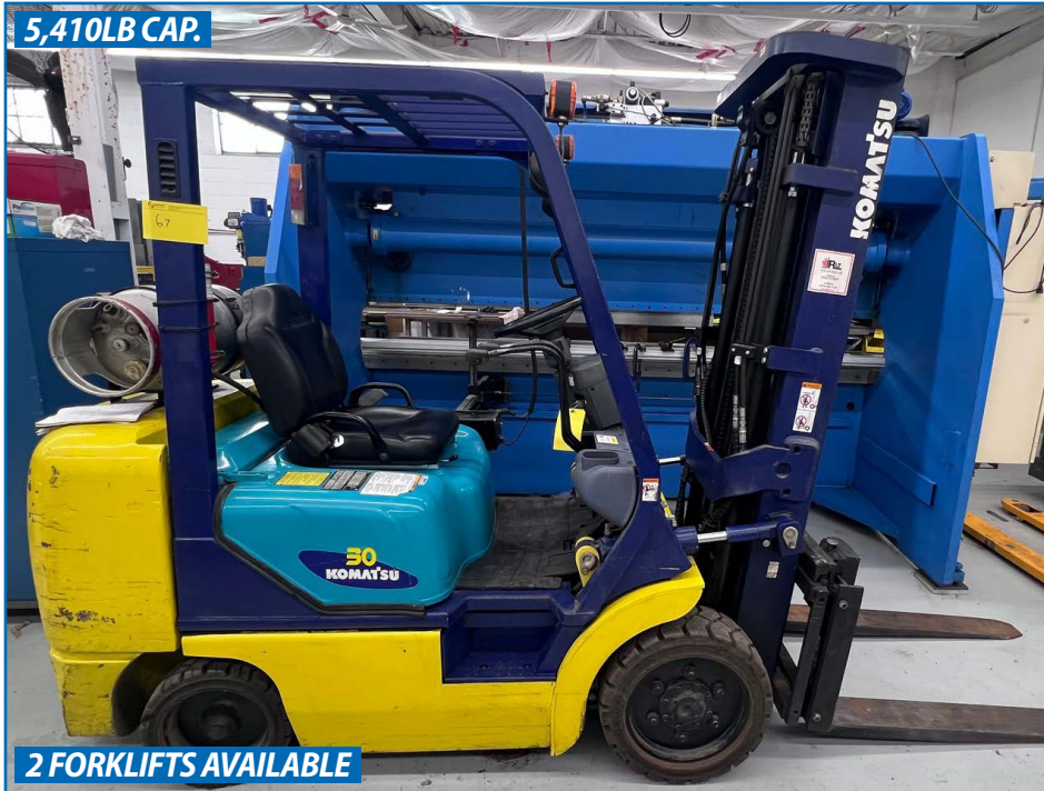
KOMATSU FG30SHT12 FORKLIFT