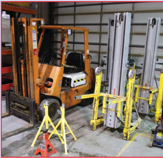
VIEW OF TOYOTA 5,000 LB FORKLIFT, 4 GENIE LIFTS, JACKS ETC.