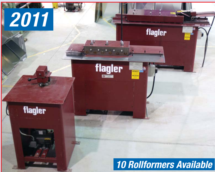
VIEW OF 3 FLAGLER ROLLFORMERS