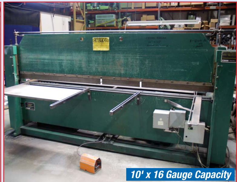
ROTO DIE PRESS BRAKE MODEL No 10

AUCTION: Wednesday February 20, 10:30 am