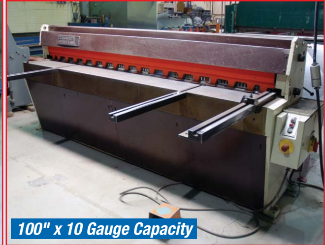
EDWARDS LOW PROFILE SHEAR MODEL 3.5/3500