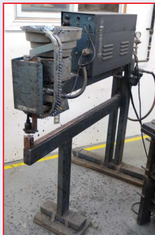
DURODYNE PINSPOTTER MODEL FG-1