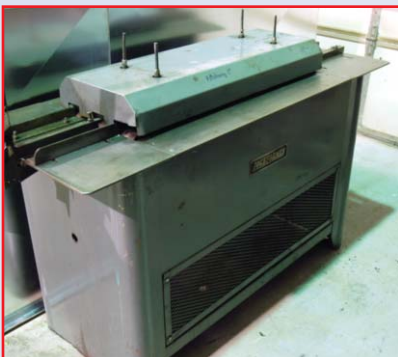
LOCKFORMER MODEL 22SS HEAVY DUTY PITTSBURGH LOCKFORMER