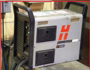
LOCKFORMER 5'X10' PLASMA CUTTER, MODEL VULCAN 1000