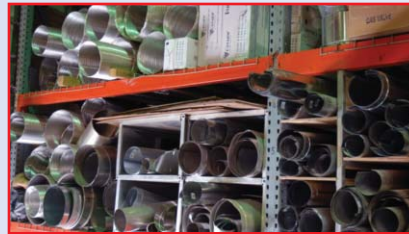
PARTIAL VIEW ASSORTED INVENTORY