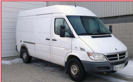
DODGE SPRINT 2500