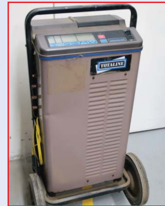
REFRIGERANT RECOVERY SYSTEM