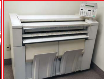
XEROX 3050 WIDE FORMAT PRINTER

Acetylene Torch Sets, Valves, Gauges, Hoses, Clamps, Welding Screens