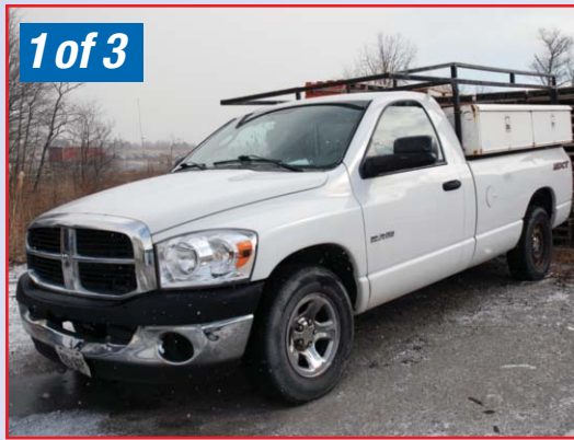
1 of 3 DODGE RAM 1500 PICKUP TRUCKS