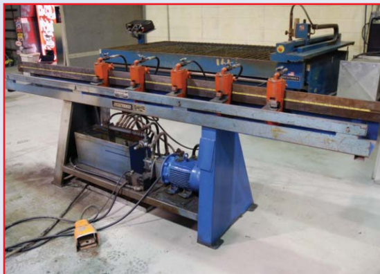
LOCKFORMER 5 HEAD DUCT NOTCHER, MODEL No 16