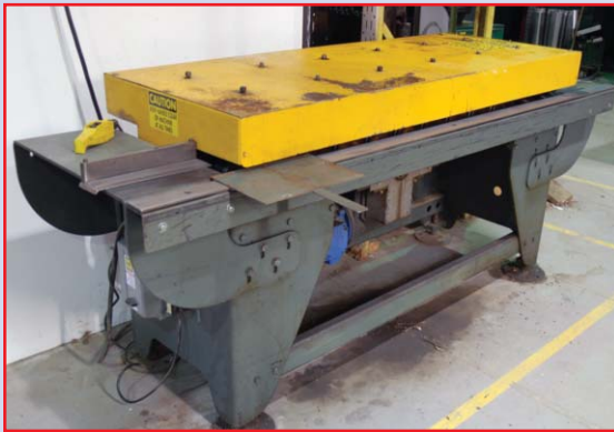
ENGEL 12 STAND TDF ROLLFORMING MACHINE MODEL HB-1246