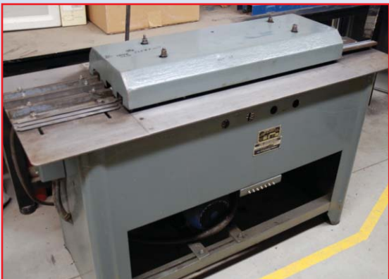
LOCKFORMER 3 IN 1 ROLLFORMER