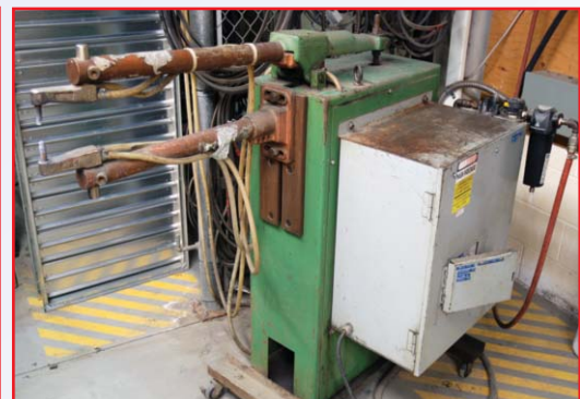
WELDOMATIC 25 KVA SPOT WELDER