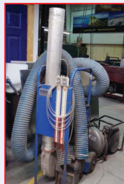
MCGILL AIRFLOW LEAK DETECTIVE