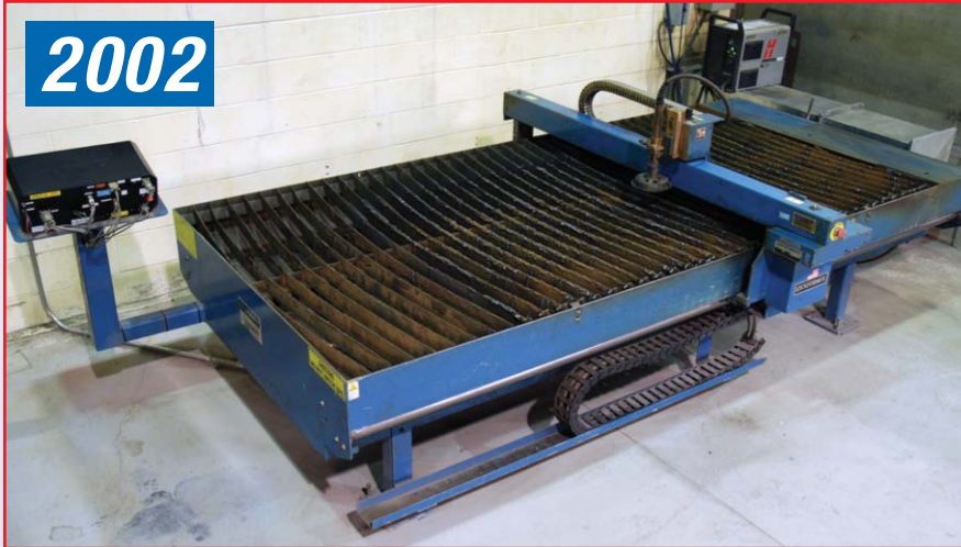
LOCKFORMER 5'X10' PLASMA CUTTER, MODEL VULCAN 1000