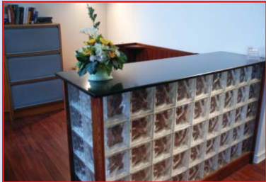
PARTIAL VIEW OF OFFICE FURNITURE