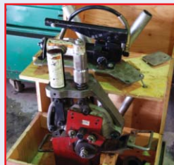
VICTAULIC HEAVY DUTY PIPE & FITTING GROOVER