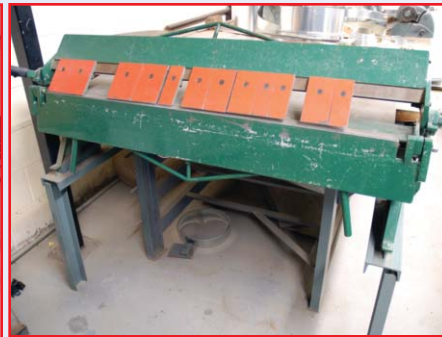
4' FINGER BRAKE