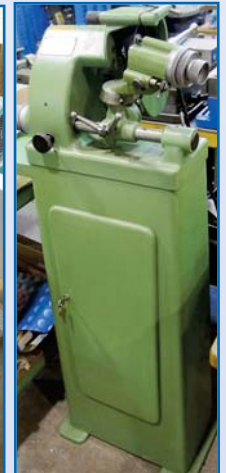
DECKEL S0 TOOL CUTTER GRINDER