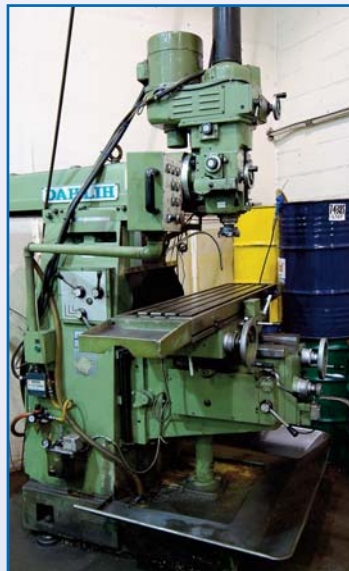
DAHLIHL DL-GHP50 VERTICAL/ HORIZONTAL MILL