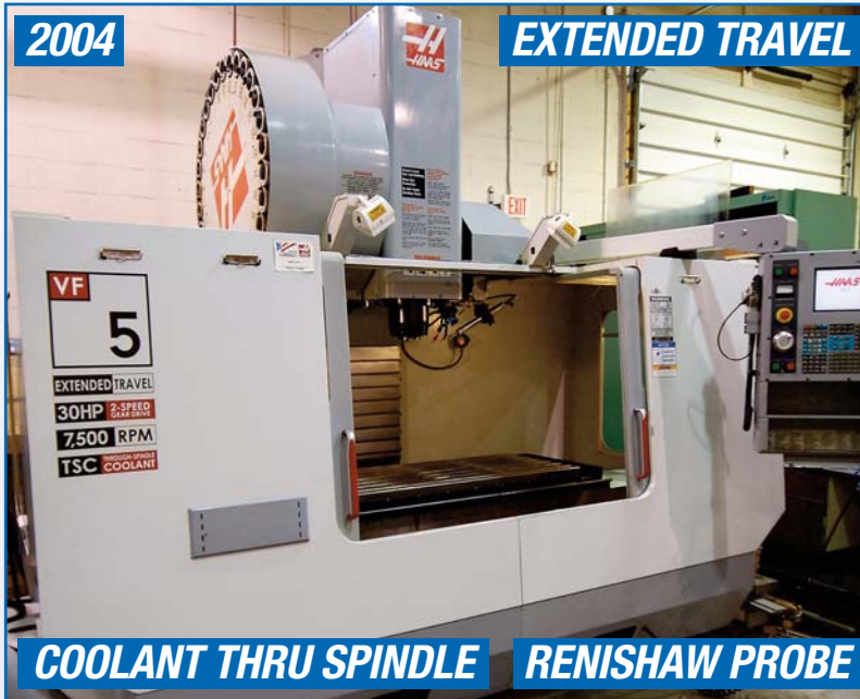
HAAS VF-5/50XT CNC VERTICAL MACHINING CENTER