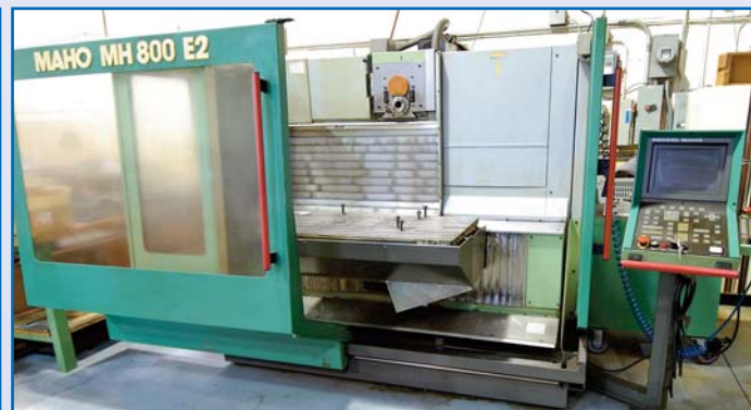
MAHO MH 800 EW CNC UNIVERSAL MILL

Visit infinityassets.com for complete specs and additional photos