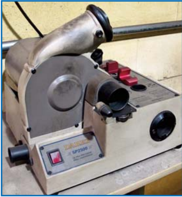
DAREX SP2500 DRILL SHARPENER