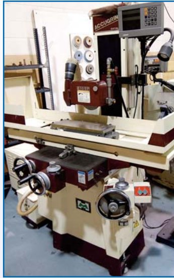
CHEVALIER ACCUGRIND SURFACE GRINDER