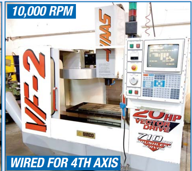
HAAS VF2 CNC VERTICAL MACHINING CENTER