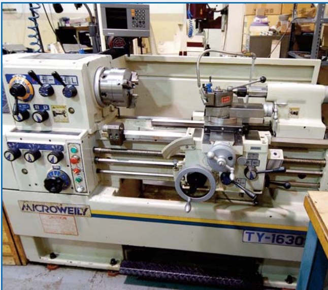
MICROWEILY TY-1630S LATHE

CATERPILLAR GC25 Propane Forklift, 4,700lb Cap., 190" Max Lift, 3 Stage Mast, Side Shift, s/n 5EM90049