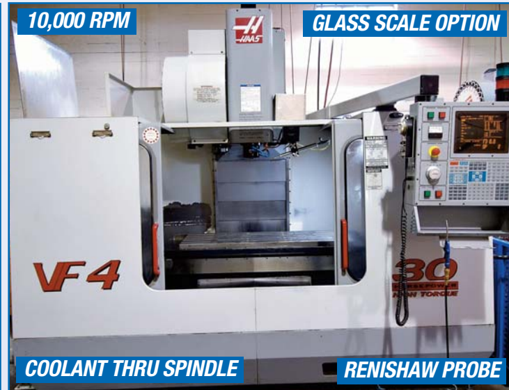
HAAS VF4 CNC VERTICAL MACHINING CENTER