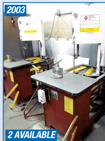
BAXTER VERTICUT 115B ROLL-IN BANDSAW