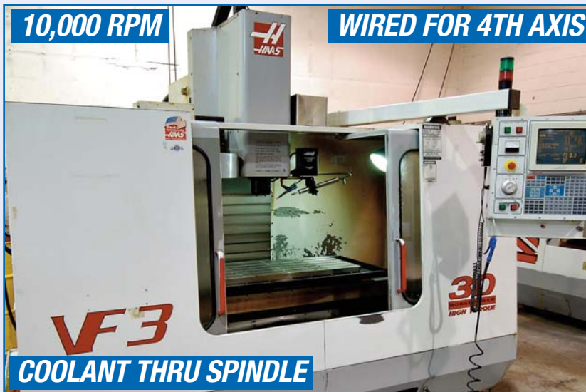
HAAS VF3 CNC VERTICAL MACHINING CENTER