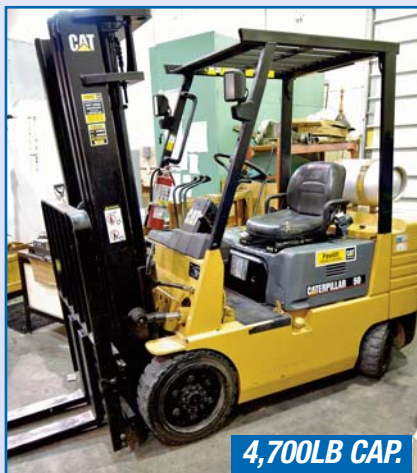
CATERPILLAR GC25 PROPANE FORKLIFT