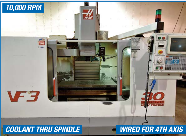
HAAS VF3 CNC VERTICAL MACHINING CENTER