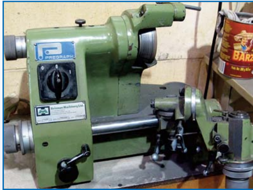
PREGRAPH TOOL CUTTER GRINDER