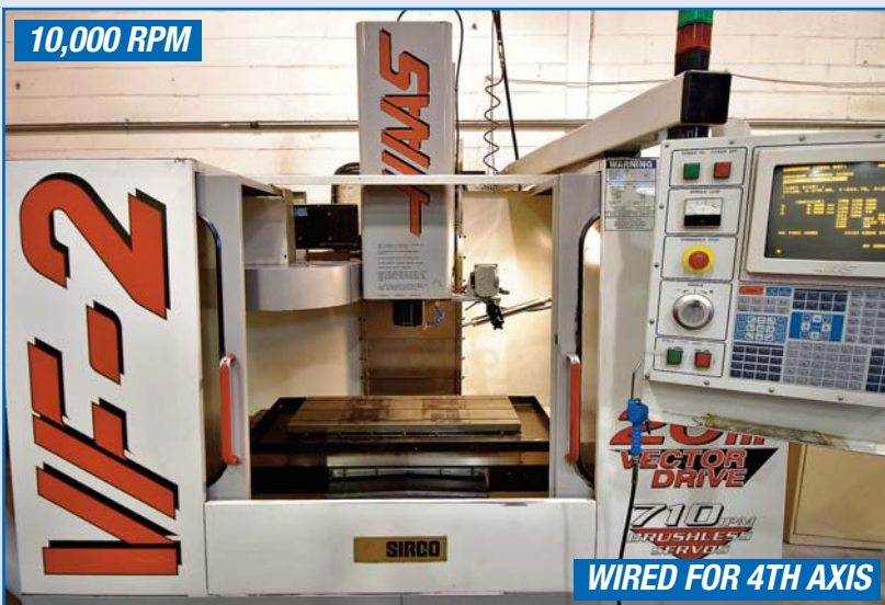
HAAS VF2 CNC VERTICAL MACHINING CENTER