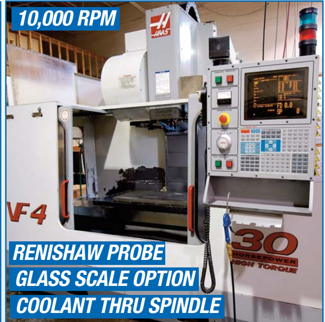
HAAS VF4 CNC VERTICAL MACHINING CENTER