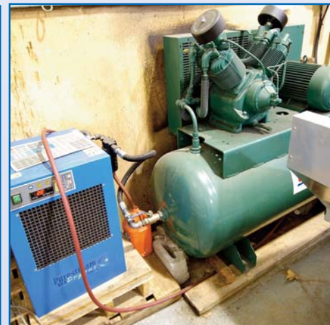
CHAMPION AIR COMPRESSOR W/ DRYER