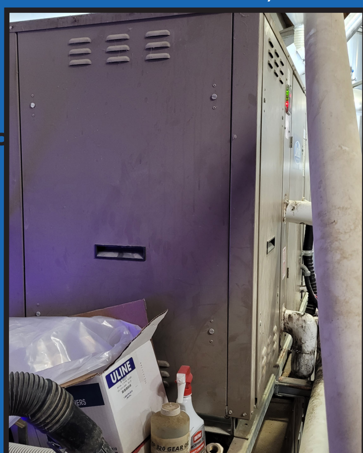
DRAKE REFRIGERATION Chiller