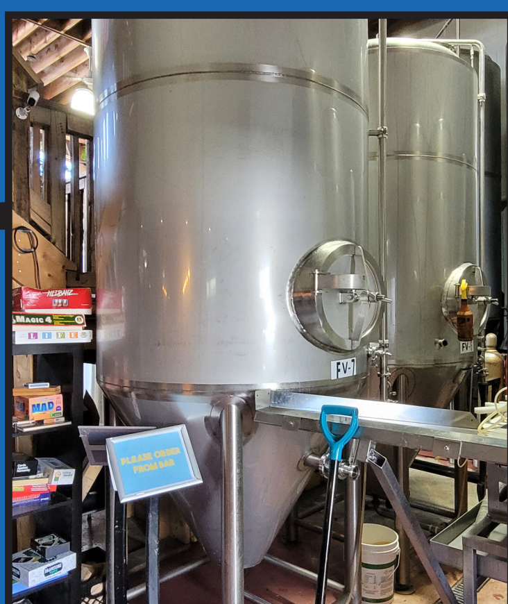
Partial View of FV and BBT Tanks