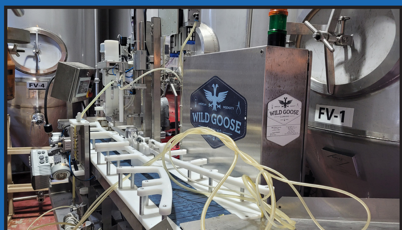
2019 WILD GOOSE WG1 Single Head Evolution Automated Canning Line, s/n WGC-0807, up to 50 Cans/min.