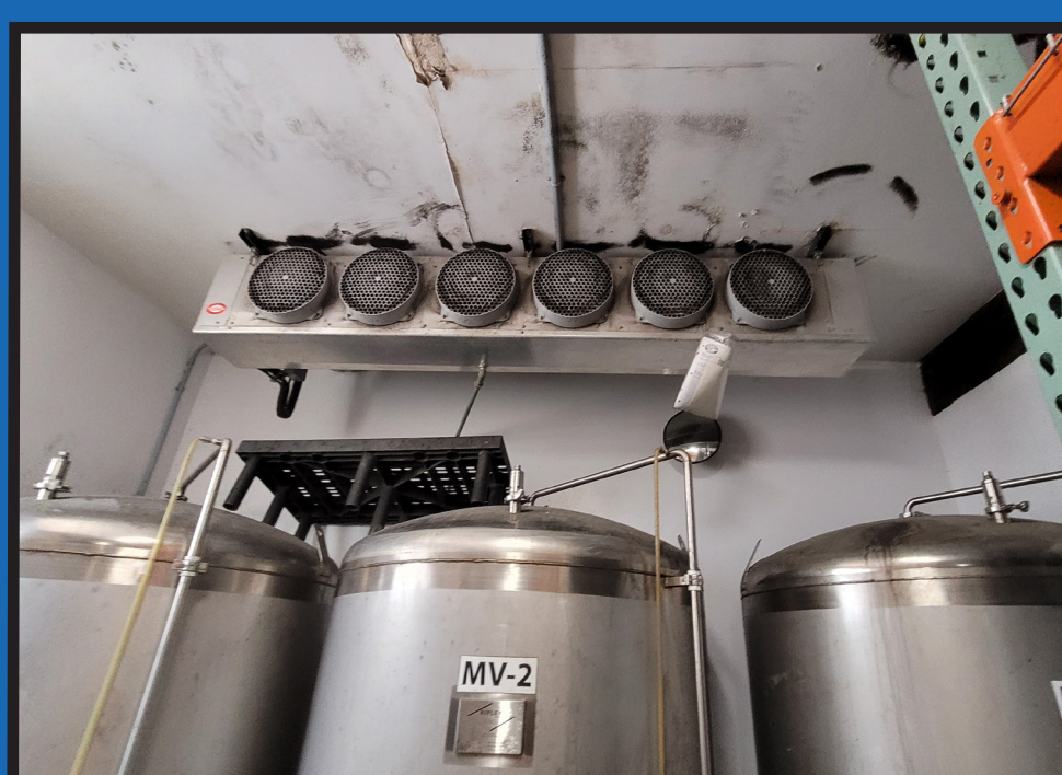
PARTIAL VIEW OF REFRIGERATION EQUIPMENT

FEATURING: 3-vessel 20 HL Brewhouse consisting of RIPLEY STAINLESS C30 Mash Tun and Lauter Tun • Brewing Kettle • Hot Liquor Tank • (3) Pumps • ALFA LAVAL M6 Heat Exchanger • System Control Panel • Catwalk Structure • CIP Liquid Transfer Pump • RIPLEY STAINLESS Pressure Tanks • WILD GOOSE Canning Line • CEM Manual Filler • Keg Washer • Chiller • Filtration System • Steam Boiler • Batch Code Printer • Beer Kegs • Much More