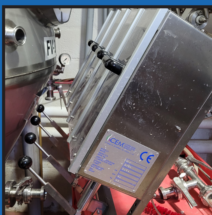
2018 CEM (COSTRUZIONI ENOLOGICHE) 4V-4L 4-Head Isobaric Manual Filler, s/n 6367