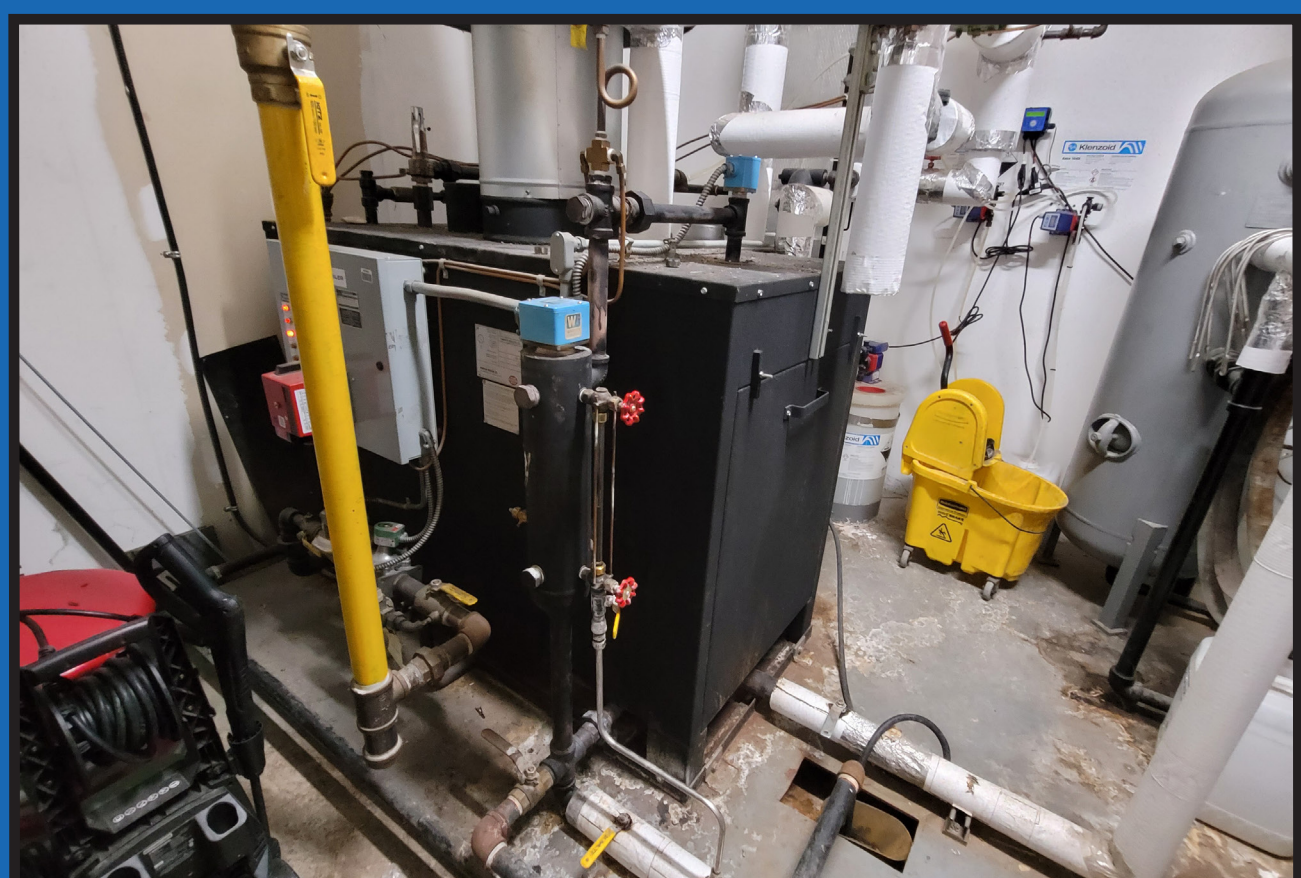
PARKER BOILER High Pressure Steam Boiler - Model 103-20, 20HP Steam Capacity, Natural Gas, 860,000 BTU, s/n 967587