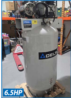
DELTA 2-STAGE COMPRESSOR

2023 CHEVROLET Colorado Trail Boss Pickup Truck, VIN# 1GCPTEEK5P1158920, Approx. 37,402kms, Crew Cab, 4WD, Gas, 4-Cylinder 2016 CADILLAC XTS4 Luxury Sedan, VIN# 2G61N5S36G9210163, Approx. 140,811kms, V6 VVT Direct Injection Engine 2017 FORD Transit 350 HD Box Truck, VIN# 1FDBF9PV0HKA43942, Approx. 88,998kms, Power Stroke Turbo Diesel, 16' Box Gas Powered Pocket Motorcycle 2018 LAGUNA DT-18 Continuous Dovetailer, s/n 1805017 KING INDUSTRIAL 6" x 108" Oscillating Edge Sander, Model KC-108-OSC 2024 Automatic Gyroscopic Mixed Model 50-H82 DELTA 175 PSI 6.5HP 80 Gal 2-Stage Compressor PLUS: Amazon Pallet Returns, General Woodworking Power & Hand Tools, NHL Trading Cards, Barbies, Collectibles, Pallet Racking, Storage Trailers, TV's, Furniture, Gym Equipment and Much More!