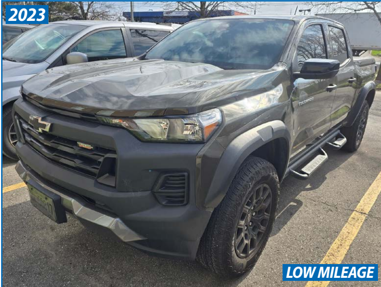
CHEVROLET COLORADO TRAIL BOSS PICKUP TRUCK

45 Bowes Road, Unit 12, Concord, Onatrio