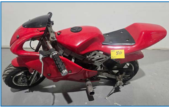
GAS POWERED POCKET MOTORCYCLE