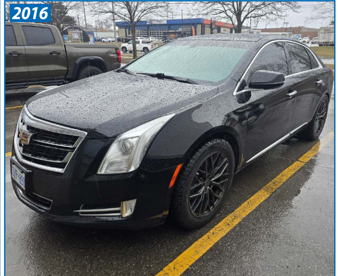
CADILLAC XTS4 LUXURY SEDAN