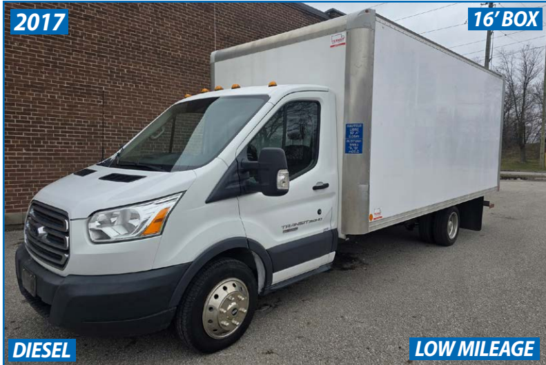
FORD TRANSIT 350 HD BOX TRUCK