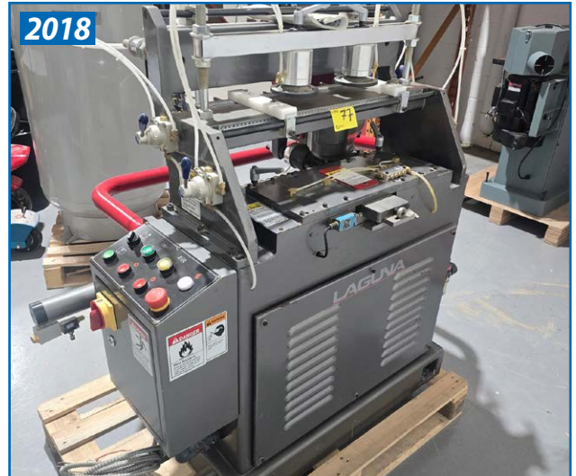
LAGUNA DT-18 CONTINUOUS DOVETAILER