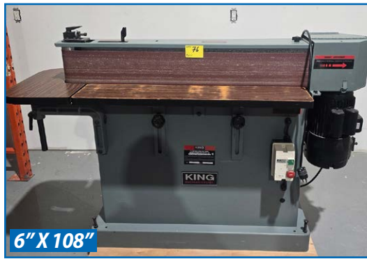
KING INDUSTRIAL KC-108-OSC OSCILLATING EDGE SANDER