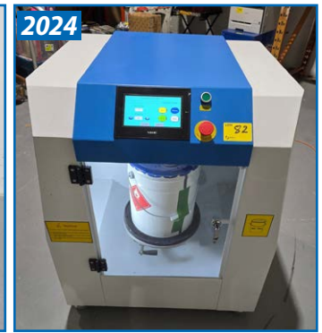
2024 AUTOMATIC GYROSCOPIC MIXED MODEL 50-H82