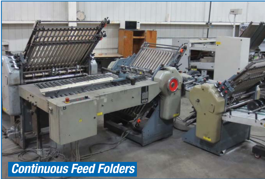
Continuous Feed Folders

20 & 30 Rolark Drive Scarborough (Toronto), Ontario, Canada