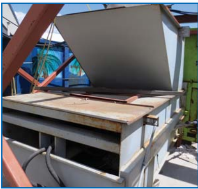
HYDRA PAK 1500 COMPACTOR