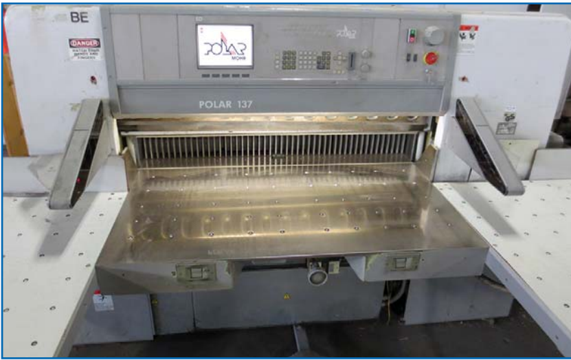
2000 POLAR 137ED 54" PROGRAMMABLE PAPER CUTTER