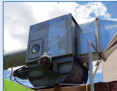
DANSEP 12 WASTE SEPARATOR