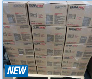
NEW DURA PRO HOT MELT RAW MATERIAL