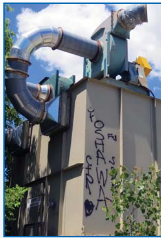
MURPHY 25HP DUST COLLECT