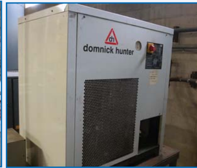
DOMNICK HUNTER AIR DRYER