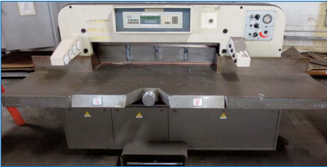
MANDELLI GERGEK 45" PROGRAMMABLE PAPER CUTTER