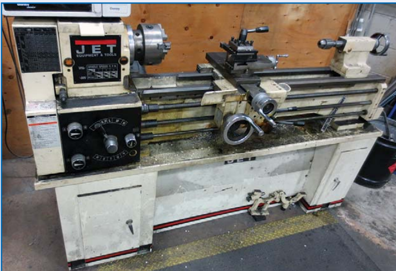
JET TOOL ROOM LATHE