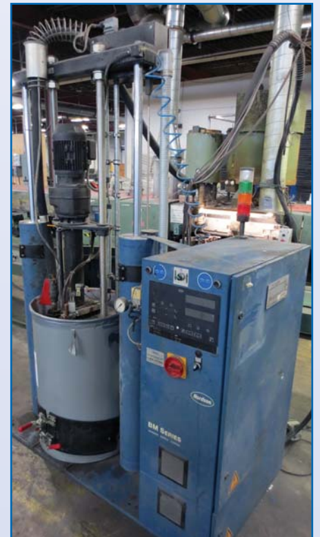
2005 NORDSON BM200 MELTER