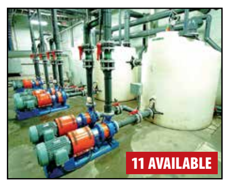
SUMMIT 10 HP PUMPS, SYSTEM #1