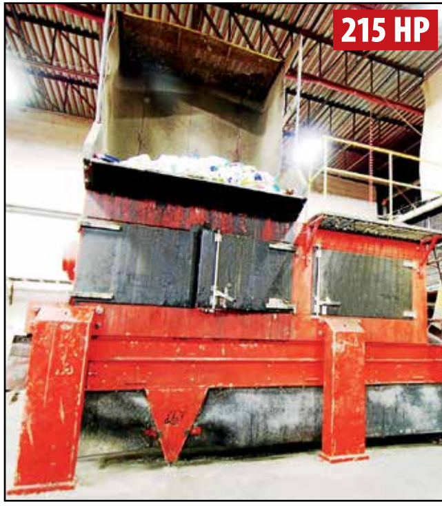
2012 BANO MAC S 2200/700 SINGLE-SHAFT SHREDDER