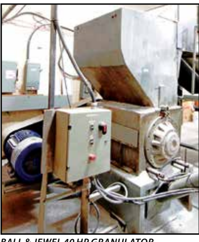
BALL & JEWEL 40 HP GRANULATOR