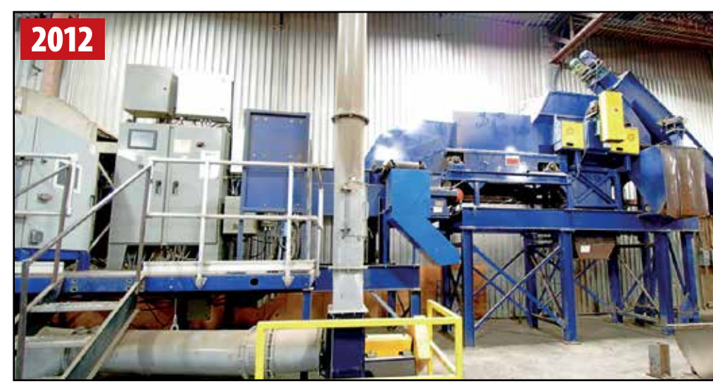
SHERBROOKE OEM OPTICAL SORTING LINE #2