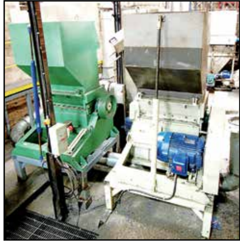
NELMOR JACKETED CHAMBER GRANULATORS, WASH LINE #2