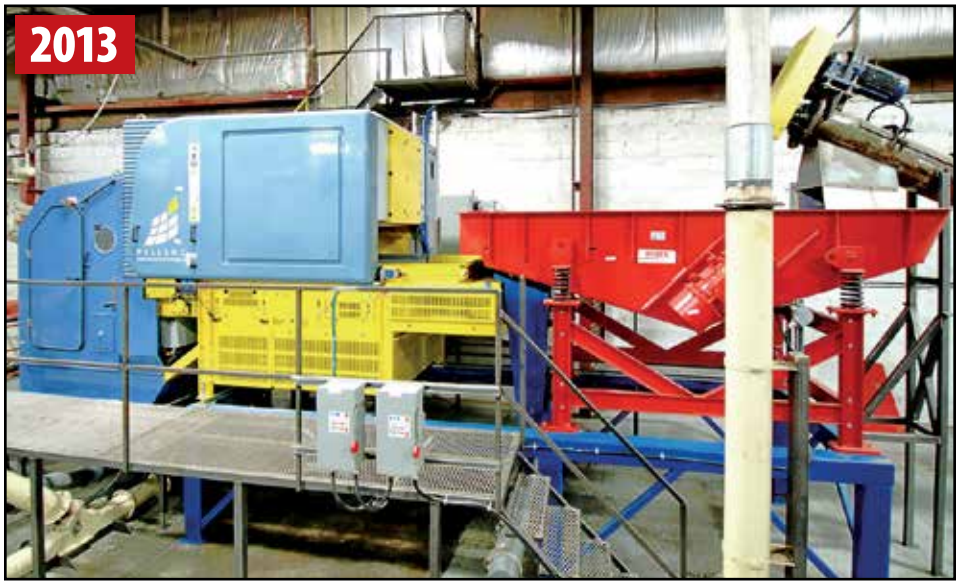
PELLENC DUAL VISION OPTICAL SORTER

OVER 1,000 TOTAL LOTS FEATURING: Late-Model Shredders, Optical Sorting Lines, Granulators, Wash Lines, Pelletizing Lines, Water Treatment Systems, Robotic Processing Line, Plastics Support Equipment, Rolling Stock, Material Handling, Lab Equipment, Factory Support & More