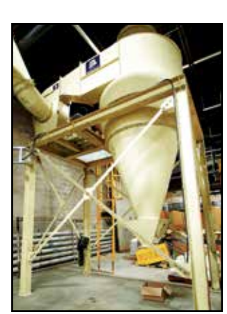
RODRIGUE DUST COLLECTOR