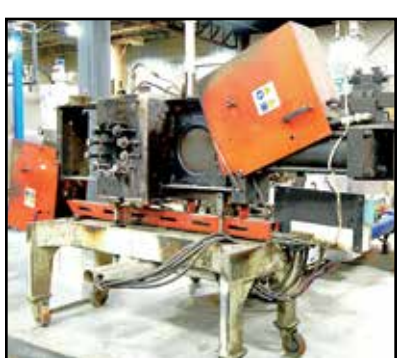
BERRINGER 12" HYDRAULIC SCREEN CHANGER