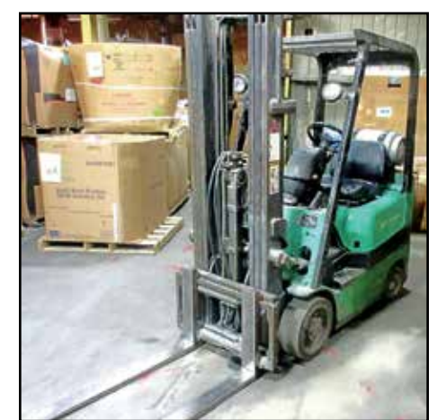
MITSUBISHI 3,500 LB LPG FORKLIFT