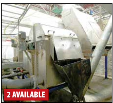
GALA SS FINES SIEVES, SYSTEM #1