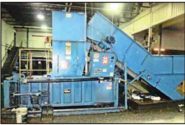
MARATHON G3650 BALER (ST. HYACINTHE)