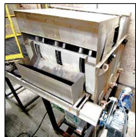
HYCOR SS ROTARY DISC FILTER, SYSTEM #2