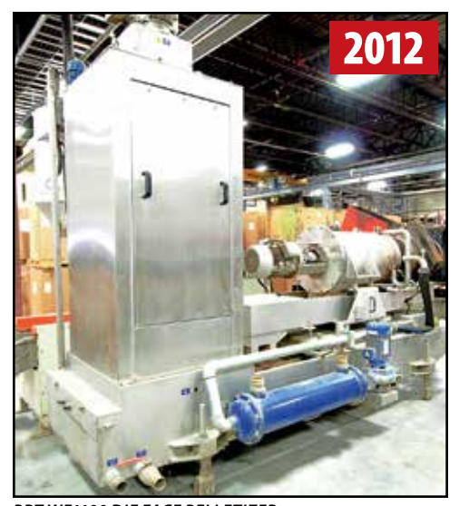
PRT WF1100 DIE FACE PELLETIZER