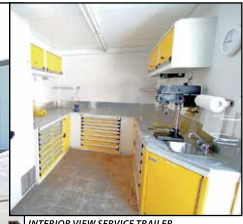
INTERIOR VIEW SERVICE TRAILER