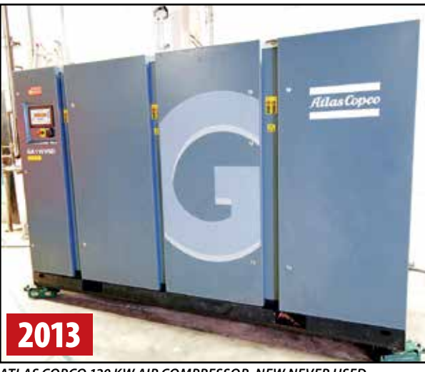
ATLAS COPCO 120 KW AIR COMPRESSOR, NEW NEVER USED

ALSO: Copper Cable, Cable Trays, Disconnects, Transformers.