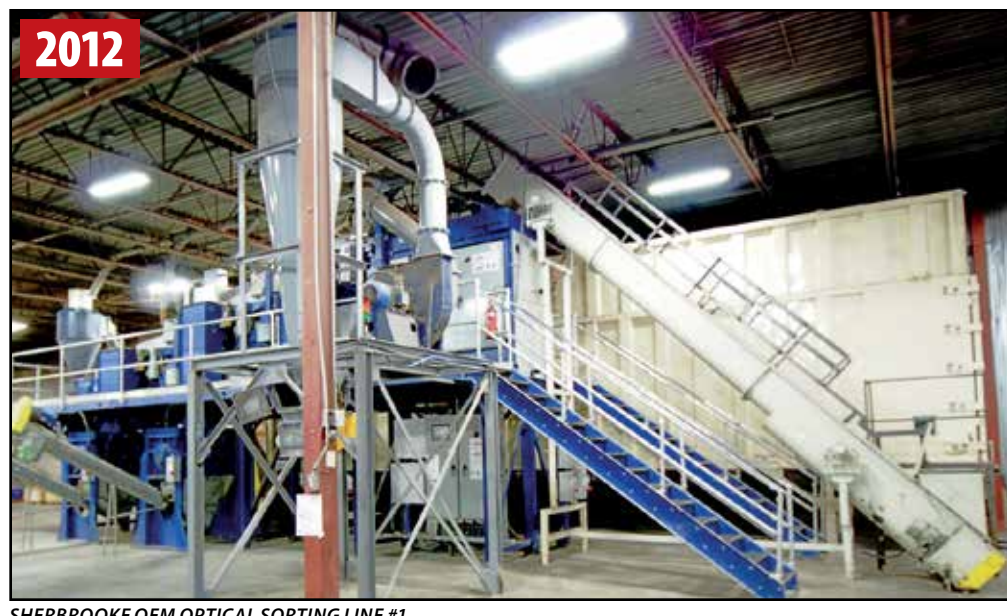
SHERBROOKE OEM OPTICAL SORTING LINE #1