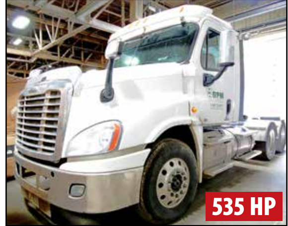
2011 FREIGHTLINER HIGHWAY TRACTOR