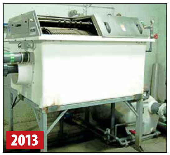
H2 PRO AQUA 32054RF DISC FILTER, SYSTEM #1