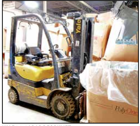
YALE 3650 LB LPG FORKLIFT