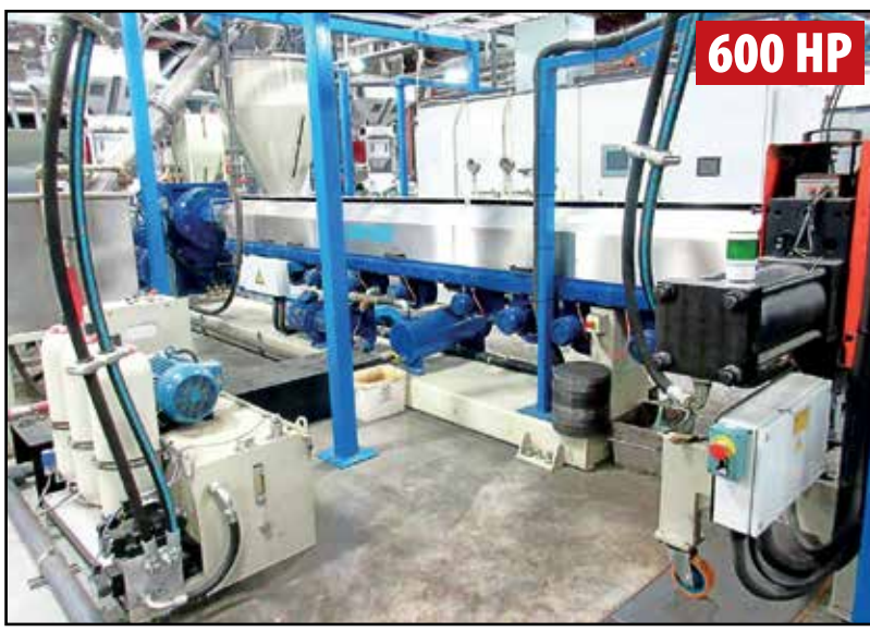
2012 GAMMA MECCANICA 160 MM EXTRUDER