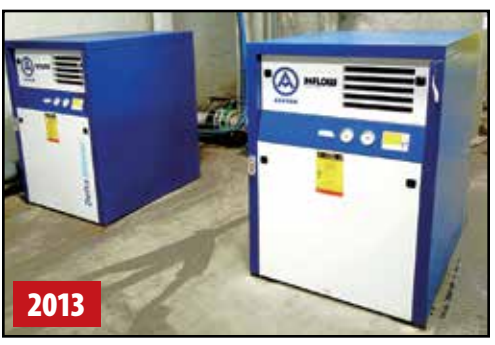
AERZEN OZONE GENERATORS