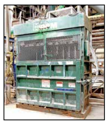
JV MFG CRAM-A-LOT HYDRAULIC CARDBOARD BALER