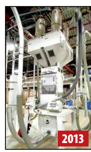
WITTMANN 5-COLOUR WEIGH SCALE, LINE #2