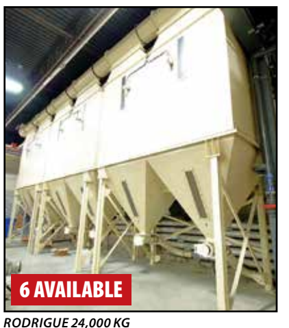
INDOOR STORAGE SILOS