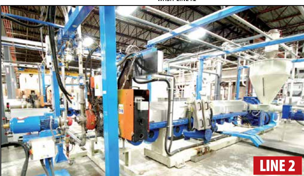
2012 GAMMA MECCANICA 160 MM 535 HP EXTRUDER