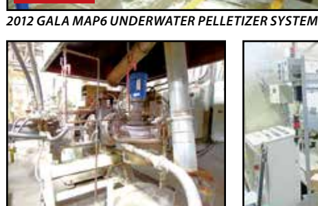
PTI WATER RING PELLETIZER, LINE #4