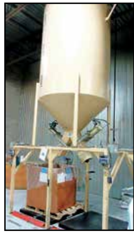
LUTEK SILO PACKAGING SYSTEM