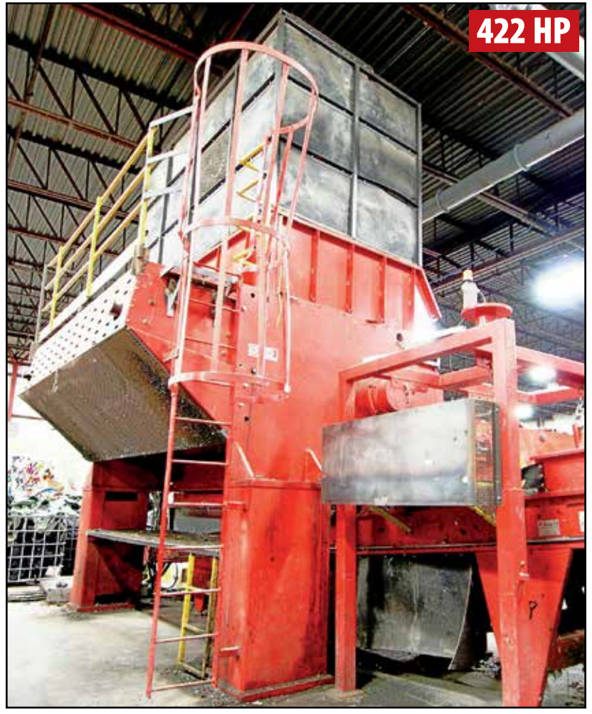
2012 BANO PREMAC 35-80 SINGLE-SHAFT SHREDDER – REAR VIEW

Inspection: Monday, April 27, 2015 from 9:00 AM to 4:00 PM EDT or by Appointment