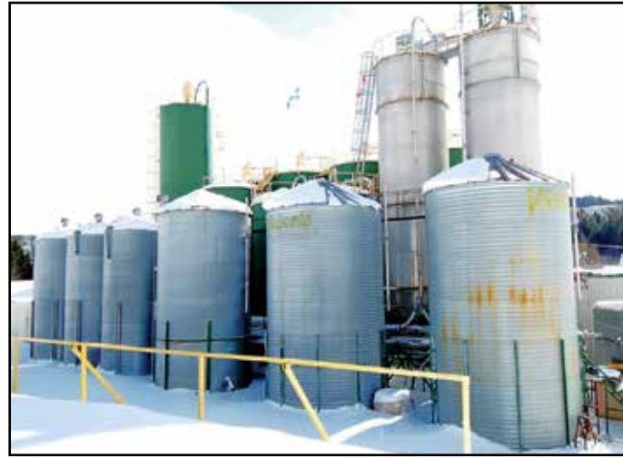
SILO FARM (ST. DAMIEN)