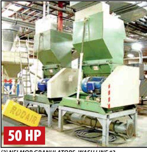
(2) NELMOR GRANULATORS, WASH LINE #3