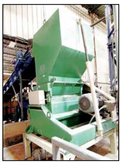
NELMOR 50 HP GRANULATOR,