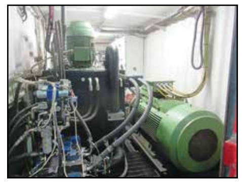
BANO 422 HP DRIVE POWER PACK