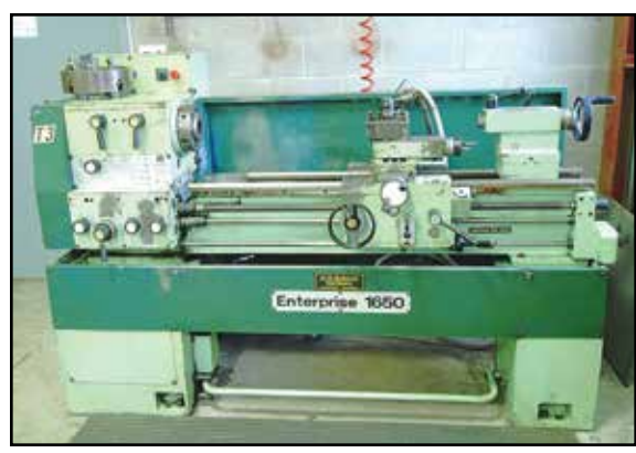
ENTERPRISE 1650 LATHE