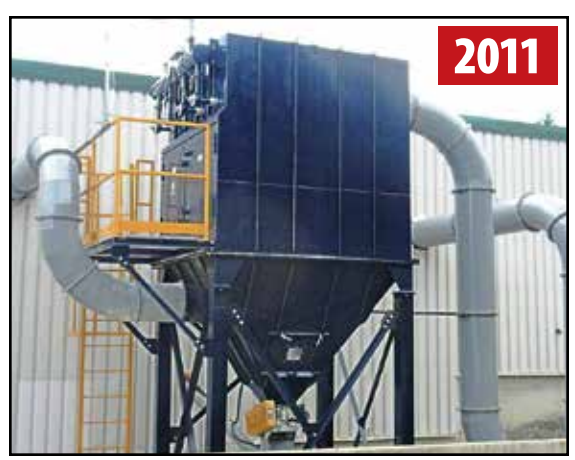
RODRIGUE 40 HP DUST COLLECTOR/FILTER, ROBOT LINE