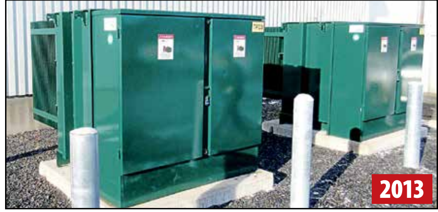
SURPLEC 25,000 VOLT PAD MOUNT TRANSFORMERS

2011 FREIGHTLINER CASCADIA DAY CAB HIGHWAY TRACTOR, S/N 1FULGEDR4CLBJ5365, w/Detroit DD15 535 HP Power, Eaton Fuller 18-Speed, 118,750 km (at time of printing).