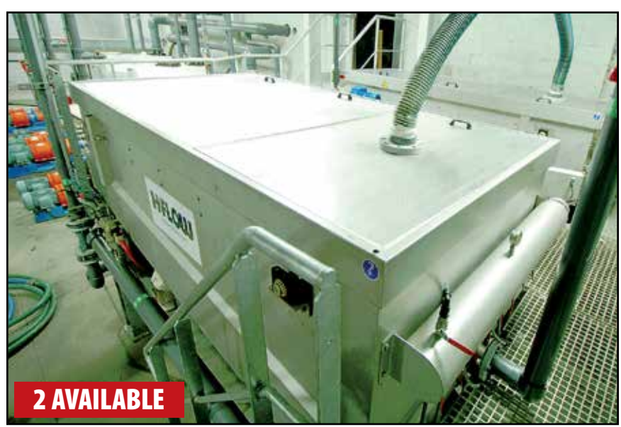
KEMEG SS PADDLE STYLE FLOAT/SINK TANKS, SYSTEM #1

US Buyers – take advantage of the current CANADIAN exchange rate and save close to 25%