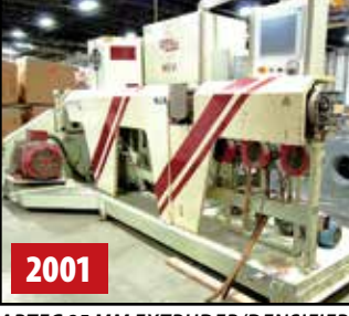
ARTEC 85 MM EXTRUDER/DENSIFIER