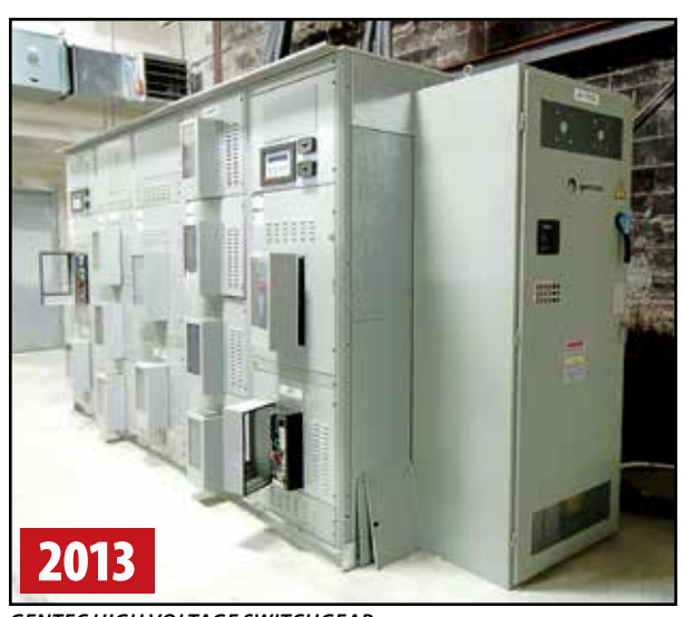
GENTEC HIGH VOLTAGE SWITCHGEAR