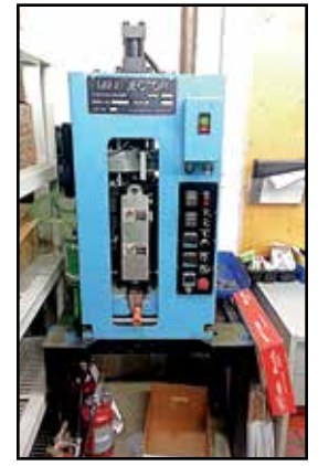
MINI-JECTOR MDL. 551 BENCH TOP LAB INJECTION MOULDER