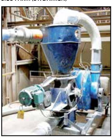
KONGSKILDE 50 HP SUCTION BLOWER

APPROXIMATELY 180,000 KG (397,000 lb) OF BLACK PPTV-01 POLYPROPYLENE LOCATED WITHIN 2 RAILCARS OFFERED