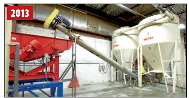
PELLENC BULK MATERIAL FEED SYSTEM

US Buyers — Take advantage of the current CANADIAN exchange rate and save close to 25%