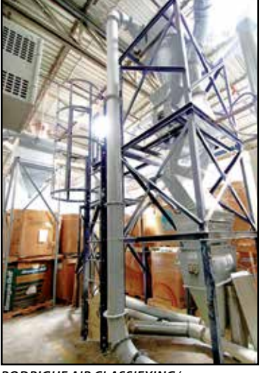
RODRIGUE AIR CLASSIFYING/ SEPARATION SYSTEM, ROBOT LINE