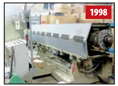
PTI 6000 6" AIR COOLED EXTRUDER