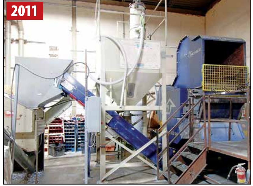
LINDNER VEGA 1100 SINGLE-SHAFT SHREDDER