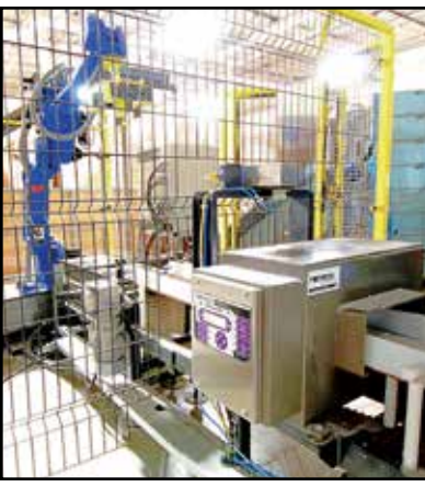
FORTRESS METAL DETECTOR, ROBOT LINE