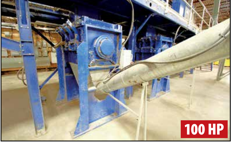
(2) CUMBERLAND GRAN50 GRANULATORS, SORTING LINE #1

US Buyers — Take advantage of the current CANADIAN exchange rate and save close to 25%