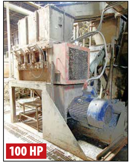
CUMBERLAND GRAN50 GRANULATOR, WASH LINE #1

Monday, April 27, 2015 from 9:00 AM to 4:00 PM EDT or by Appointment Inspection: