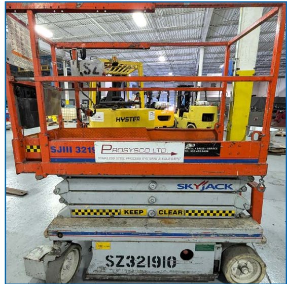
SKYJACK SJIII 3219 SCISSOR LIFT