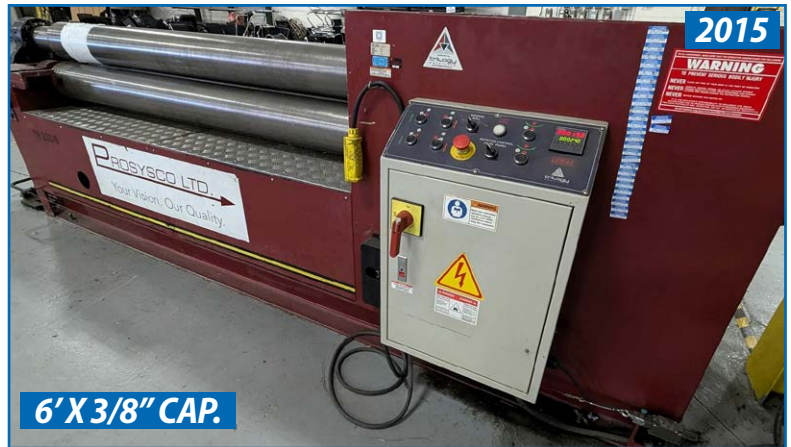
LEMAS TR 200/6 HYDRAULIC PLATE ROLLS