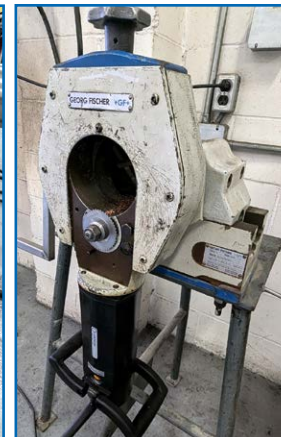
GEORG FISCHER RA4 ORBITAL SAW