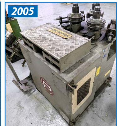
AKYAPAK APK-80 HYDRAULIC ANGLE ROLLS