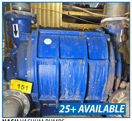
NASH VACUUM PUMPS