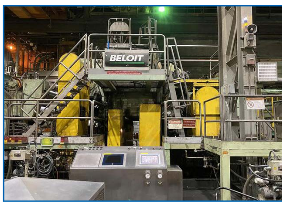
PARTIAL VIEW OF BELOIT 278" AND 290"TRIM

1,000+ LOTS. Generators, Motors, Switchgear, MCC's, Transformers, Electrical, Cranes, Paper Machinery