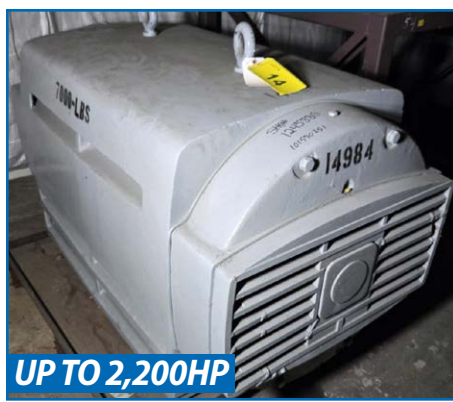
PARTIAL VIEW OF NEW RECONDITIONED SPARE MOTORS