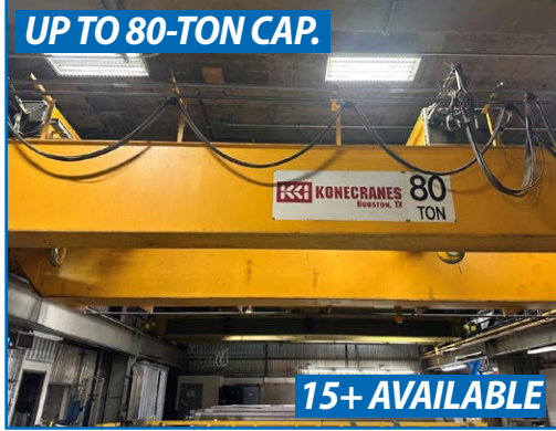
DNE SHAWBOX BRIDGE CRANES UP TO 80 TON CAP