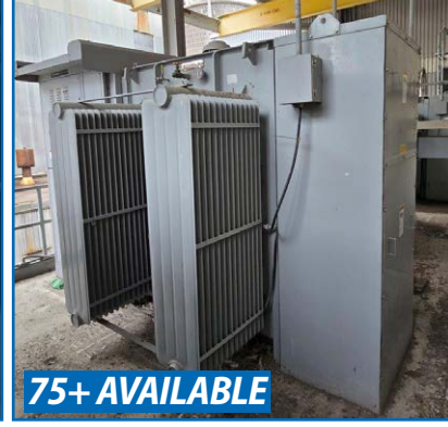
PARTIAL VIEW OF INDOOR & OUTDOOR