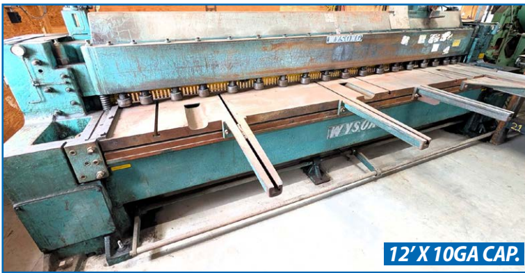
12' X 10GA CAP.