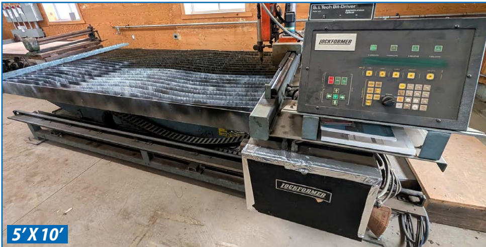
5' X 10'