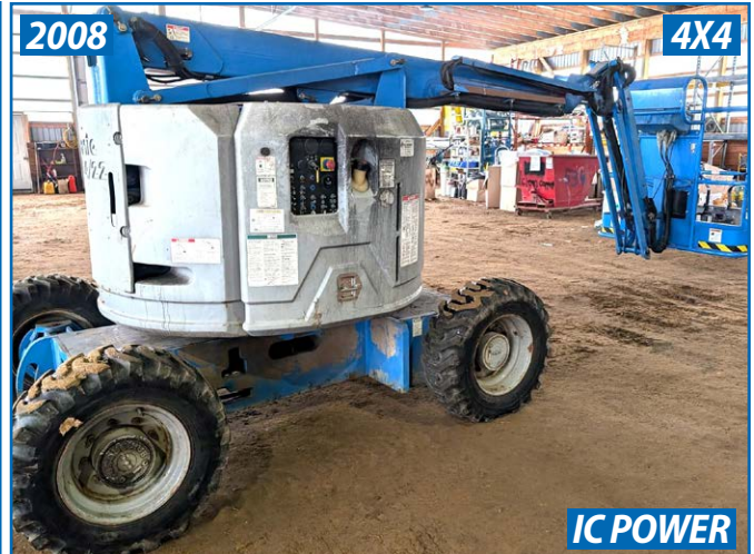
2008 GENIE Z-34/22 ARTICULATING BOOM

WUXI JINQIU MACHINERY WC67K-160/4000 HYDRAULIC PRESS BRAKE