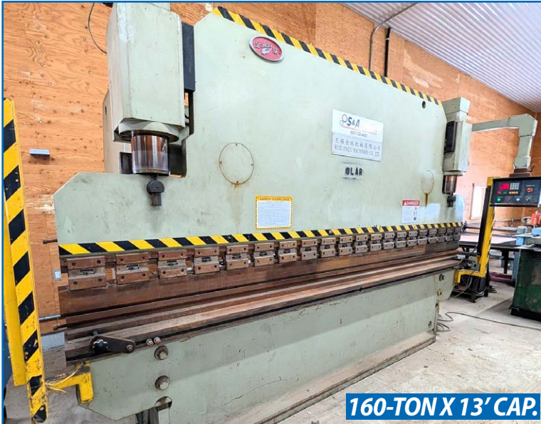
160-TON X 13' CAP.

3763 Olde Base Line Rd., Inglewood (Caledon), ON