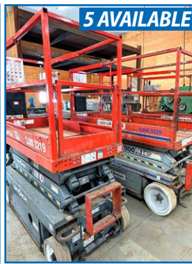
PARTIAL VIEW OF SKYJACK SCISSOR LIFTS