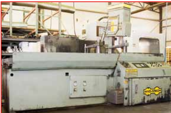
HYD-MECH VERTICAL BAND SAW

Welding Positioner , w/Vari Speed 0–5° tilt, 12-1/4" table.