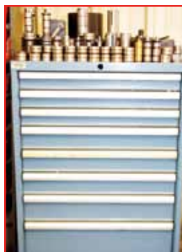
PARTIAL VIEW OF TOOLING