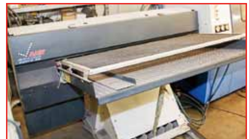
LNS QUICK LOAD SERVO S2 BARFEED, 4.75" CAP.

HAAS CNC Machining Center, Mdl. VF-2, new 1998, Haas control, 30" x 16" x 20" travels, 15 hp., 40 taper, 20 ATC, 15" x 36" table, 4th axis ready.