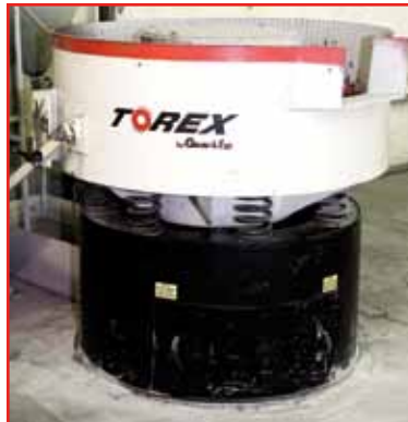
TOREX VIBRATORY DE-BURR MACHINE