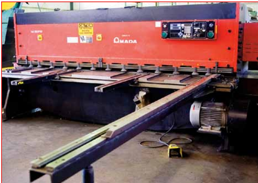
AMADA 1/4" X 10' MECHANICAL POWER SHEAR

AMADA 1/4" x 10' Mechanical Power Shear, Mdl. M-3060, S/N 30600976, new 1996, power front operated programmable back gauge, 11' squaring arm, support arms, rear sheet support system.