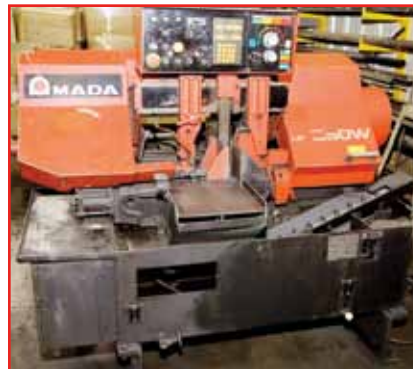
AMADA HORIZONTAL BAND SAW

AMADA Horizontal Band Saw , Mdl. HFA 250W, S/N 25060279, new 1993, auto clamping and power feed, 18" bundling, 10" bar cap., 5 hp. motor, chip auger, coolant.