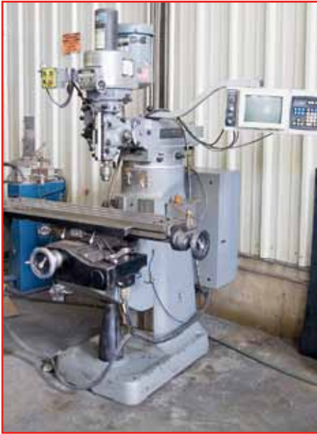
BRIDGEPORT EZ TRAK CNC MILL