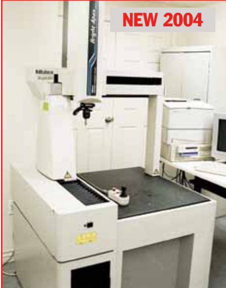
MITUTOYO BRIGHT APEX 504 DCC CMM