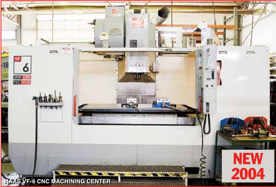
HAAS VF-6 CNC MACHINING CENTER