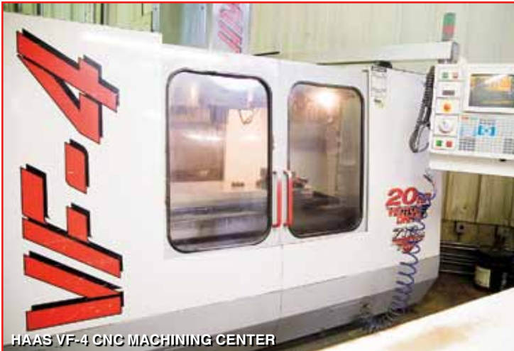
HAAS VF-4 CNC MACHINING CENTER

FANUC Robocut Alpha-1iB Wire EDM, New 2001, Fanuc i80 is-w control, 21.7" x 14.5" x 12" travels, U+V taper, AWF, 853 hours.