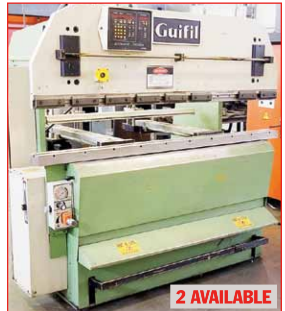
GUIFIL 6.5" X 69.3-TON CNC HYDRAULIC PRESS BRAKE