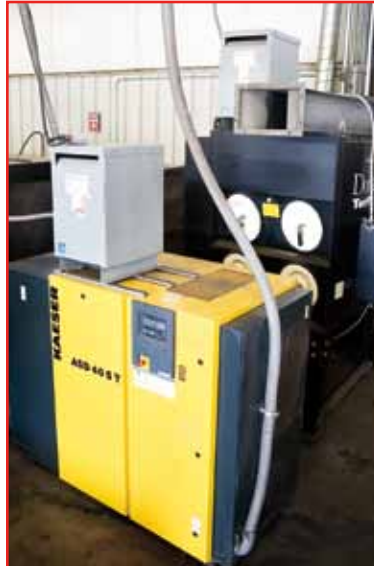
KAESER 40 HP ROTARY SCREW AIR COMPRESSOR