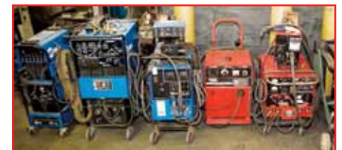
LINCOLN IDEALARC DC ARC WELDER