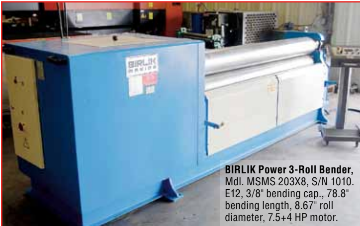
BIRLIK Power 3-Roll Bender , Mdl. MSMS 203X8, S/N 1010. E12, 3/8" bending cap., 78.8" bending length, 8.67" roll diameter, 7.5+4 HP motor.

E. G. HELLER'S SON Electric Tube Bending Machine , Mdl. Super Bender, foot control, set of dies.