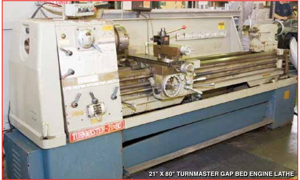
21" X 80" TURNMASTER GAP BED ENGINE LATHE