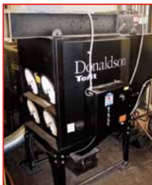
DONALDSON TORIT DUST COLLECTOR