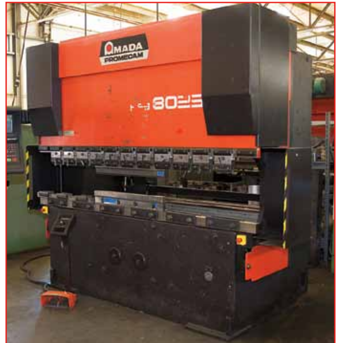
AMADA PROMECAM 8' X 88-TON CNC HYDRAULIC PRESS BRAKE

AMADA Promecam 14' x 187-Ton CNC Hydraulic Press Brake, Mdl. HFBO 1704, S/N H970115, new 1997, 8-axis Amada Operateur control.