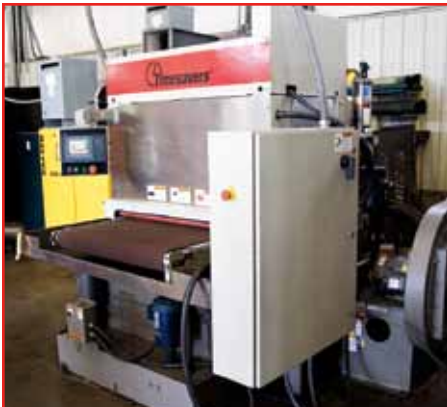
TIMESAVERS WET BELT GRINDER