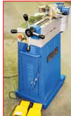
E.G. HELLER'S SON ELECTRIC TUBE BENDING MACHINE

DELTA Vertical Band Saw , 14" table, 12" cap.