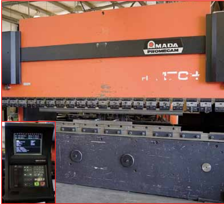
AMADA OPERATEUR CONTROL