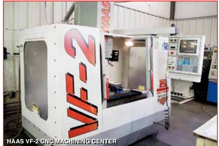
HAAS VF-2 CNC MACHINING CENTER