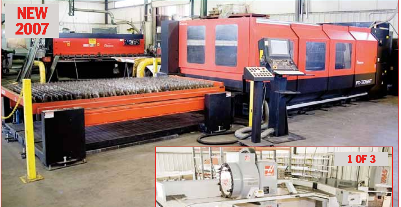
5' X 10' AMADA 4,000 WATT CNC LASER, MDL. FO 3015

On-Site Bidding in Logan, UT or Bid Via Webcast at