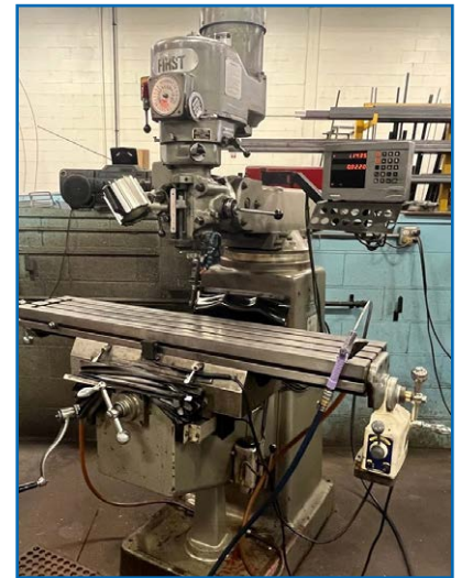
FIRST LC-185VS VERTICAL MILL