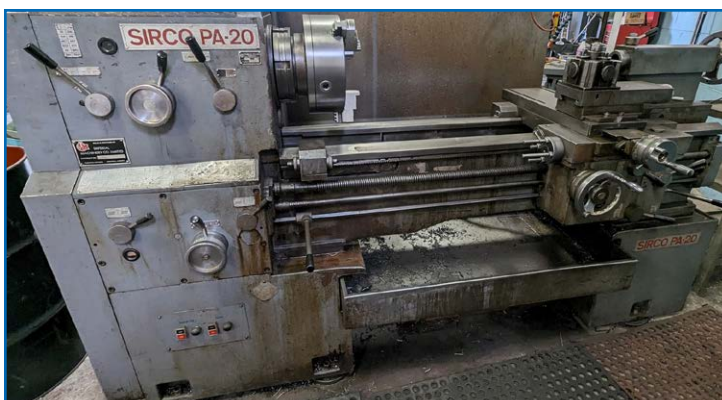
SIRCO PA-20 LATHE

2001 MICROWEILTY-1630S Lathe, Mitutoyo KA Counter 2-Axis DRO, 3-Jaw Chuck, 16" x 30", Tailstock, Tool Post, s/n A9006-004 SIRCO PA-20 Lathe, 3-Jaw Chuck, Tailstock, Tool Post, Steady Rests, s/n 2190 FIRST LC-20VHS Vertical/Horizontal Milling Machine, Heidenhain 2-Axis DRO, 5HP FIRST LC-185VS Vertical Milling Machine, Heidenhain 2-Axis DRO, 3HP, Align Power Feed, Speeds to 4,500 RPM, s/n 84121236 FIRST LC-1-1/2VS Vertical Milling Machine, Heidenhain 2-Axis DRO, 2HP, Align Power Feed, Speeds to 4,500 RPM, s/n 21119073 HARIG 612 Manual Surface Grinder, 6" x 12" Magnetic Chuck KAR-MANN MACHINERY KM1012 Roll-in Bandsaw, s/n 20488 DAVIS No. 5 Keyseater Flexible Tapping Arm HYSTER H50XM Propane Forklift, 3,950lb Cap., 189" Max Lift, 3-Stage Mast, Outdoor Tires, Side Shift, s/n H177B09334W GORBEL Ceiling Mounted Bridge Crane System, 500lb Cap. w/ Yale Electric Hoist, Pendant Control