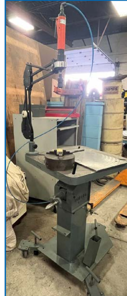
FLEXIBLE TAPPING ARM