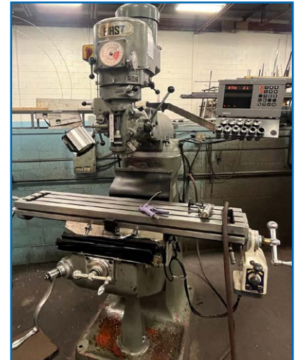
FIRST LC-1-1/2VS VERTICAL MILL