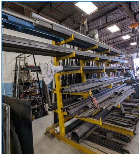
PARTIAL VIEW OF METAL ART, FIREPITS & PLANT SUPPORT EQUIPMENT