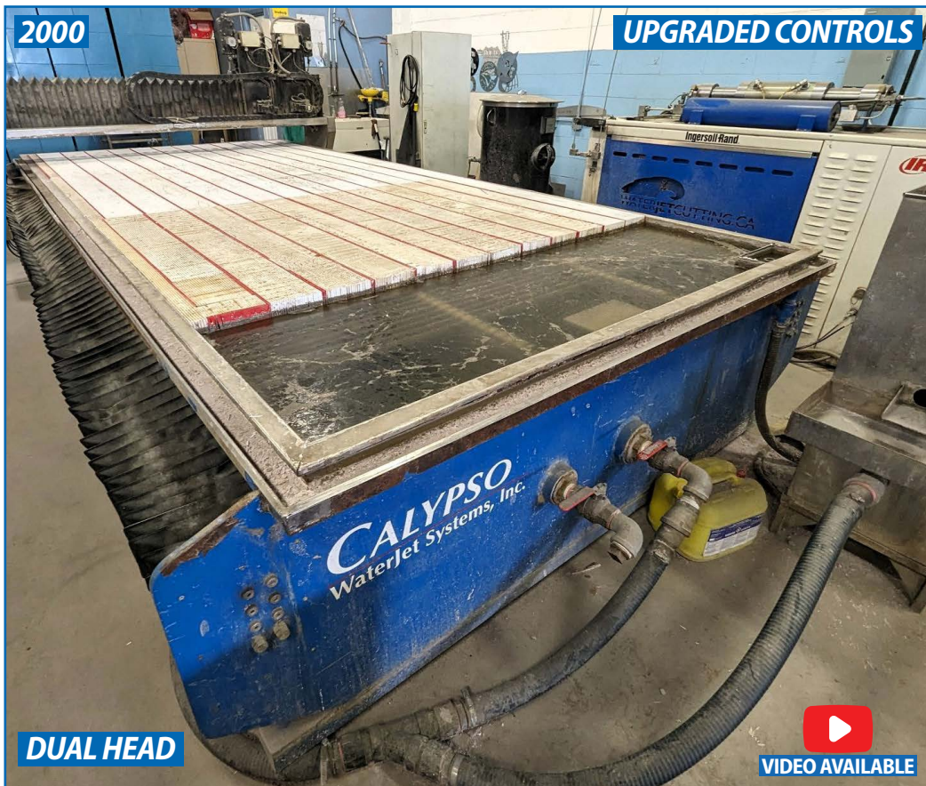
CALYPSO SHARK VER 2 WATER JET