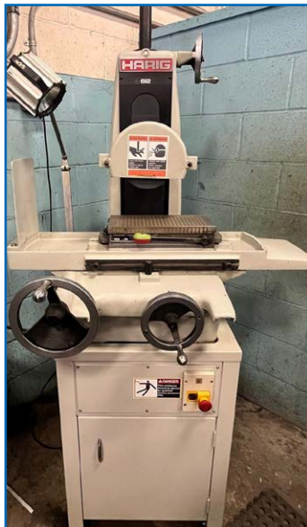
HARIG 612 SURFACE GRINDER