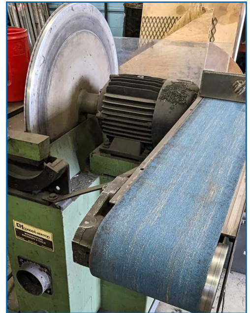
SAMCO DG/60 BELT/DISC SANDER