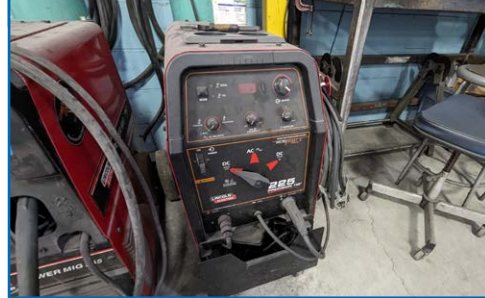
PARTIAL VIEW OF LINCOLN ELECTRIC WELDERS