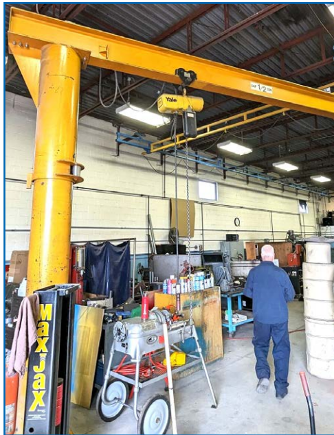
FREE STANDING JIB CRANE