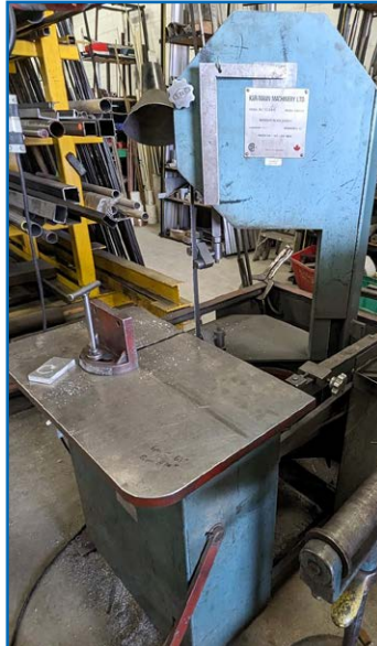
KAR-MANN KM1012 ROLL-IN SAW