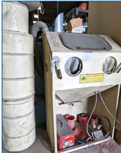
EMPIRE SANDBLAST CABINET