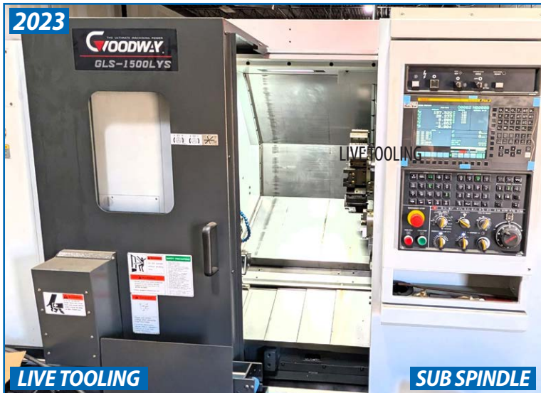
GOODWAY GLS-1500LYS CNC TURNING CENTER