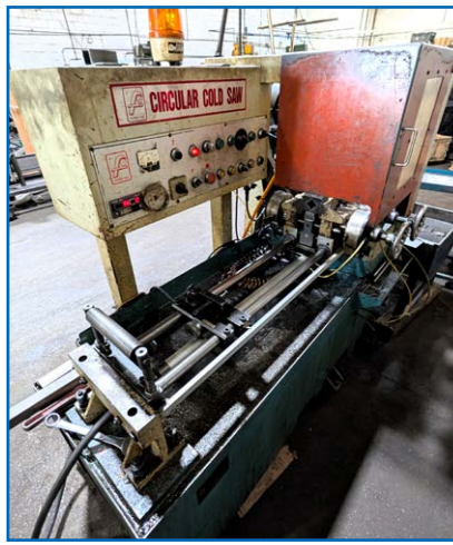
PARTIAL VIEW OF COLD SAWS