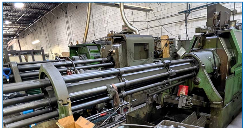
PARTIAL VIEW OF ACME GRIDLEY & WICKMAN SCREW MACHINES

2023 GOODWAY GLS-1500LYS CNC Turning Center, Fanuc Series Oi-TF PLUS CNC Control, Live Tooling, Sub Spindle, 3-Jaw Chuck, Tool Setter, Parts Catcher, Chip Conveyor, s/n 98H1007