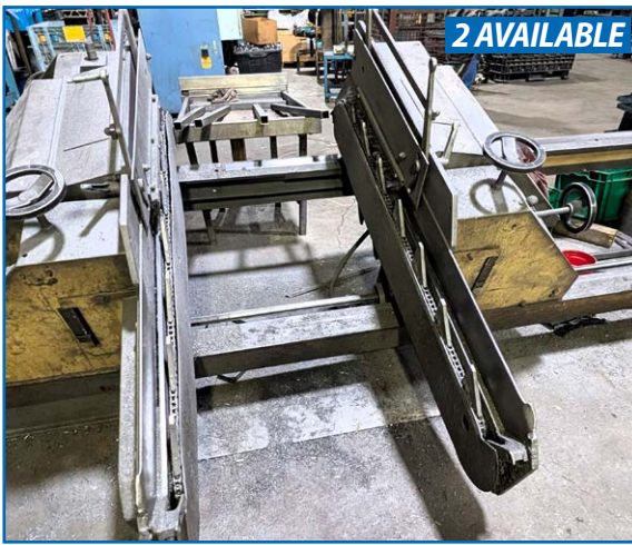
BURRMASTER DEBURRING MACHINE