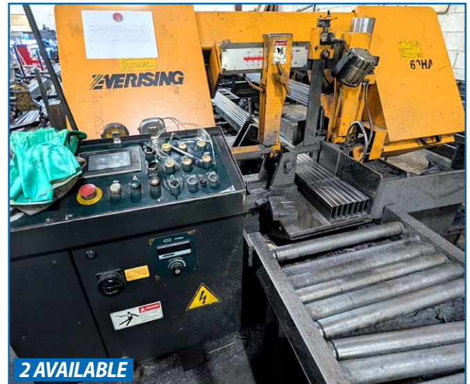
EVERISING H-260HA AUTOMATIC HORIZONTAL BANDSAW