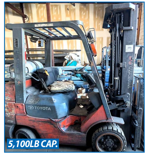
TOYOTA 7FGCU30 FORKLIFT