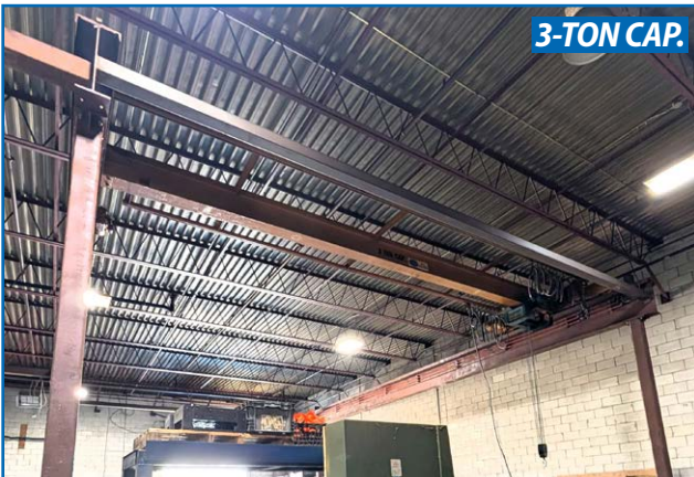
FREE STANDING CRANE SYSTEM