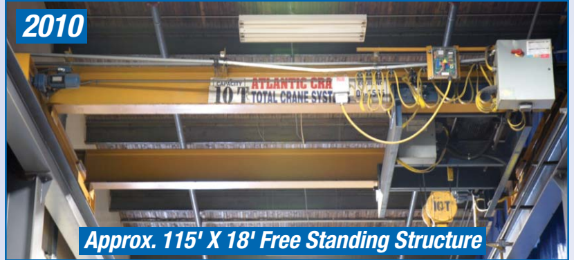
ATLANTIC CRANE 10 Ton Overhead Bridge Crane, Top Running, Double Girder, Approx. 18ft Span, 10 Ton Hoist, Buss Bar, Top Running Rails, I-Beams, Remote Control