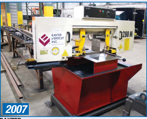
BAXTER 280M Horizontal Band-Saw With Clamping S/N 5738