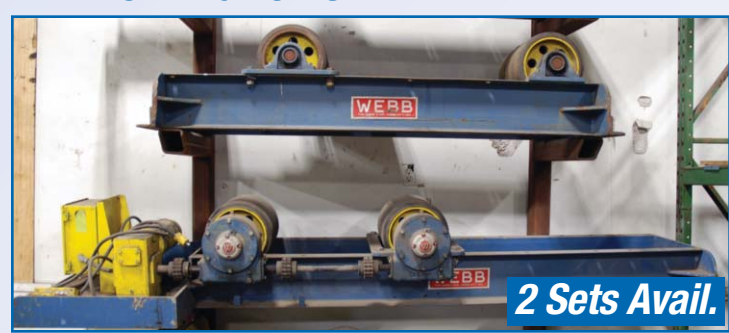
WEBB T-30-PWR Power Turning Rolls With 10,000 Lbs. Cap., With Idlers S/N 2501, 2585