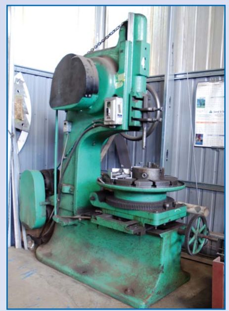
WM MUIR & CO No. 165 Vertical Slotter With 24" Rotary Table, S/N 165

RIDGID Model 1822 Pipe Threader With Stand