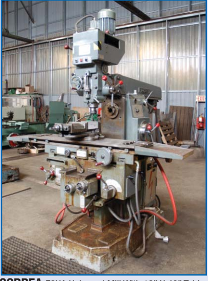
CORREA F2UA Universal Mill With 12" X 48" Table, 3,150 Vertical RPM, 1,800 Horizontal RPM