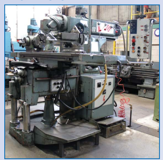
CORREA Fu-125 / Cm 100 Universal Mill With Dividing Head, 16" X 63" Table, Power Feed, Power Head Stock, Divisor Device, 1700 Vertical RPM, 1,400 Horizontal RPM S/N 1450424