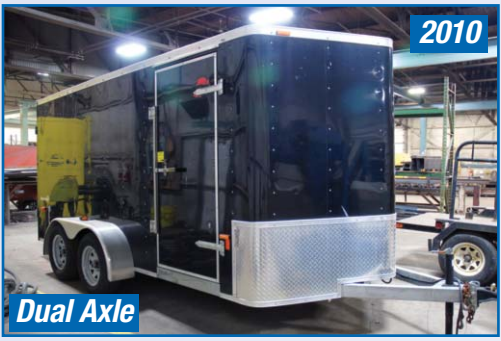
IDEAL 16' T/A Enclosed Trailer, 7,000 Lbs. GVWR, S/N 209FA32A4AV098482