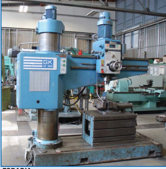
FORADIA Gk 50-1500 Radial Arm Drill With 32" X 19" X 19" Box Table, 1,400 RPM, 4ft Arm Travel, S/N 540432-ID