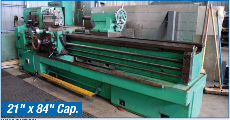
WHACHEON Model 20172Y80 Engine Lathe With 3 1/4" Bore, 1,350 RPM S/N 28102