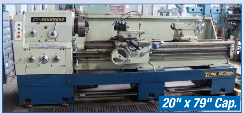
CY-DRUMMOND Model 500x2000g Gap Bed Engine Lathe With 4 1/4" Bore, 1120 Rpm, 3 Jaw Chuck, Tool Positioner S/N 12-487