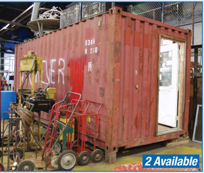
14ft & 20ft Shipping Containers