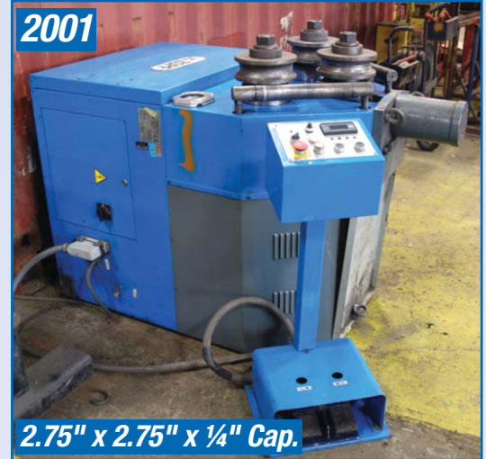
ZOPF Model ZB100H Angle Bending Rolls, 2.75" X 2.75" X ¼", 2" Tube Cap., Hyd Upper Roll Adjustment, Digital Display, Asst. Dies, S/N 01352R