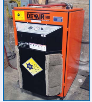
DEVAIR Model D-VAVC-5000-5, 15HP Air Compressor, 4,587 Hrs, S/N 36044-TE

Diesel Engine, 2598 Hrs Mounted On 5' X 6' T/A Trailer