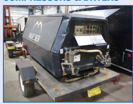
INGERSOL RAND Portable Air Compressor,

Diesel Engine, 2598 Hrs Mounted On 5' X 6' T/A Trailer