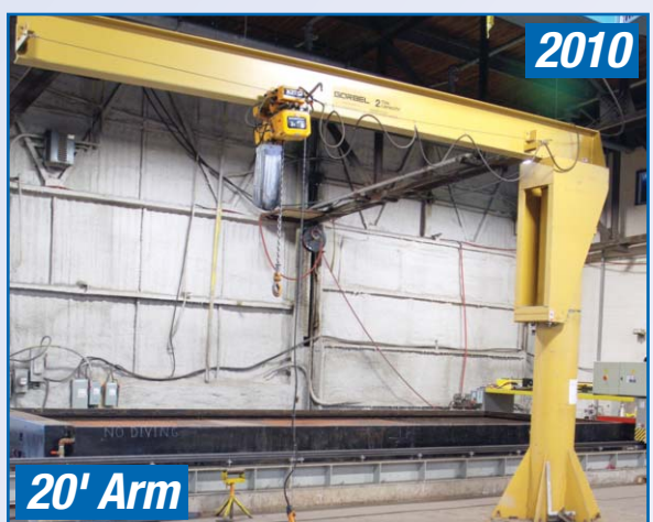
(2) GORBEL 2 Ton Jib Cranes, With Kito 2 Ton Hoists, 20ft Arms, Kito Hoists