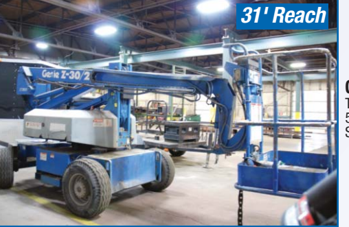
GENIE Z-30/20 Electric Telescopic Boom Lift, 500 Lbs Cap., S/N 30-Z30-2884