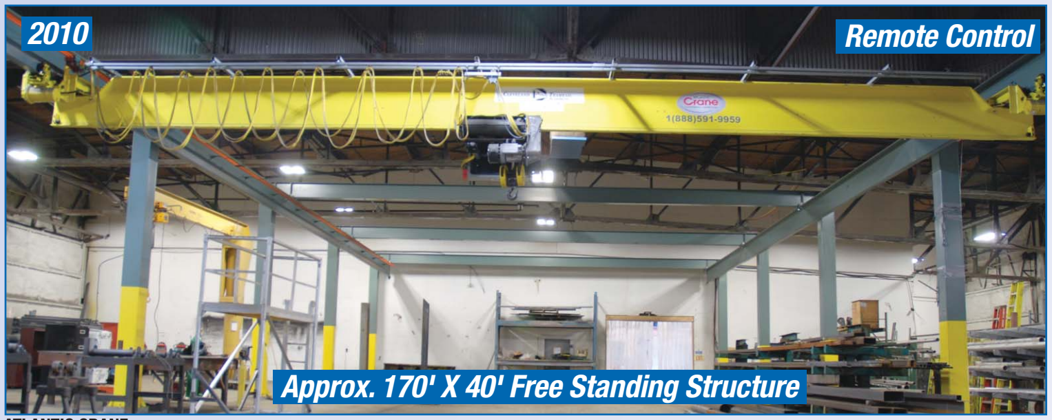
ATLANTIC CRANE 15 Ton Overhead Bridge Crane, Underslung, Single Girder, Approx. 40ft Span, 15 Ton Underslung Hoist, Buss Bar, Top Running Rails, I-Beams