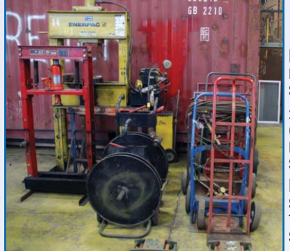
ENER-PAC 50 Ton H-Frame Hyd. Press W/ 13" Stroke