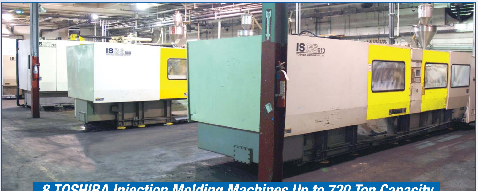
8 TOSHIBA Injection Molding Machines Up to 720 Ton Capacity