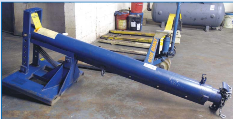
T&S EQUIP FORKLIFT BOOM