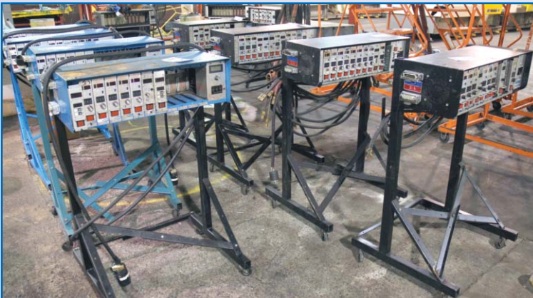
PARTIAL VIEW OF TEMPERATURE CONTROLLERS