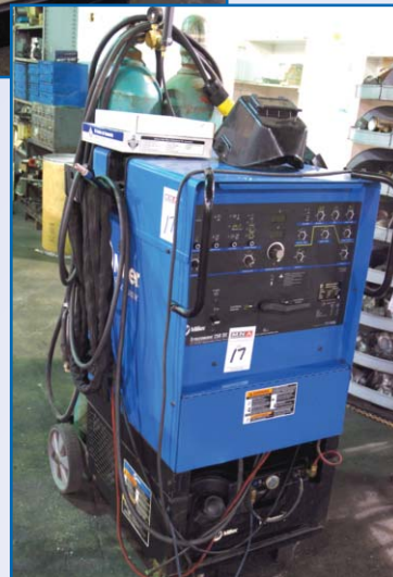
MILLER SYNCROWAVE 250DX WELDER