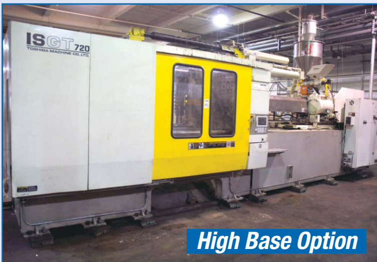
TOSHIBA 720 TON, MODEL ISGT720V10-81, 186 OZ