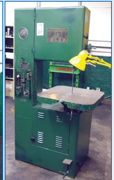
GROB VERTICAL BAND SAW MODEL NS1