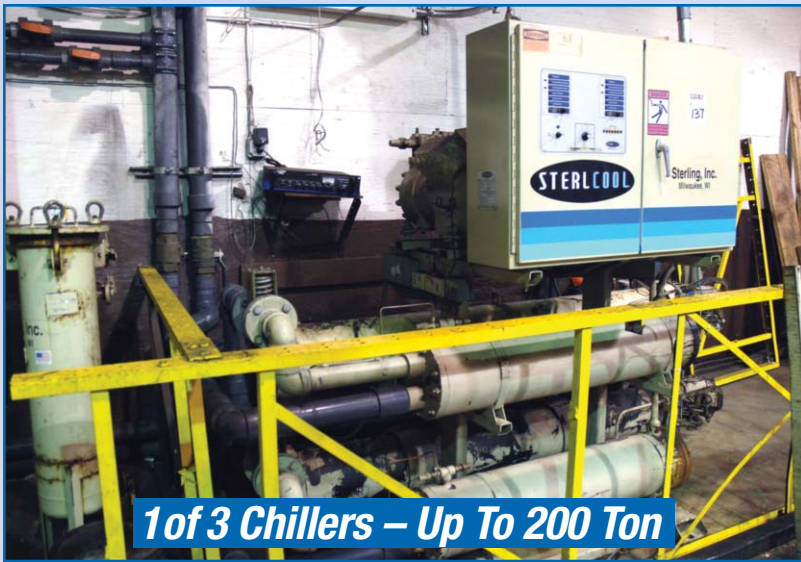
1 of 3 Chillers – Up To 200 Ton