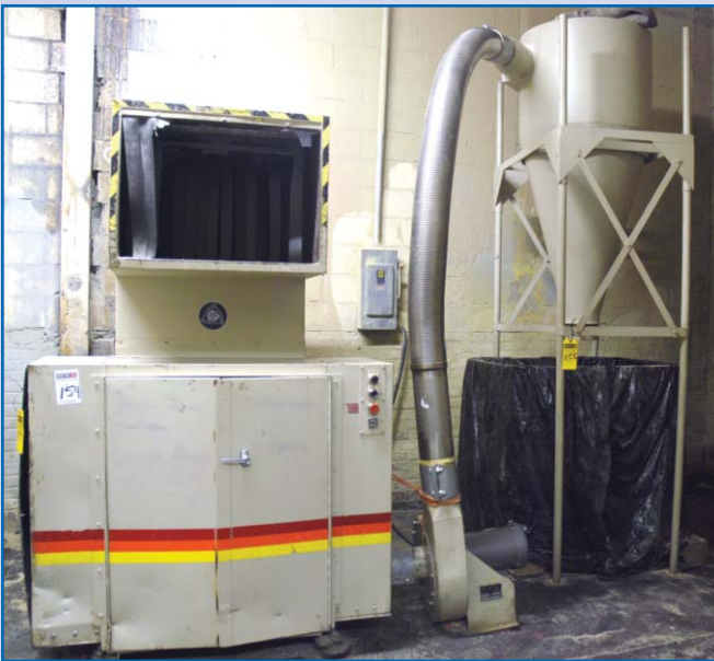
STERLCO BALL & JEWELL 50 HP GRANULATOR