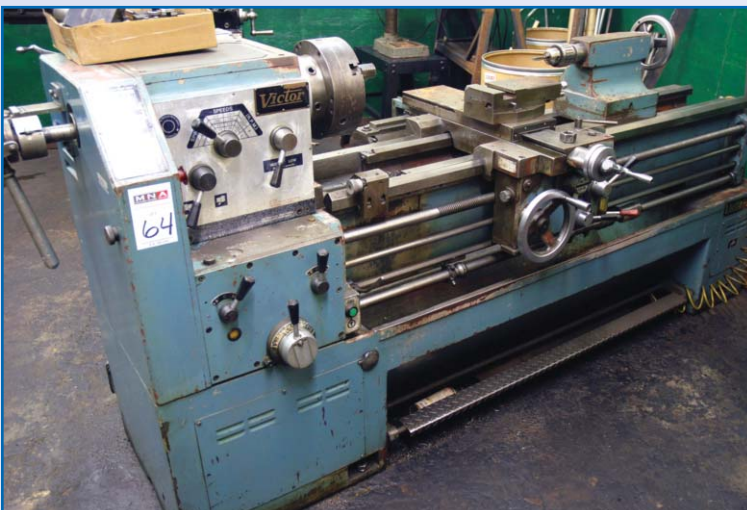
VICTOR LATHE MODEL 2060