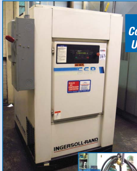
1 of 3 Air Compressors, Up To 100 HP