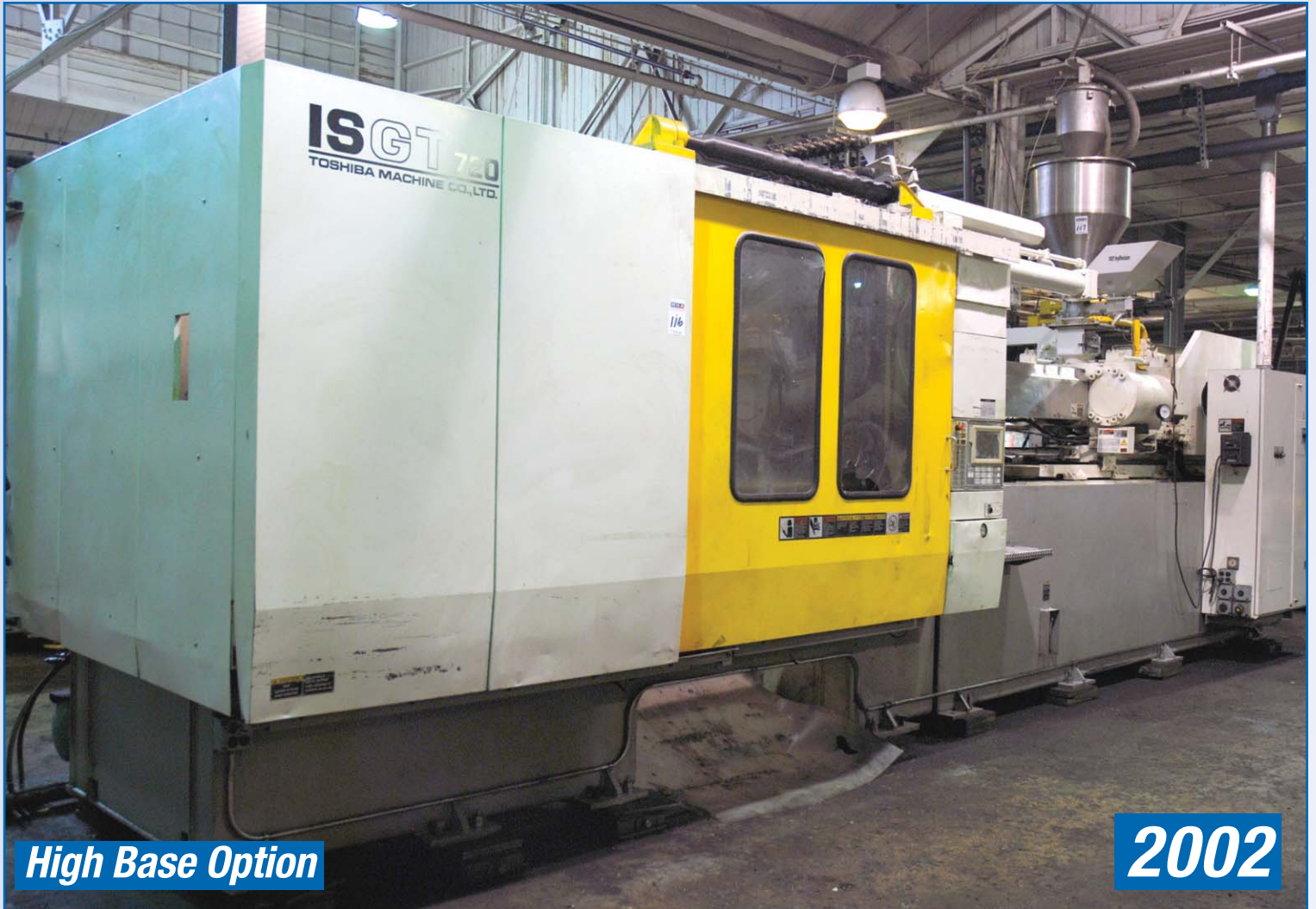
TOSHIBA 720 TON, MODEL ISGT720V10-81, 186 OZ