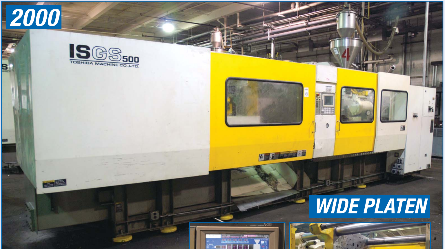
TOSHIBA 500 TON, MODEL ISGS500WV10-34, 77 OZ