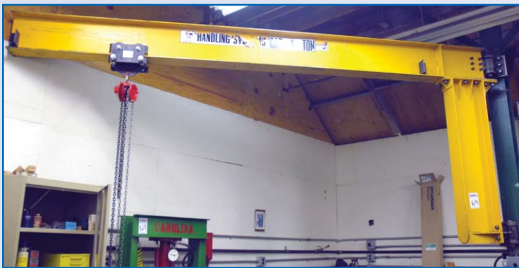
1 TON JIB CRANE