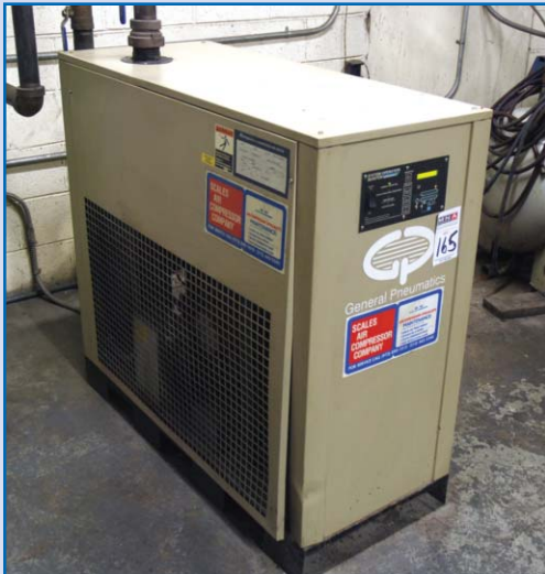
GENERAL PNEUMATICS REFRIGERATED AIR DRYER

PROXY BIDDING We will be happy to bid on your behalf if you are unable to attend our auction. Please call our office at 905-669-8893, or visit our website www.infinityassets.com to submit a proxy bid.