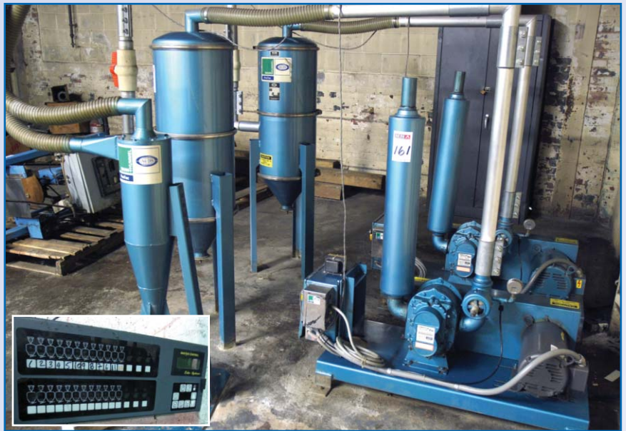
DUAL UNA DYNE VACUUM LOAD SYSTEM WITH CONTROLS