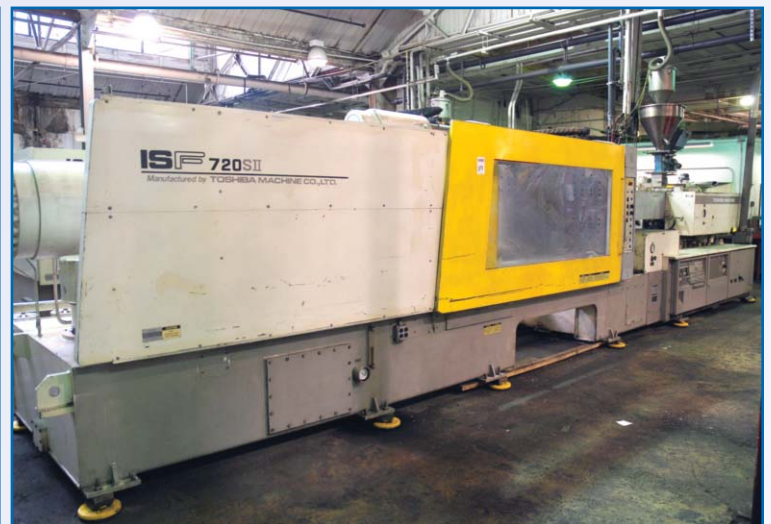
TOSHIBA 720 TON, MODEL ISF720SII-59B, 126 OZ

This brochure is meant merely as a guide. Infinity Asset Solutions & Machinery Network Auctions make no guarantee, expressed or implied, as to the accuracy of the information in this brochure. Buyers should inspect the goods beforehand to satisfy themselves.