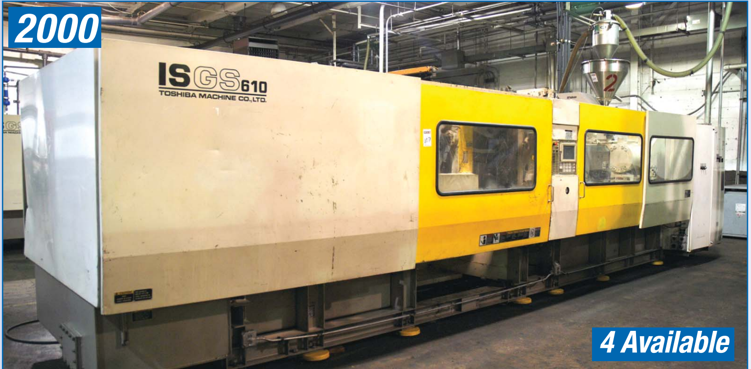
TOSHIBA 610 TON, MODEL ISG610V1-59, 126 OZ