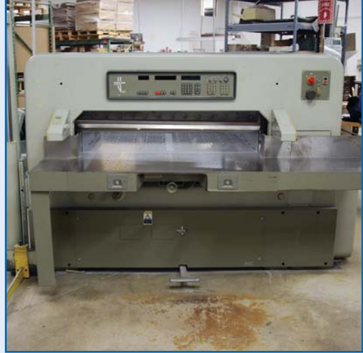
POLAR MODEL 137 EMC, 54" GUILLOTINE