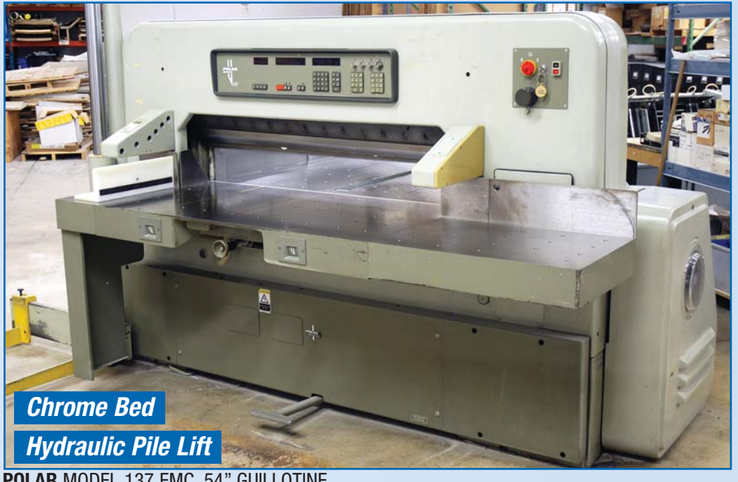
POLAR MODEL 137 EMC, 54" GUILLOTINE