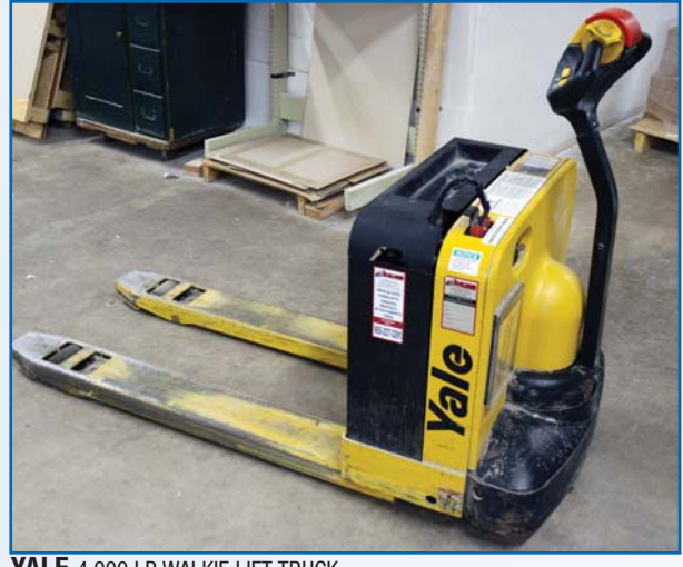
YALE 4,000 LB WALKIE LIFT TRUCK