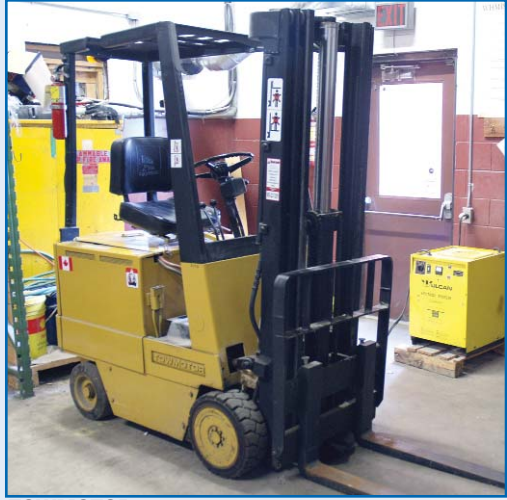
TOWMOTOR ELECTRIC FORKLIFT, 2,100 LB CAPACITY