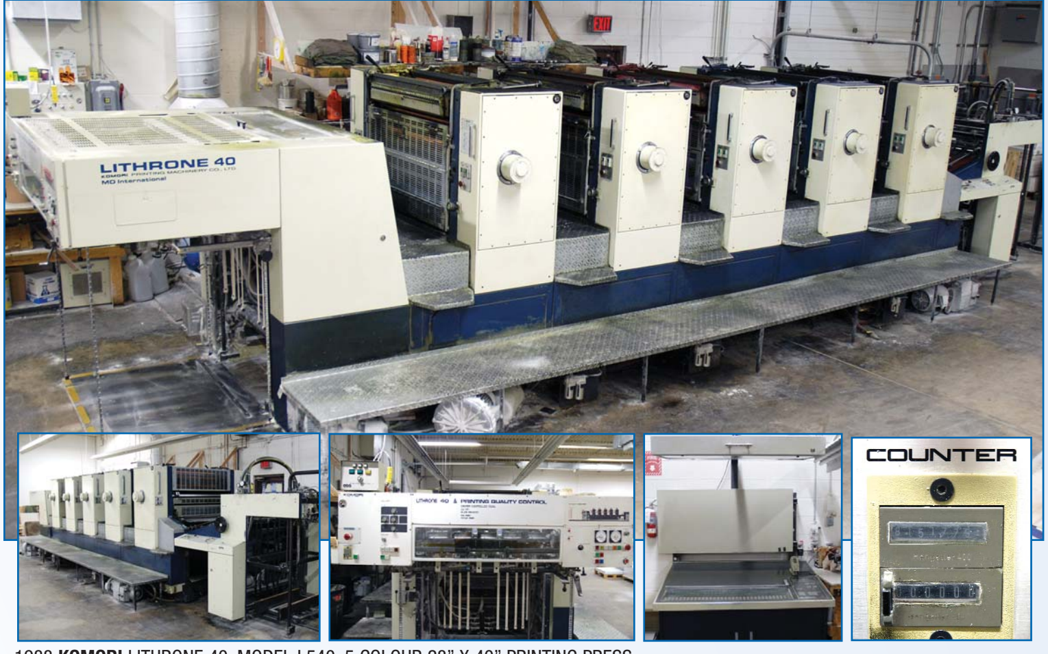
1988 KOMORI LITHRONE 40, MODEL L540, 5 COLOUR 28" X 40" PRINTING PRESS