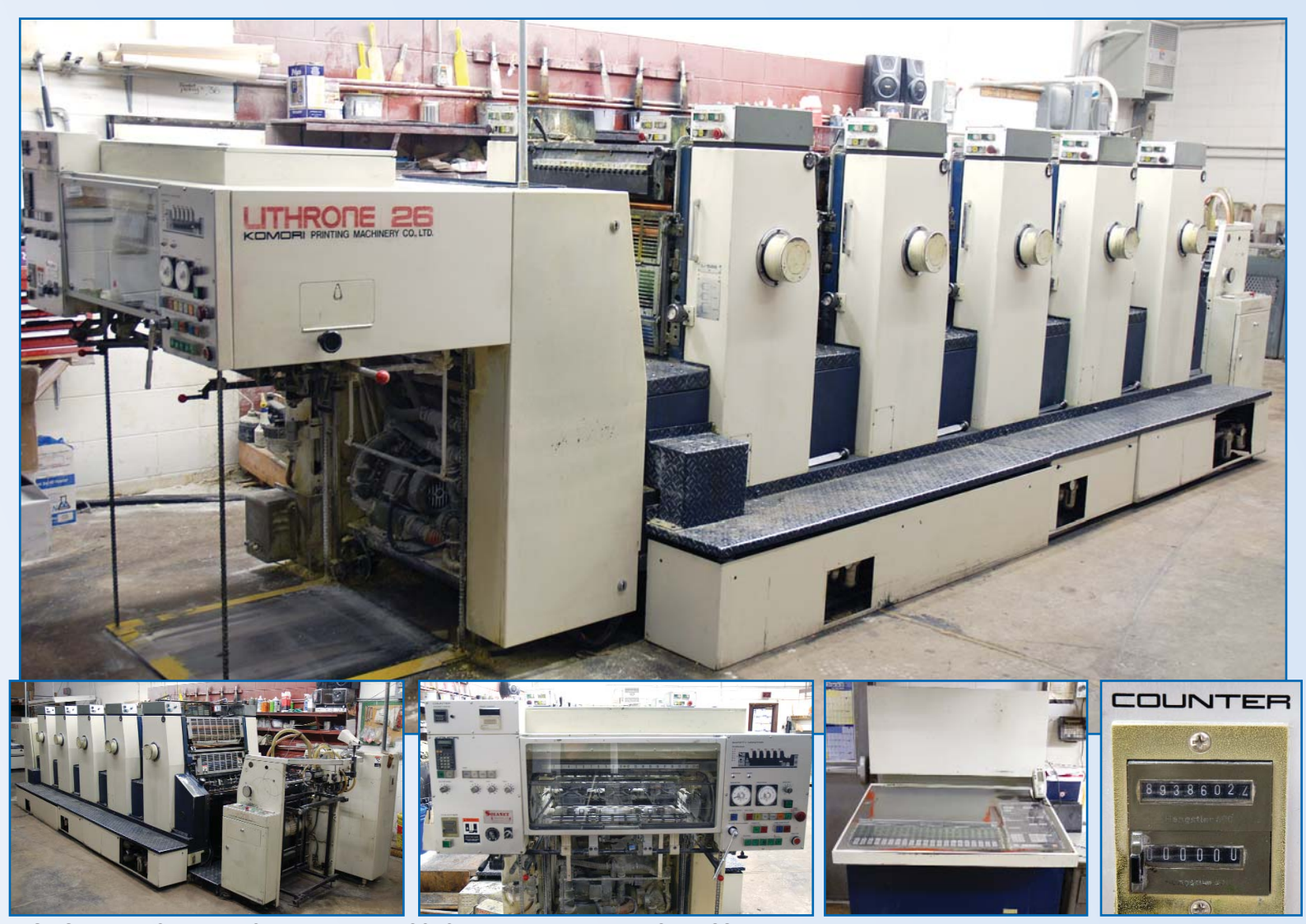
KOMORI LITHRONE 26, MODEL L-526-II, 5 COLOUR 20" X 26" PRINTING PRESS