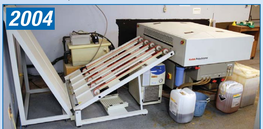
KODAK POLYCHROME PROCESSOR, MODEL SWORD 34