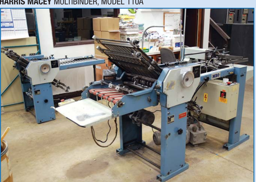
MBO MODEL T52-44, 20" FOLDER