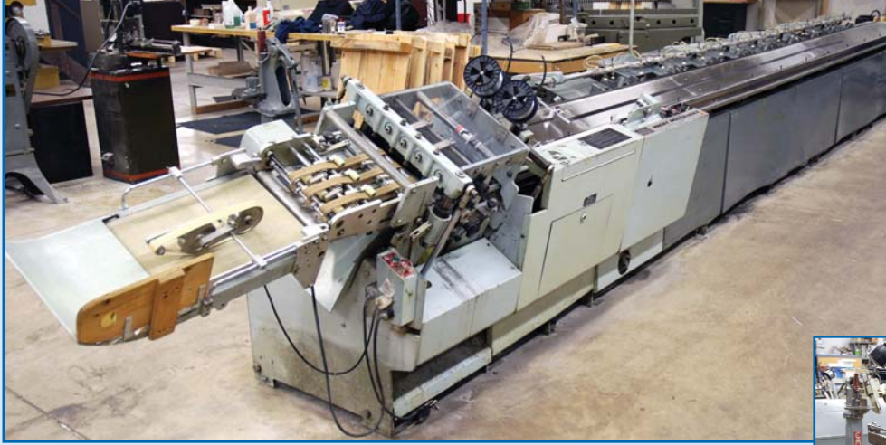
HARRIS MACEY MULTIBINDER, MODEL 110A