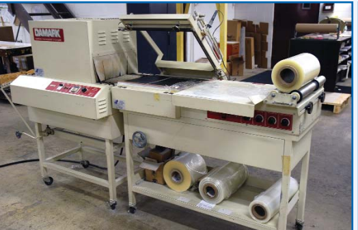
DAMARK I BAR SEALER & SHRINK WRAP HEAT TUNNEL