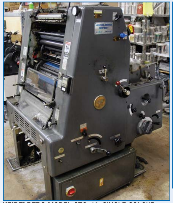
HEIDELBERG MODEL GTO-46, SINGLE COLOUR PRINTER, 12" X 18"