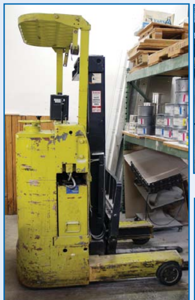
MITSUBISHI 2,200 LB REACH TRUCK