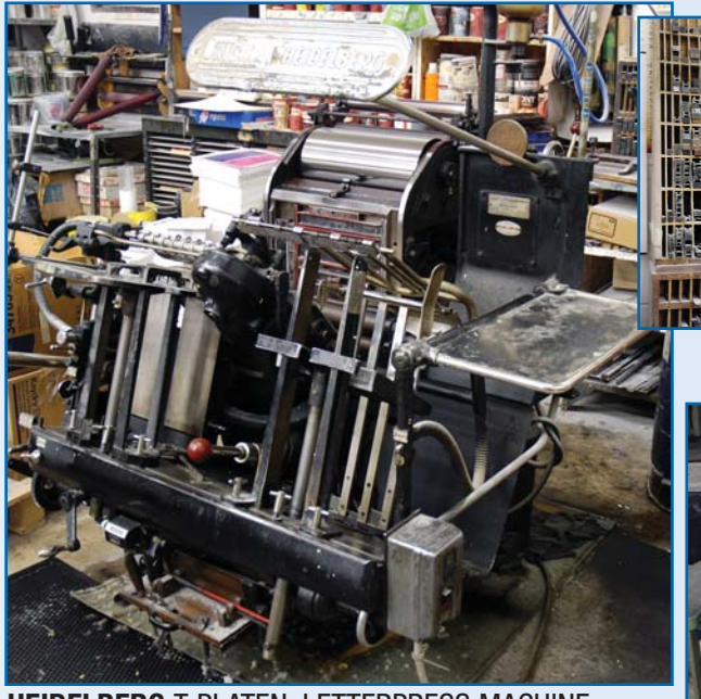
HEIDELBERG T PLATEN, LETTERPRESS MACHINE, 10" X 15"