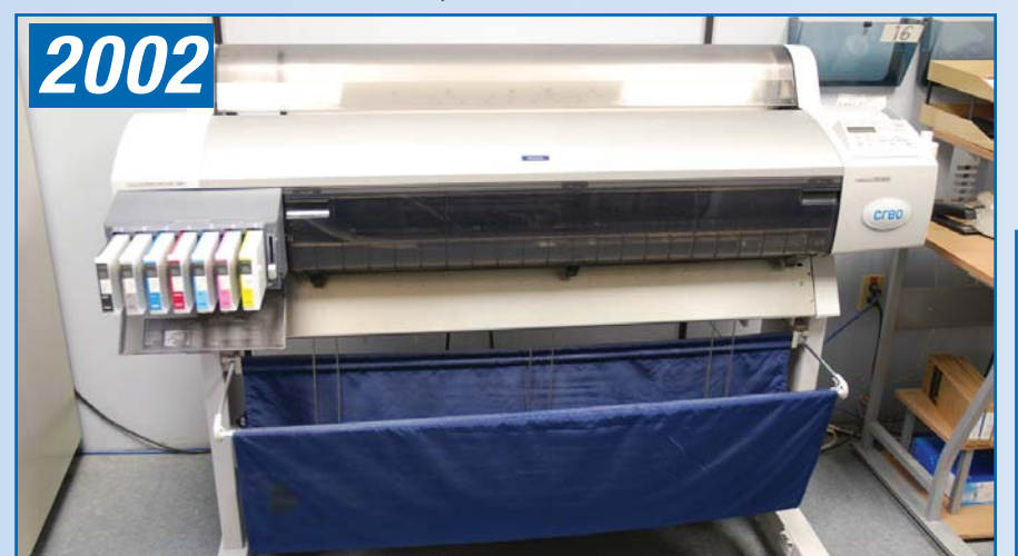
EPSON (CREO) STYLUS MODEL PRO 9600 PRINTER