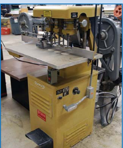
CHALLENGE MODEL EH3-A, 3 HEAD PAPER DRILL