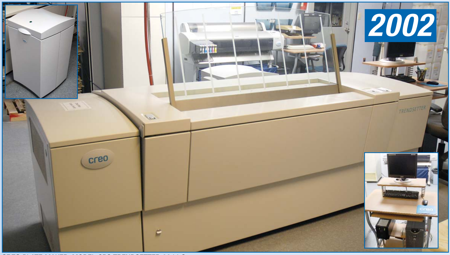
CREO PLATE MAKER, MODEL CRS TRENDSETTER 3244 S