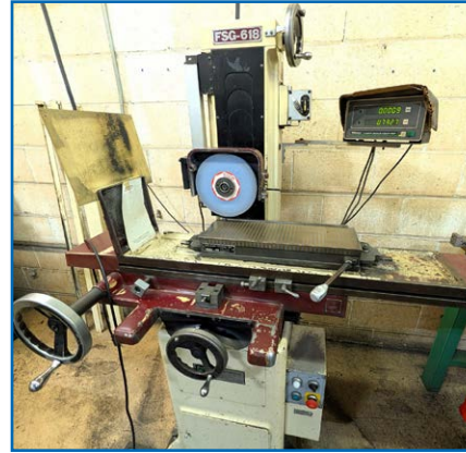
CHEVALIER FSG-618C SURFACE GRINDER