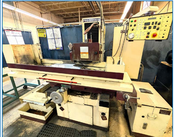
CHEVALIER FSG-1224ADII SURFACE GRINDER