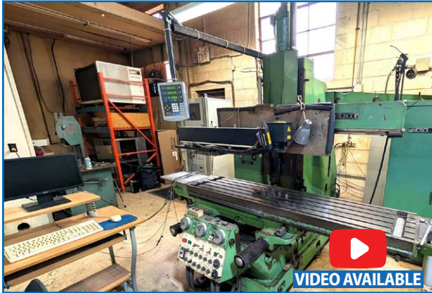
HOSOI LASER ENGRAVER