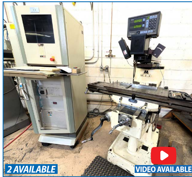
FOBA GMBH FOBALAS 94 LASERMARKING SYSTEM