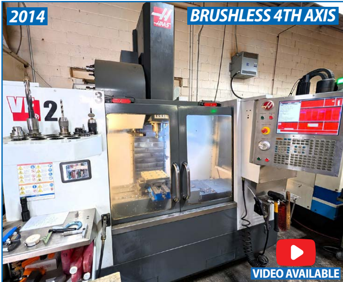
HAAS VF-2 CNC VERTICAL MACHINING CENTER