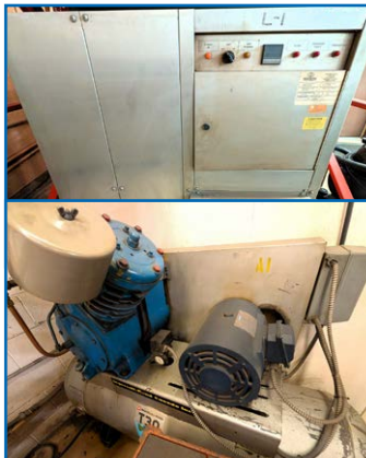
PARTIAL VIEW OF PLANT SUPPORT EQUIPMENT