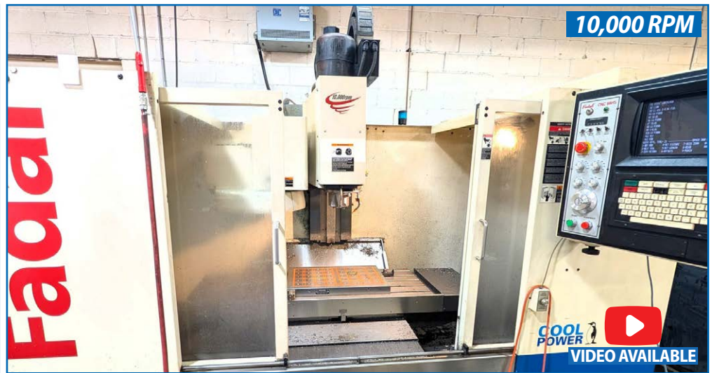
FADAL 906-1 VMC 4020HT CNC VERTICAL MACHINING CENTER