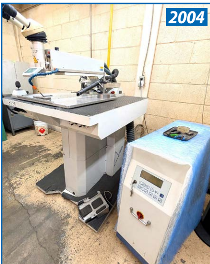
ALPHA LASER LASER WELDING SYSTEM