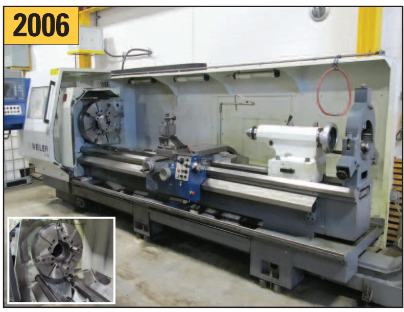
28.6" x 120" Weiler E70x3000 , Siemens 810D CNC -Teach control, 6" Spindle Bore, 50 HP, 24" 4 Jaw chuck + 24" Rear mounted chuck, Steady Rest, Parat tool post, boring bar holder, chip conveyor, s/n 0422, New 2006