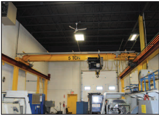
5 Ton Gantry Crane

MANY OFFICES W/DESKS, CHAIRS AND SUPPORT EQUIPMENT AVAILABLE