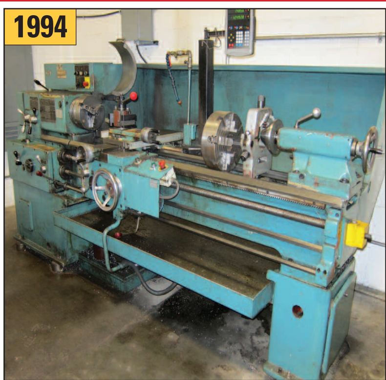
16" x 60" TOS SN-40C Engine Lathe , 8.7" swing OCS, 2000 RPM, 7.8 HP, Taper, DRO, I/M threading, s/n 08401597, New 1994