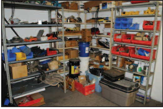
View of Maintenance Room