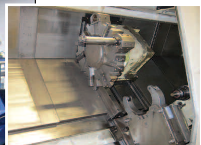
Daewoo Puma 400LB-2000, Fanuc 18i-T control, 4.62" bar cap., 30" swing x 82" centers, 1500 RPM, Geared, 50 HP, 10 position turret, Q-Setter tool pre-setter, tailstock, Programmable Steady Rest, chip conveyor, s/n P35L02287, New 2001