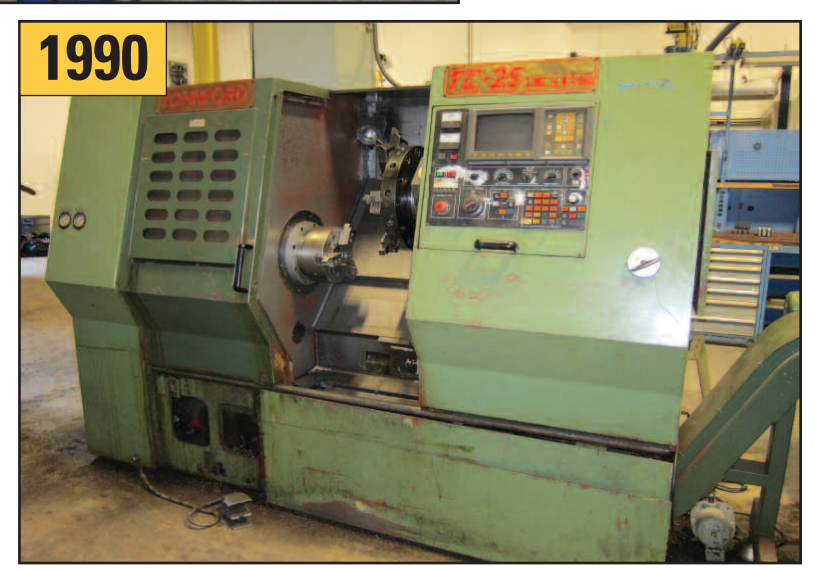
Johnford TC-25 2-Axis CNC Turning Center, Fanuc 0T, 8" 3 jaw chuck, 12 position turret, tailstock, chip conveyor, s/n A9008018, New 1990