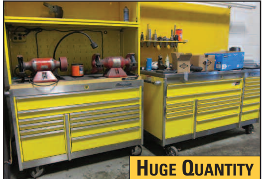
View of Cabinets