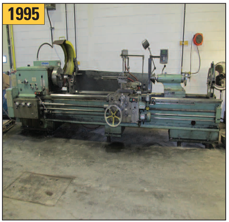
24.8" x 110" Stanko IS63 Engine Lathe, 2.75" bore, 1250 RPM, 20 HP, Taper, DRO, 2 Programmable Steady Rest, 16" 3 Jaw chuck, s/n 1664, New 1995