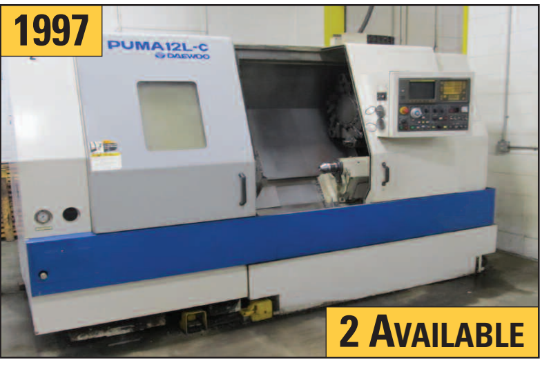
(2) Daewoo Puma 12 L-C, Fanuc OT, 4.6" spindle bore, 22.4" swing x 40.2" centers, 12" turning diameter, 2000 RPM, 40 HP, 12 position turret, 15" 3 Jaw chuck, tool pre-setter, s/n's PL120925 & PL121283, New 1996-97

Daewoo Puma 300C, Fanuc 21i-TB control, 4.5" bar cap., 22.4" swing x 40" centers, 15.7" max machining diam., 2800 RPM, 25HP, 12" 3-Jaw chuck, 10 position turret, Q-Setter tool pre-setter, tailstock, chip conveyor, s/n PM302344, New 2006