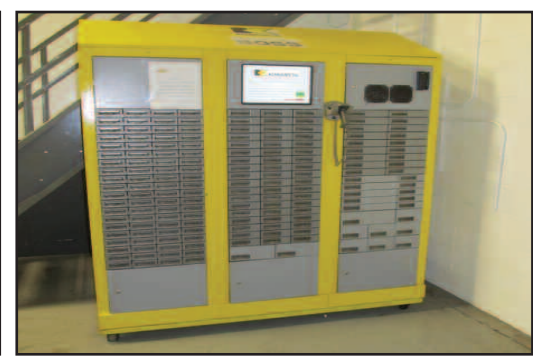
Kennanetal Carousel w/Huge Quantity of Inserts