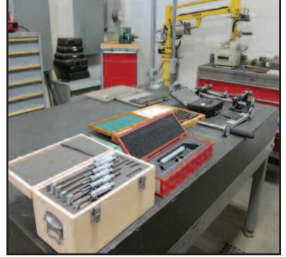
View of Gauge Room