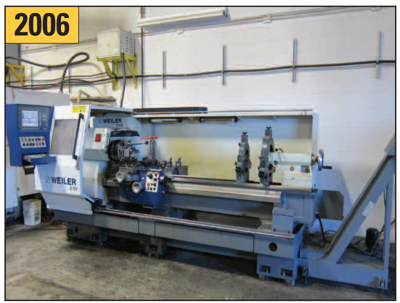
22.6" x 79" Weiler E50x2000 , Siemens 810D CNC-Teach control, 3.2" bore, 2500 RPM, 27 HP, 12" 3 Jaw self centering chuck, Steady Rest, Parat tool post, boring bar holder, chip conveyor, s/n BF01, New 2006