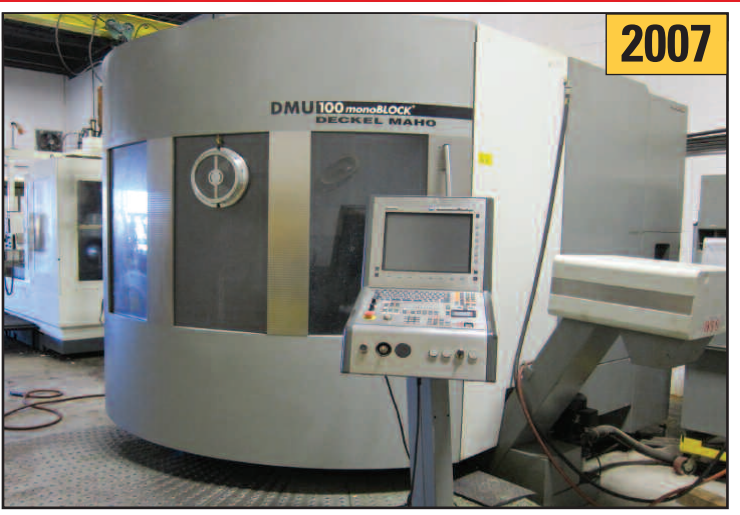
DMG DMU100 MonoBlock 5-Axis CNC Vertical Machining Center