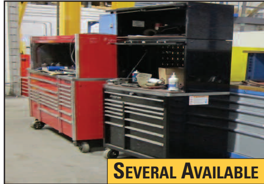
Snap-On Tooling Cabinet