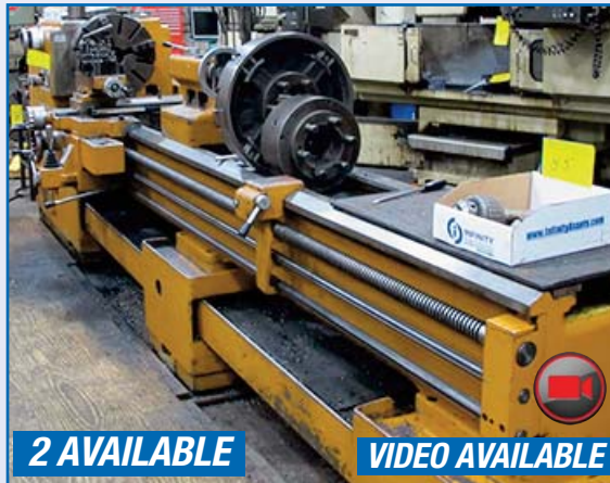
PBR TM-350 GAP BED LATHE