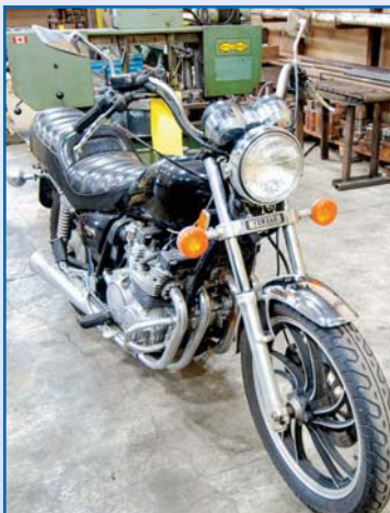
YAMAHA MAXIMUM 650 MOTORCYCLE