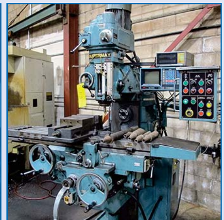
SUPERMAX YCM-2GS UNIVERSAL MILLING MACHINE