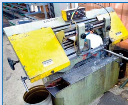
VICTOR 916 HORIZONTAL BANDSAW, S/N JB06700