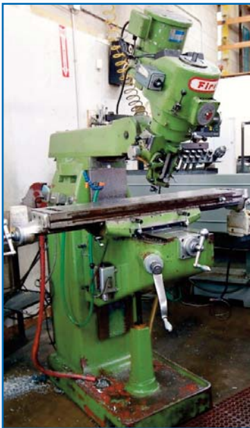
FIRST LC-18VA VERTICAL MILLING MACHINE ACU-RITE 2-AXIS DRO, 9" X 49" TABLE, ALIGN POWER FEED, S/N 77120738