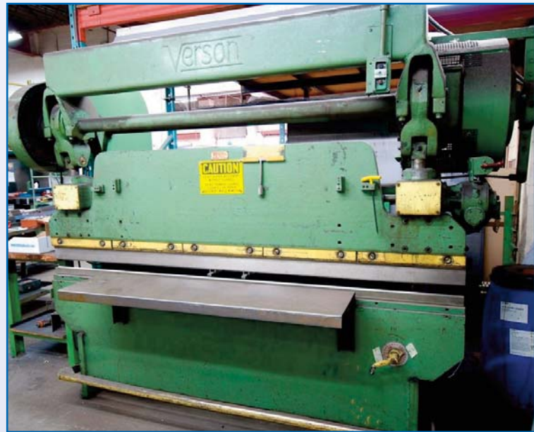
VERSON PRESS BRAKE, 8' X 1/8" CAP., S/N 6799-2078