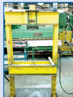
SIGURD STENHOJ 25 TON SHOP PRESS