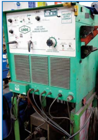
LINDE UCC-305 WELDING POWER SOURCE, S/N C84C-41824