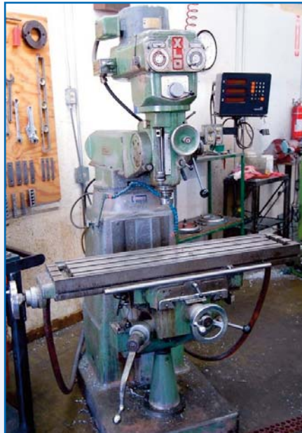
EX-CELL-O XLO VERTICAL MILLING MACHINE, 9" X 42" TABLE, 3-AXIS DRO