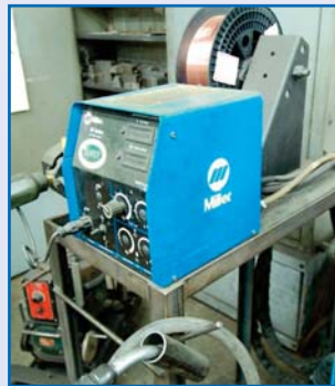
MILLER 60 SERIES WIRE FEEDER