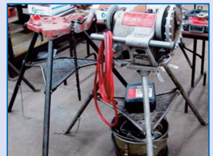
RIDGID 300 PIPE THREADER W/ TRISTANDS