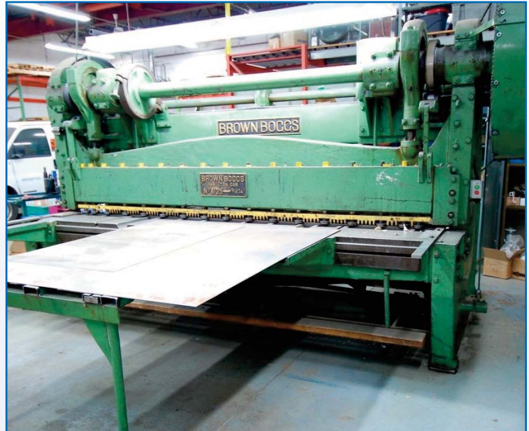
BROWN BOGGS NO. 6125 SHEAR, 3/16 GA X 10' CAP., BACK