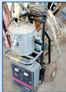
BINKS ELECTROSTATIC PAINT SPRAY SYSTEM