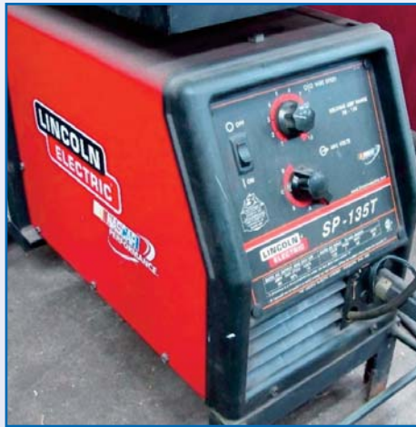
LINCOLN SP-135T WELDER