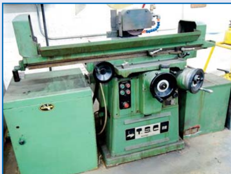
TSC NB SURFACE SURFACE GRINDER, 9" X 20"