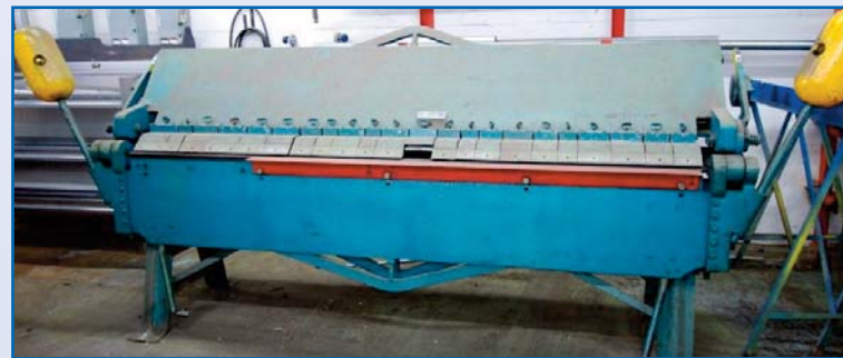
CHICAGO L37 BOX & PAN BRAKE, 8' X 12GA CAP., S/N 101367