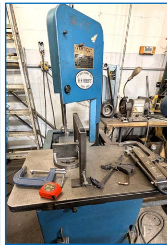
VERTICUT ROLL-IN BANDSAW