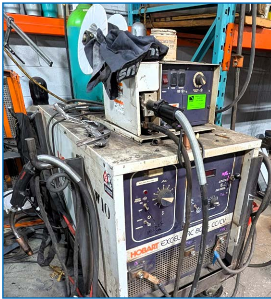
HOBART EXCEL-ARC 8065 WELDER