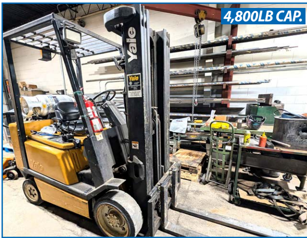
YALE PROPANE FORKLIFT