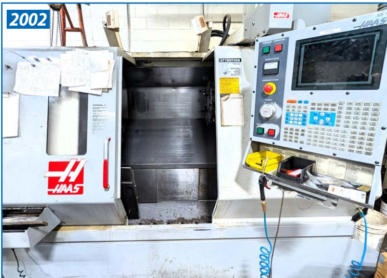
HAAS SL-30T CNC TURNING CENTER

2470 Lucknow Dr., Unit 7, Mississauga, ON