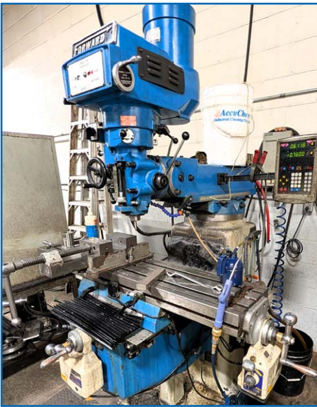
FORWARD VERTICAL MILLING MACHINE