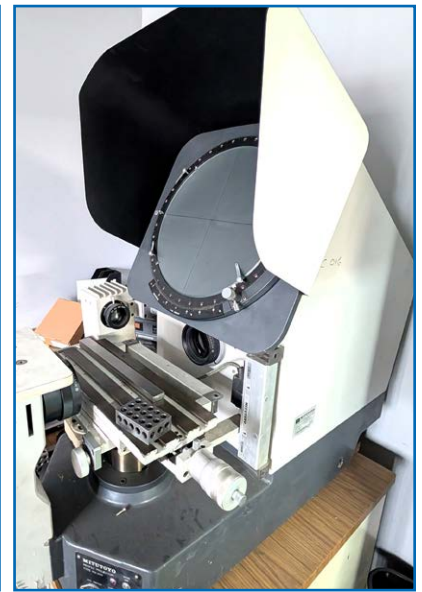
MITUTOYO PH-350 PROFILE PROJECTOR