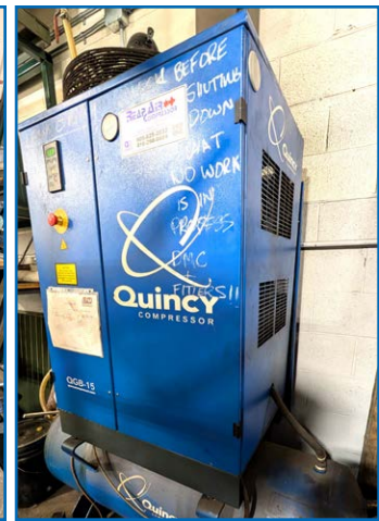
QUINCY QGB 15 COMPRESSOR

2002 HAAS SL-30T CNC Turning Center, CNC Control, 3-Jaw Chuck, Tool Setter, Turret, Tailstock, Chip Auger, s/n 65433