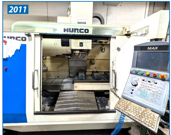
HURCO VM20 CNC VERTICAL MACHINING CENTER