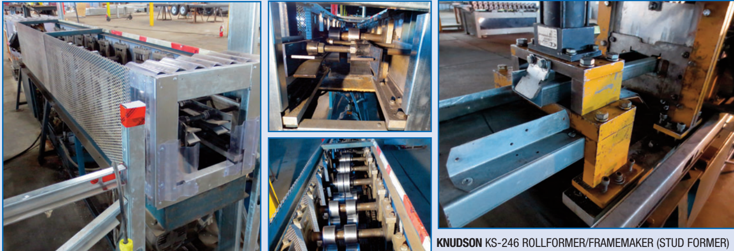
KNUDSON KS-246 ROLLFORMER/FRAMEMAKER (STUD FORMER 10 STAND, TOOLED FOR 3.5" METAL STUDS, 2" ARBOR WITH MANUAL UNCOILER AND CUT OFF S/N 8753 (UNIT 7)