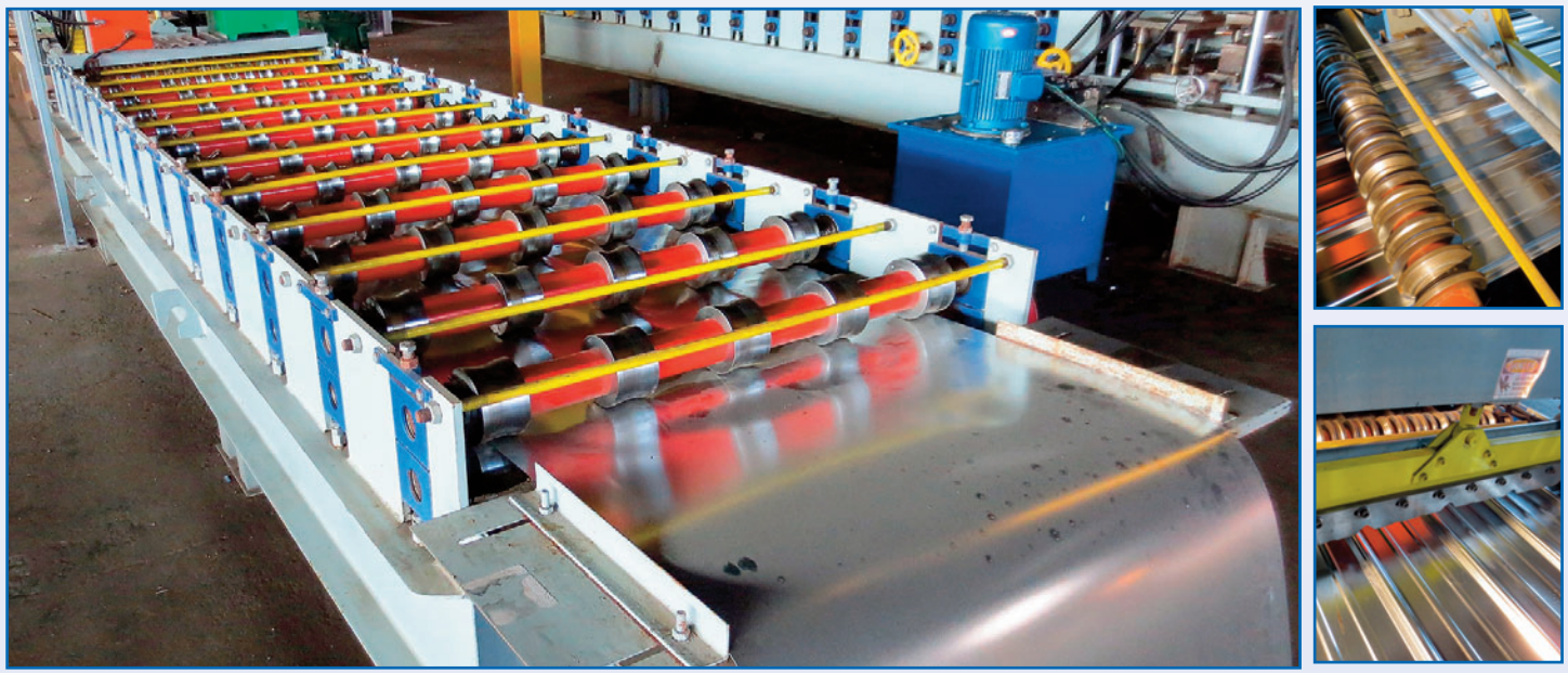
CSC ROLL FORMER/ROOF PROFILER WITH 13 STANDS, 37" WIDTH S/N 04161981 (UNIT 2)