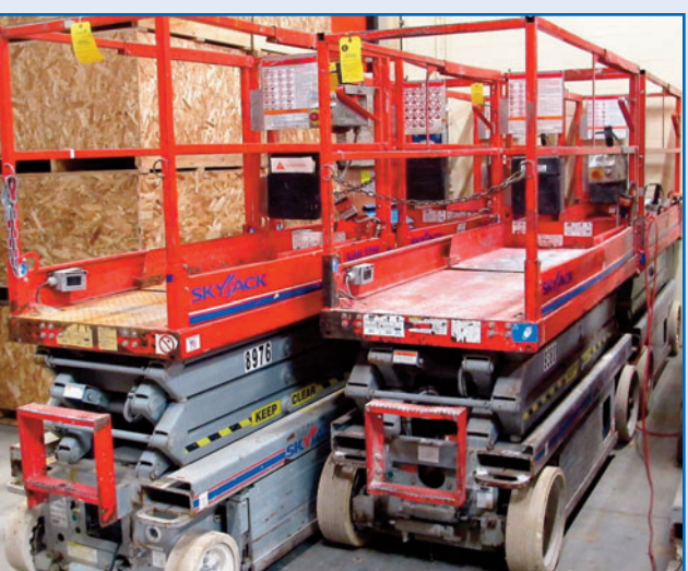
(5) 2008/2007 SKYJACK SJIII-3219/20 ELECTRIC SCISSOR LIFTS (LOW HOURS)