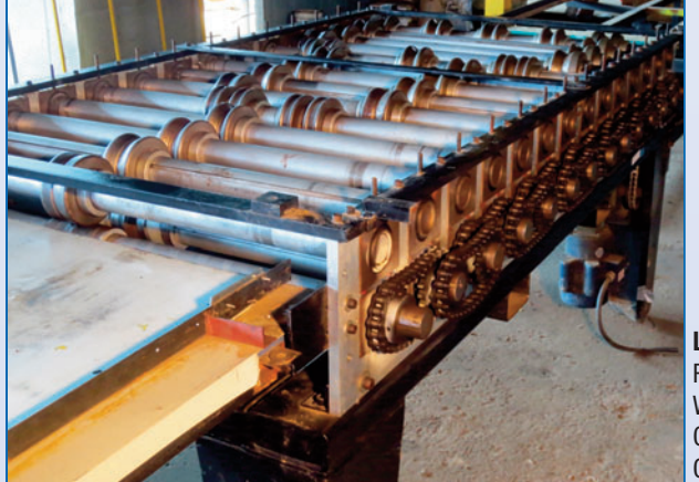
LEESON FORMER / ROOF PROFILER WITH 42" WIDTH CAPACITY S/N CEJ38GA (UNIT 1)