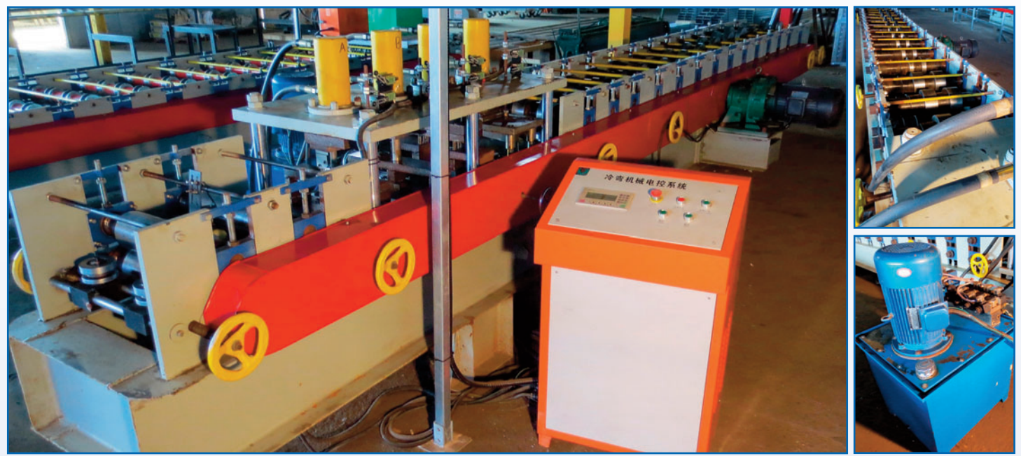
SMALL C FORMER - ROLL FORMER/STUD FORMER WITH 16 STANDS, 15" WIDTH (UNIT 3)