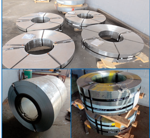
RAW MATERIAL - APPROXIMATELY 35,000 LBS. OF 15 ROLLS OF GALVANIZED COIL STOCK CONSISTING 5" TO 12.375" GALVANIZED COILS, (2) ROLLS OF 24 GAUGE HOT DIP GALVANIZED ALUMINUM

40FT X 14FT TRAILER WITH UNFINISHED EXTERIOR AND INTERIOR