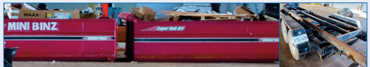
2011 WEBER LANE MFG. TRA/REM TRAILER ROLL OFF SYSTEM CONSISTING OF DUAL AXLE TRAILER WITH GVWR 7,100 LBS, ELECTRIC WINCH AND (3) 20 CUBIC YARD BINS