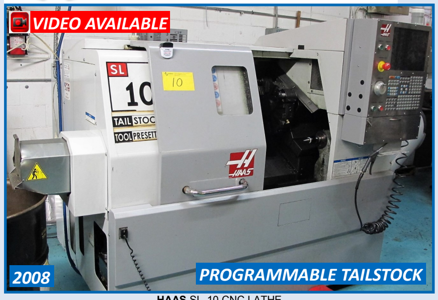
HAAS SL-10 CNC LATHE