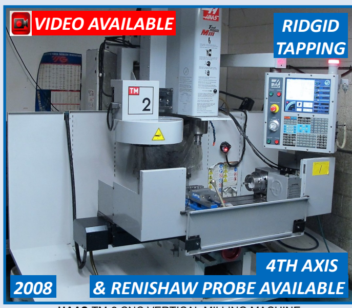
HAAS TM-2 CNC VERTICAL MILLING MACHINE