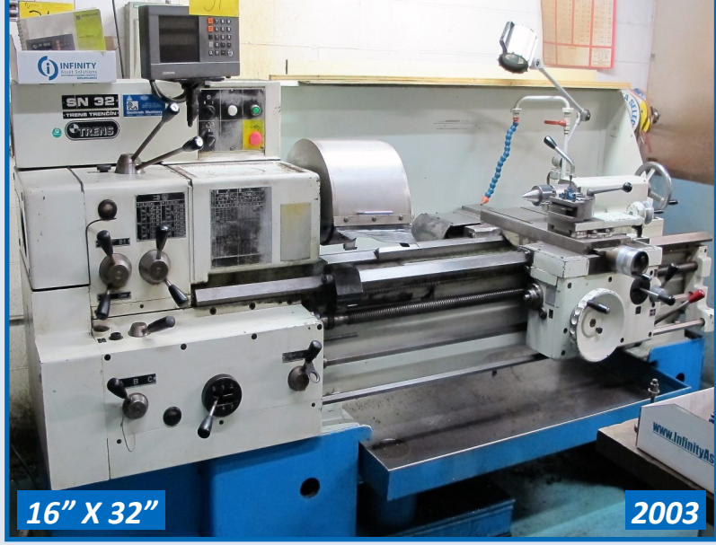
TOS SN 32 ENGINE LATHE

Online Auction Only: Bidding Closes Tuesday December 11th, 11:00AM (ET)