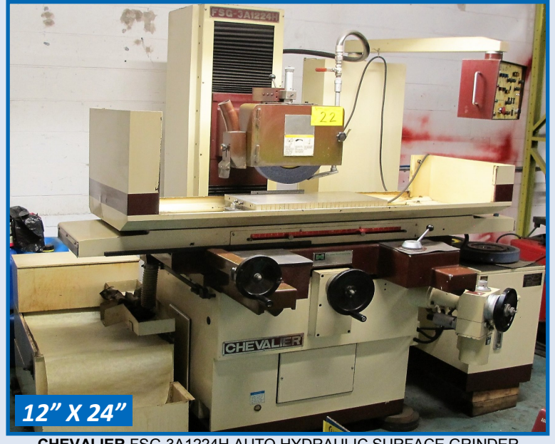
CHEVALIER FSG-3A1224H AUTO HYDRAULIC SURFACE GRINDER