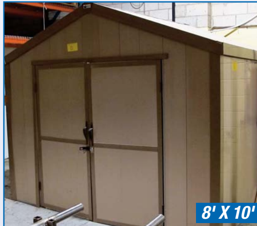
ROYAL OUTDOOR SHED