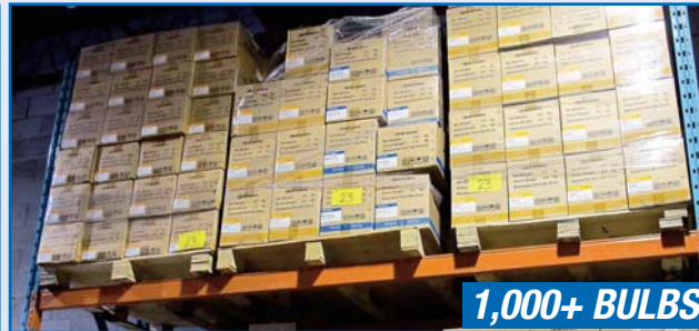
ARTEMIS HIGH PRESSURE SODIUM LAMPS