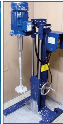
FARFLY BPF-H DISPERSING MACHINE