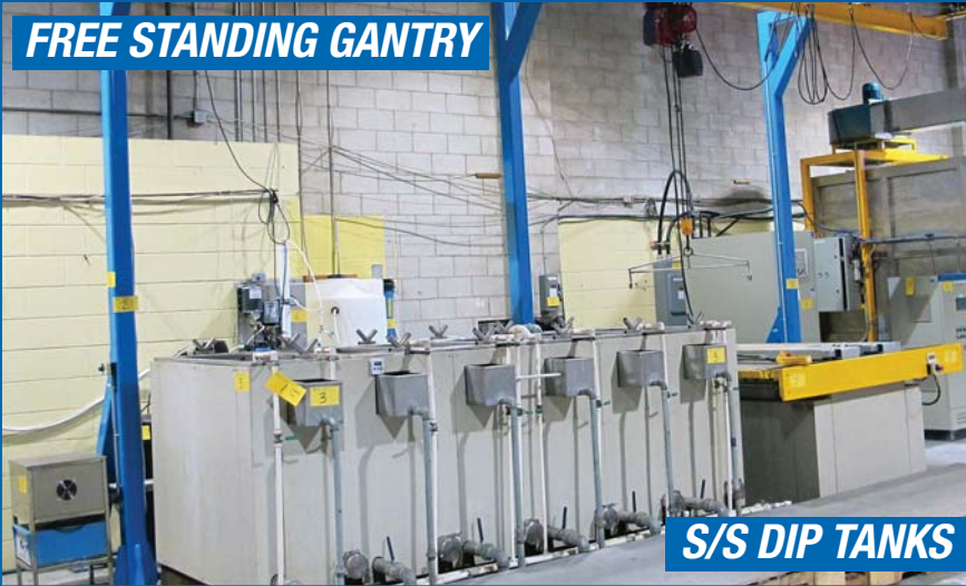
S/S DIP TANKS