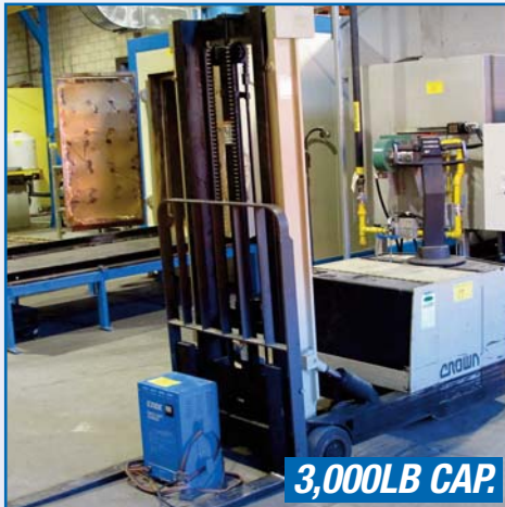
CROWN 30WBTL ELECTRIC STACKER

2015 PARTS COATING LINE Consisting of: Approx. 28'L Free Standing Crane/Gantry System w/ DLMAG 500kg Cap. Electric Hoist, Pendant Control, Approx. 132"L x 54"W x 54"H Stainless Steel Dip Tank System w/ (6) Partitions – each 19.25"W x 47.5"L x 43"H, Valves, Control Panel, (10) Stainless Steel Part Racks, Water Purification System w/ Pumps, Filters, Tanks, Approx. 82"L x 65"W Dryer Table w/ 1.5KW Blower, PRO-POINT 8475022 Air Compressor, 10HP, Semi-automatic Robotic Paint Spray Booth, 3-Head Sprayer, Product Turntable, Manual Touch-up Gun, 54"W x 48"L x 102"H I.D., 380V, 24AMP, Control Panel, Paint Mixer/Feed Units, Exhaust System, CUSTOM THERMAL APPLICATIONS INC. Coating Curing Oven, s/n 15065-0, Natural Gas, 800,000 BTU/Hr, 3min Purge Time, Rail Mounted Product Infeed, 61"L x 61"W Opening, Approx. 16'L I.D., 7.5KW Blower, Control Panels, (6) Rail Mounted Product Carts w/ (169) Individual Product Mounts, REX MANUFACTURING 150KVA Transformer