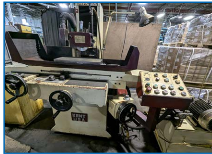
KENT SGS-1020AHD SURFACE GRINDER