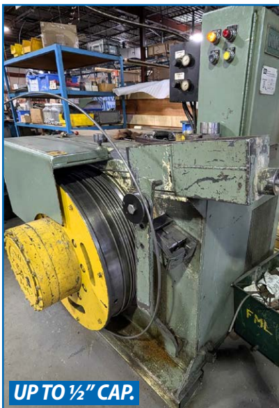
UP TO 1/2" CAP.