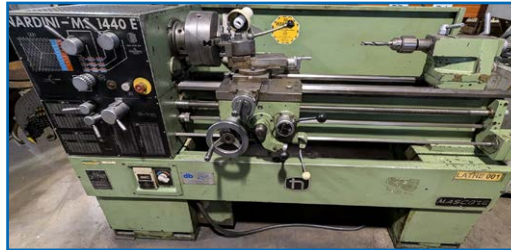
NARDINI MS 1440 E LATHE