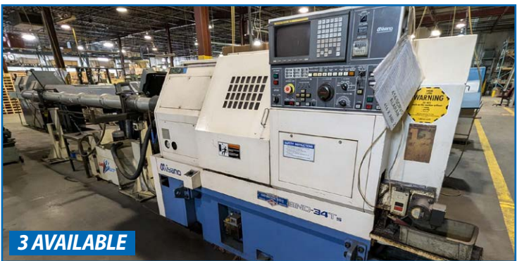
3 AVAILABLE PARTIAL VIEW OF MIYANO CNC LATHES