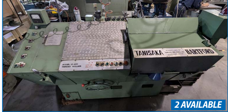
TANISAKA HARTFORD 10-400 THREAD ROLLER