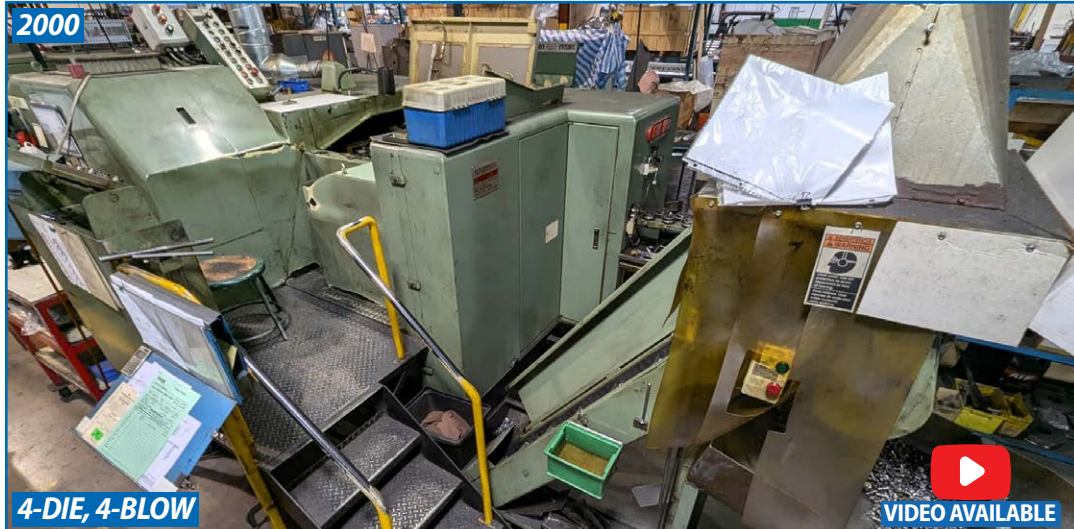
2000 4-DIE, 4-BLOW JERN YAO ENTERPRISES JBF-17B4S BOLT FORMER

MIYANO BNC-34T CNC Lathe, GE Fanuc Series O-T CNC Control, s/n BN3381TU w/ LNS Hydrobar Bar Feeder