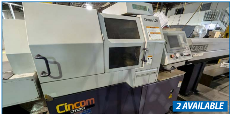
CITIZEN CINCOM L20 CNC LATHE