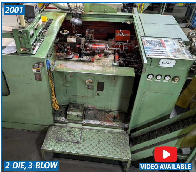
2001 2-DIE, 3-BLOW ASAHI SUNAC RH-80 HEADER