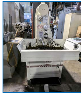
SUNNEN MBB-1660 HONE