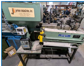
PARTIAL VIEW OF PLANT SUPPORT