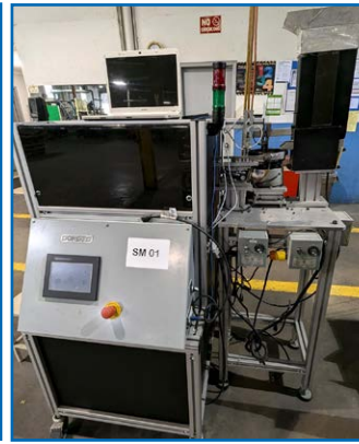
SORSYS INSPECTION MACHINE