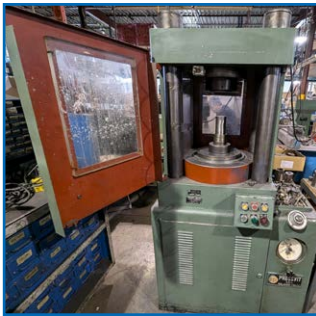
PARTIAL VIEW OF HOBGING PRESSES