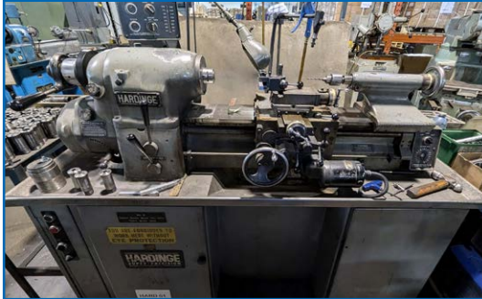
PARTIAL VIEW OF HARDINGE TOOLROOM LATHES