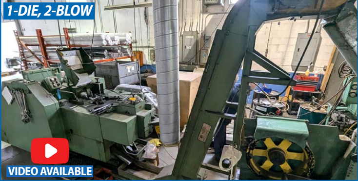
1-DIE, 2-BLOW NATIONAL MACHINERY 56 LONG STROKE COLD HEADER