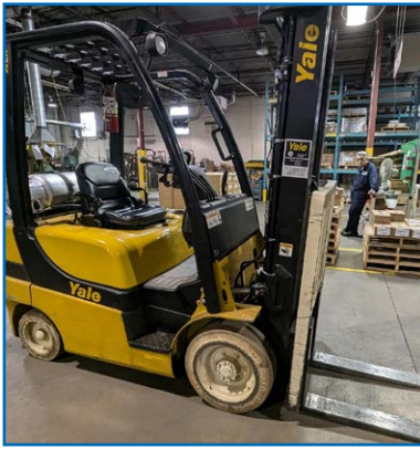
YALE PROPANE FORKLIFT