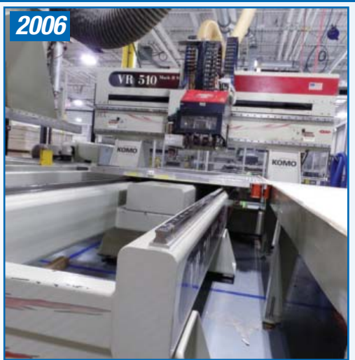
KOMO VR 510 MACH11 CNC ROUTER