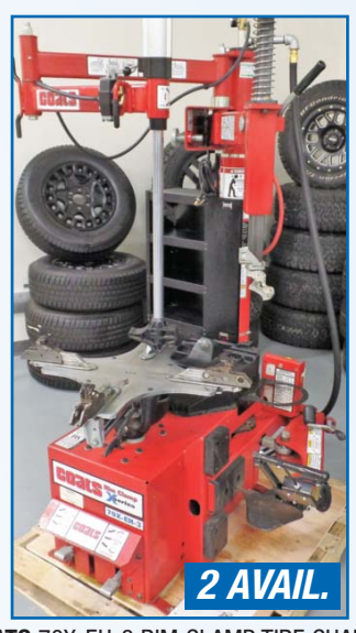
COATS 70X-EH-3 RIM CLAMP TIRE CHANGER