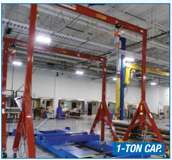
(3) WALLACE CRANES PORTABLE GANTRIES