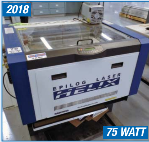
EPILOG HELIX 8000 CO2 LASER ENGRAVER