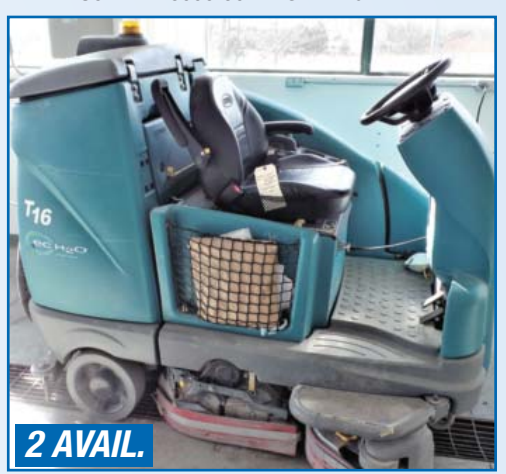
TENNENT T16 EC-H20 ECH0 RIDE-ON FLOOR SCRUBBER