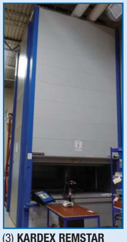
PARTS STORAGE SYSTEMS