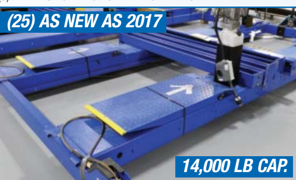
FORWARD LIFT/HYDRA LIFT DRIVE-ON 4-POST VEHICLE HOISTS