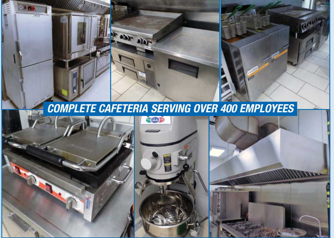
PARTIAL VIEW OF CAFETERIA EQUIPMENT