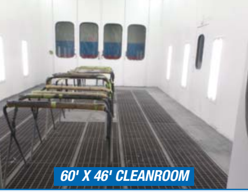
SELF CONTAINED DRIVE THROUGH PAINT BOOTHS