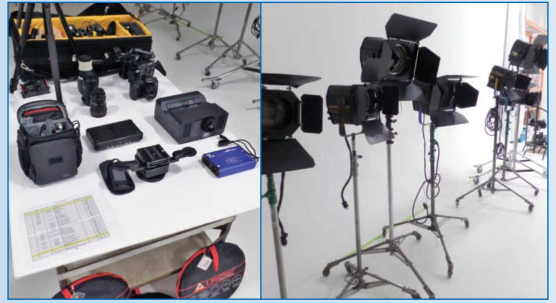
PARTIAL VIEW OF PHOTOGRAPHY EQUIPMENT