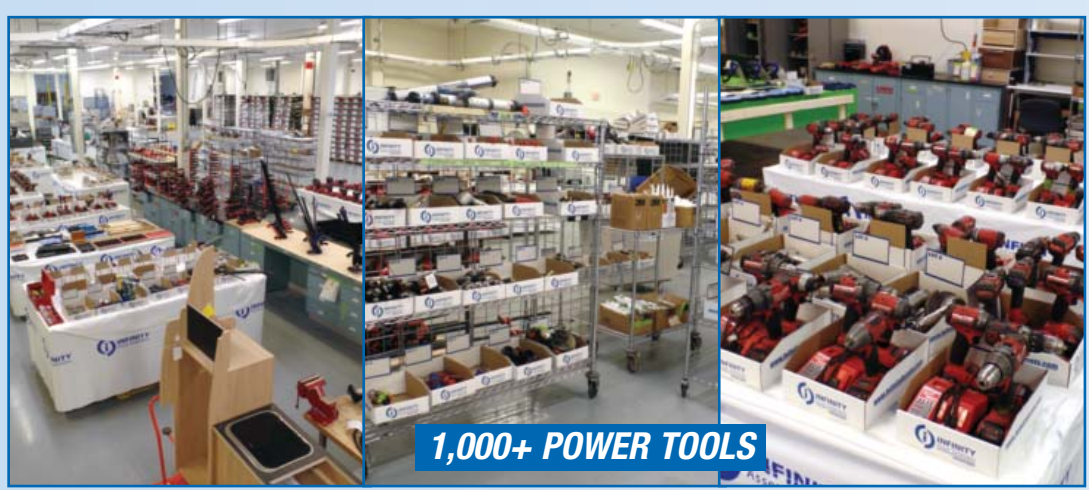
PARTIAL VIEW OF SUPPORT EQUIPMENT