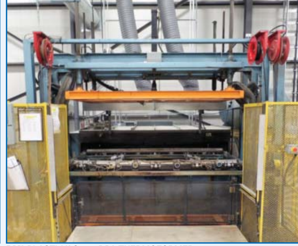
PMI PLASTI-VAC 408DPA THERMOFORMER