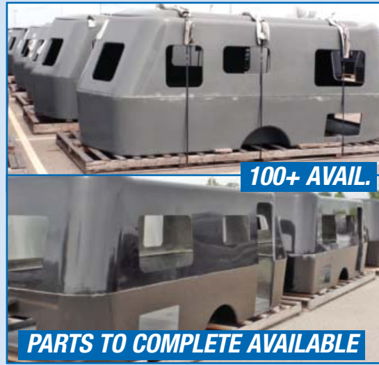
HYMER TOURING GT TRAVEL TRAILER FIBERGLASS SHELLS