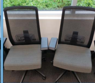
PARTIAL VIEW OF LATE MODEL OFFICE FURNISHINGS