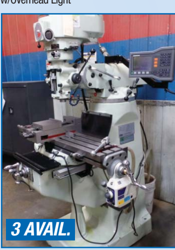
FIRST LC1-1-2VS VERTICAL MILL

(65) Metal Base Static Work Benches w/Overhead Light