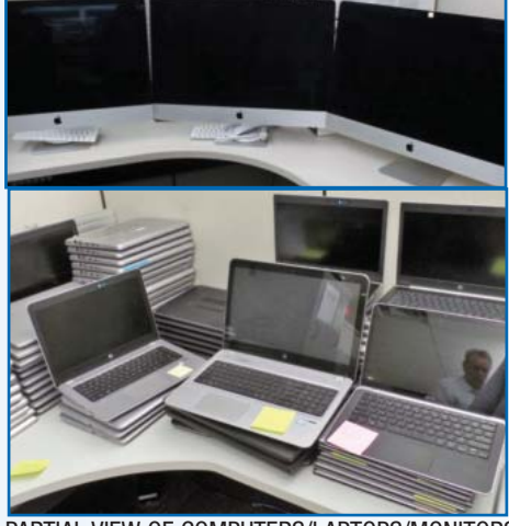
PARTIAL VIEW OF COMPUTERS/LAPTOPS/MONITORS

Over (175) Steelcase Modular Work Stations (Various Configurations) Light Grey W/Gun Metal Gray Trim, Etched Divider Panel Screens, Pedestal Drawers, Personal Storage, Overhead Storage, Single & Double Station