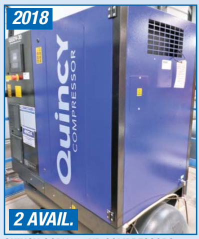
QUINCY QGDV-30 AIR COMPRESSORS