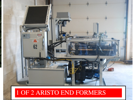
1 OF 2 ARISTO END FORMERS