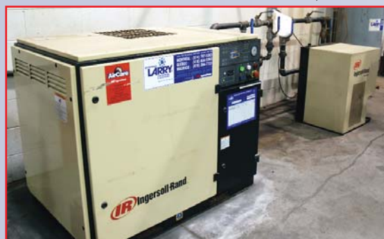
VIEW OF INGERSOLL RAND 30 HP COMPRESSOR, DRYER & OIL FILTERS