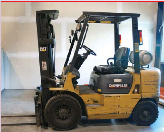
CATERPILLAR PROPANE FORKLIFT MODEL GP25K, 5,000 LB CAPACITY