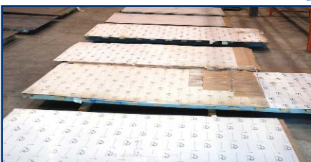
34 - SHEETS ASSORTED STAINLESS STEEL