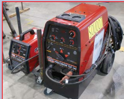
VIEW OF LINCOLN ELECTRIC TIG 185 & SP-175 WELDERS