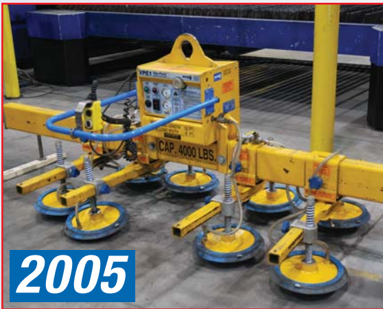
ANVER 4,000 LB CAPACITY SUCTION LIFT

21 – Sheets Assorted Aluminum from .09” to 1/4”, Sheet Sizes From 4’x8’ to 4’x10’ 15 Skids Of Assorted Steel, Stainless & Aluminum Offcuts, Up To 1” Thick Steel