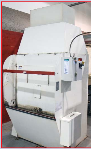
MIDWEST SANDRIGHT CORP WET TYPE DUST COLLECTOR, MODEL DC2800