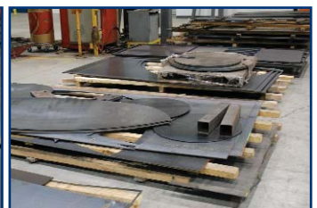
15 - ASSORTED SKDS OF OFFCUTS, UP TO 1" THICK STEEL