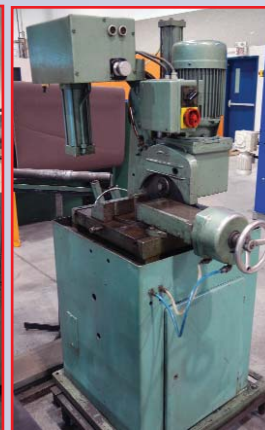
10" CHOP SAW