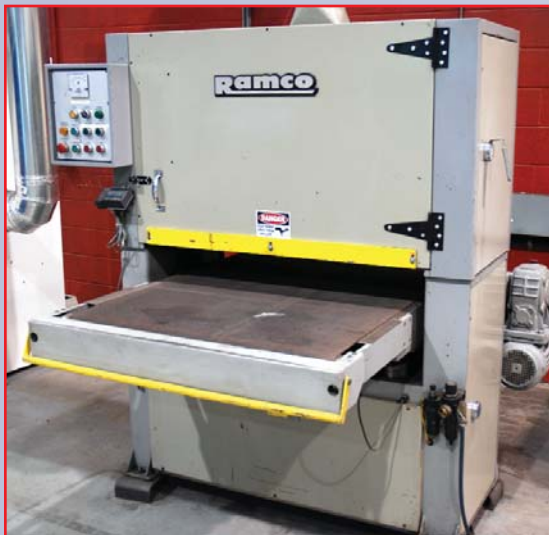
RAMCO MODEL DW-37R, 36" WIDE BELT SANDER

27 - Sheets Assorted Steel & Checker Plate from 10 Gauge .134" to 1/2", Sheet Sizes From 4'x8' to 5'x10'