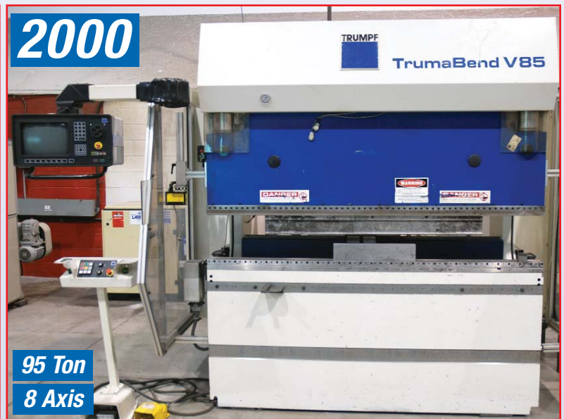
TRUMPF 95 TON CNC HYDRAULIC PRESS BRAKE MODEL TRUMABEND V85