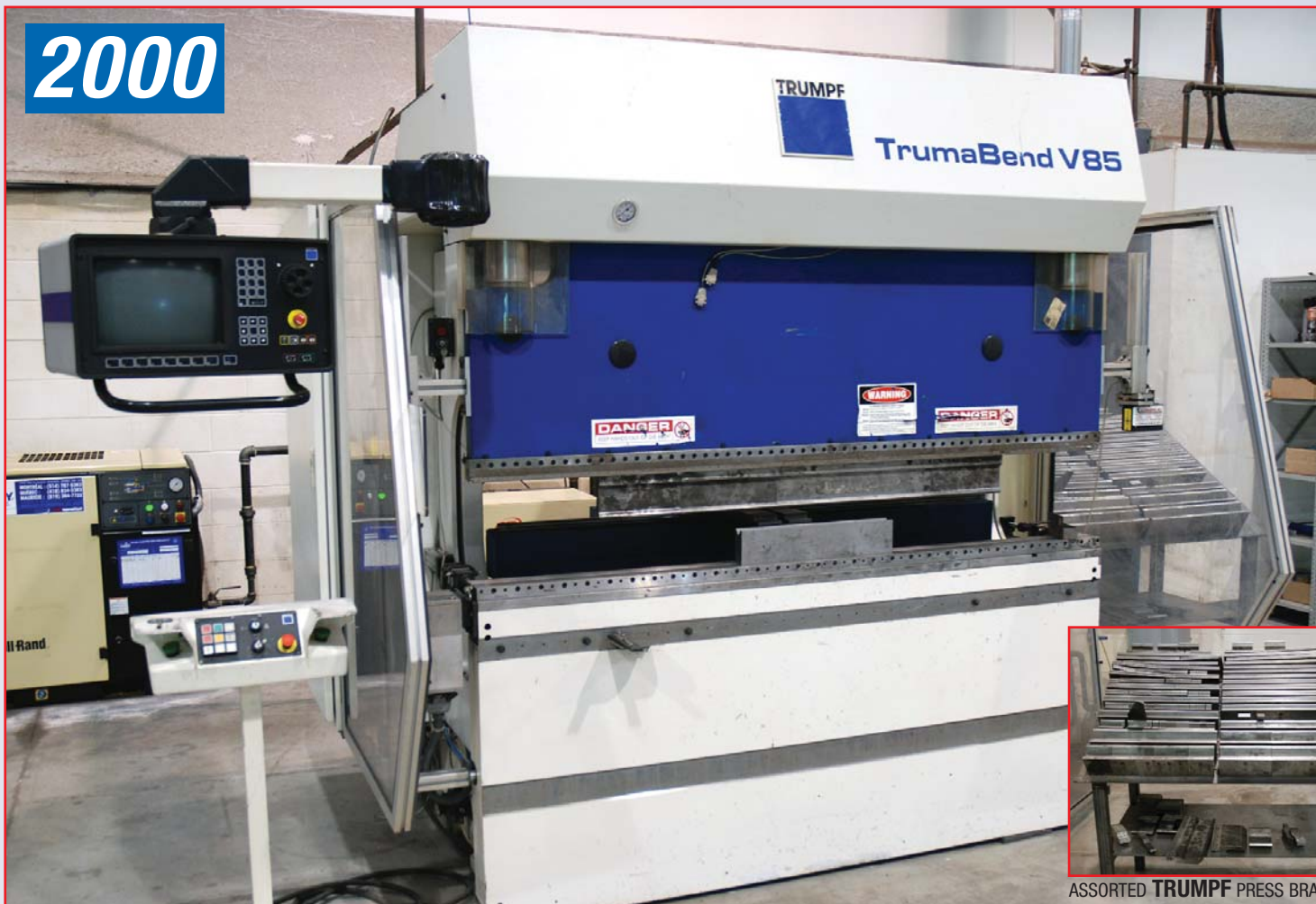
ASSORTED TRUMPF PRESS BRAKE TOOLING

TRUMPF 8 Axis CNC Hydraulic Press Brake Model TrumaBend V85, 95 Ton Capacity, Delem DA65 CNC 8-Axis Control, 4 Axis CNC Back Gauge (X,R,Z1,Z2), V- Axis CNC Programmable Crowning, I-Axis CNC Programmable Die Shift, Max Bending Length 81", Distance Between Housing 69", Open Height 15.15", Speeds: 710 IPM Advance, 2-24 IPM Pressing, 1200 IMP Return, Stroke Length 8.5", Bending Capacity 1/4" x 6', Throat Depth 16", 4 Axis Back Gauge (XR2122), X Travel 24", Speed of Travel in X – 1,200 IPM, R Axis Travel (Back Gauge Up/Down) 9.8", Hydraulic Clamping Top & Bottom, CNC Crowning, Laser Light Curtains, Palm Button & Foot Pedal Control, 460V, sn 883474