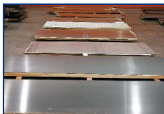
21 - SHEETS ASSORTED ALUMINUM