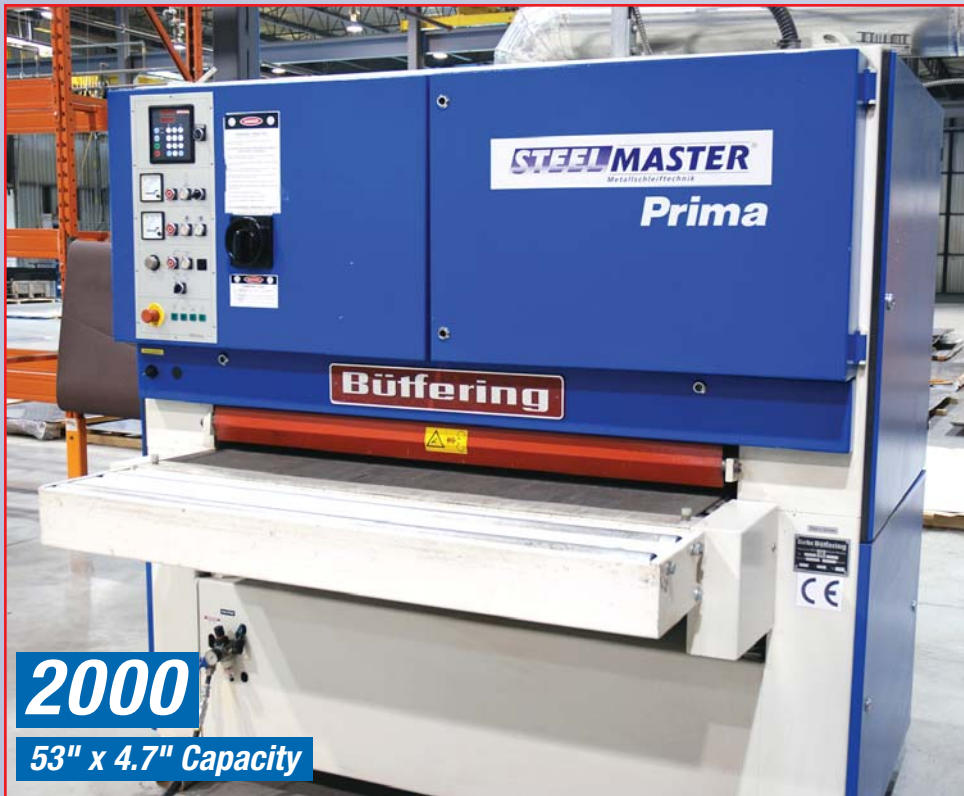
BUTTERING / STEEL MASTER MODEL PRIMA 2-KB-13, DUAL HEAD, 53" WIDE BELT SANDER