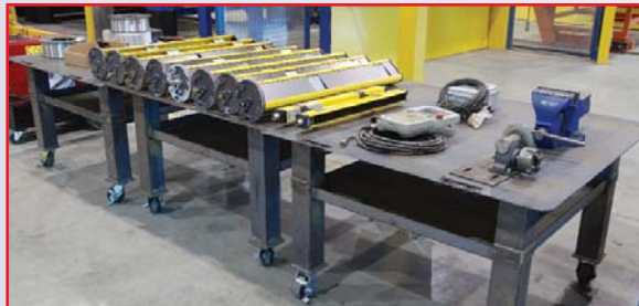
PARTIAL VIEW OF PRECISION INSPECTION EQUIPMENT, POWER TOOLS ETC.