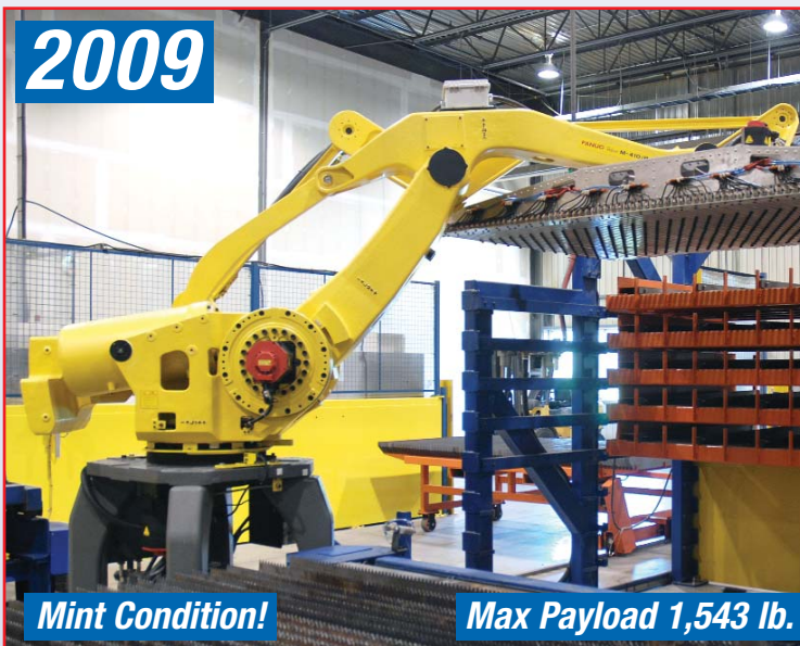
FANUC ROBOT MODEL M-410IB/700