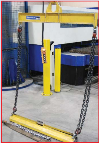
HERCULES 3,000 LB CAPACITY 4’ SPREADER BAR

This brochure is meant merely as a guide. Infinity Assets make no guarantee, expressed or implied, as to the accuracy of the information in this brochure. Buyers should inspect the goods beforehand to satisfy themselves.