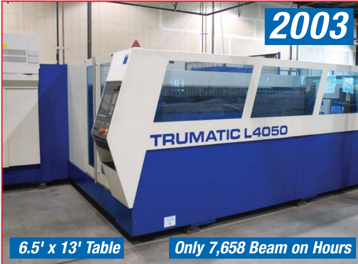
TRUMPF 5,000 WATT LASER MODEL TRUMATIC L4050

Complete TRUMPF CNC Laser Cutting & Fabrication Facility