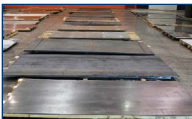
27 - SHEETS ASSORTED STEEL & CHECKER PLATE