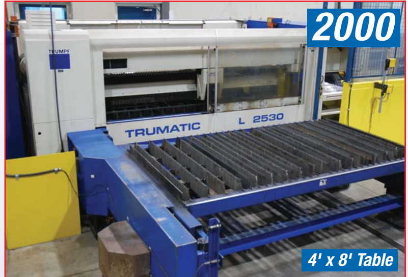
TRUMPF 3,000 WATT LASER MODEL TRUMATIC L2530