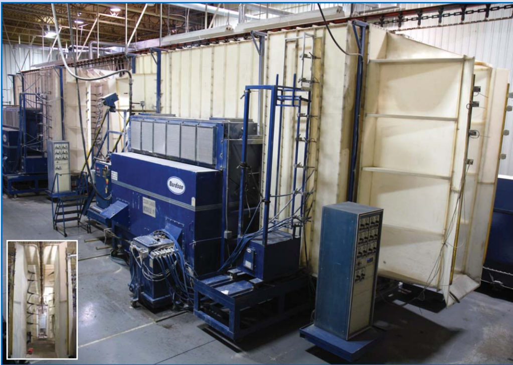
(2) COMPLETE NORDSON ELECTROSTATIC POWDER COATING SYSTEMS