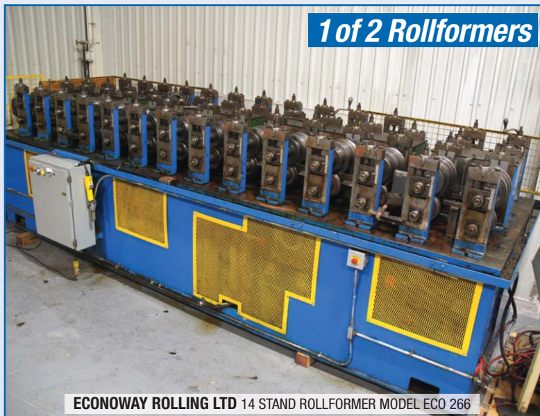
1 of 2 Rollformers