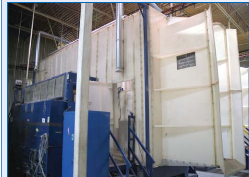
NORDSON 3 NOZZLE MANUAL PAINT BOOTH, MODEL N524