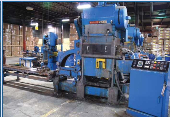
NIAGARA PD2-35, 35 TON PRESS