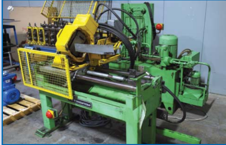
DREISSERTERN HYDRAULIC EXTRUSION CUTOFF