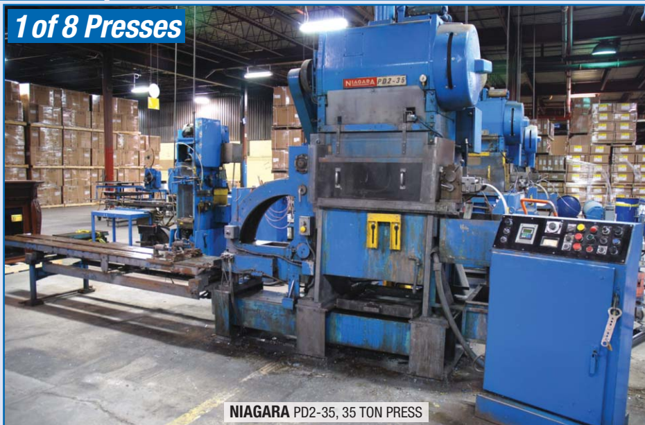
1 of 8 Presses