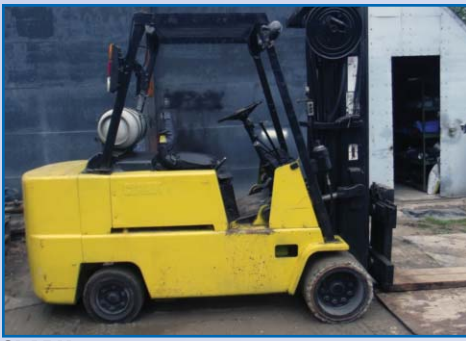
CLARK 12,000 LB. CAPACITY PROPANE FORKLIFT