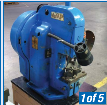
AMP & PERKINS WIRE CRIMP PRESS