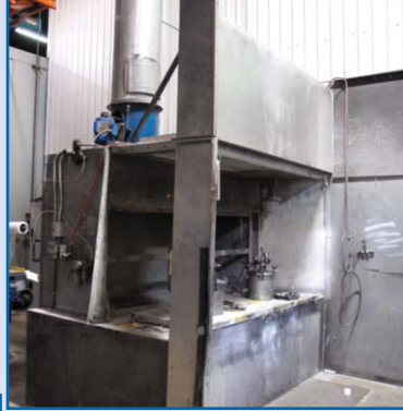
BINKS SAMES PAINT / SANDING BOOTH