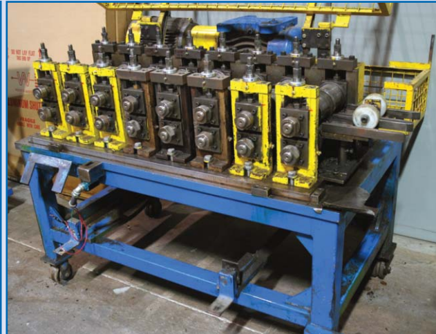
8 STAND ROLLFORMER (TOOLING EXCLUDED)