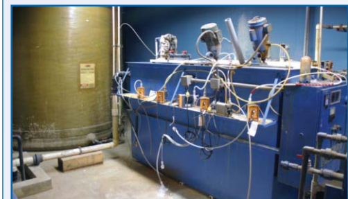
DMP CORPORATION WASTE WATER TREATMENT SYSTEM