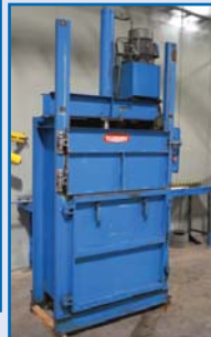
ECONOMY HYDRAULIC BALER MODEL 3621