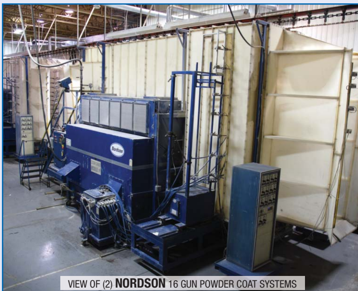
VIEW OF (2) NORDSON 16 GUN POWDER COAT SYSTEMS

Featuring: Complete Automatic NORDSON Powder Coat, 3 Stage Wash & Bake Line