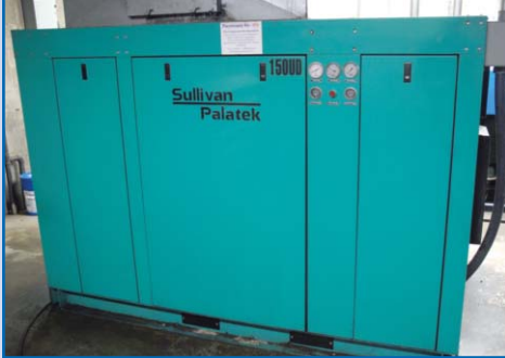
SULLIVAN PALATEK 150 HP AIR COMPRESSOR