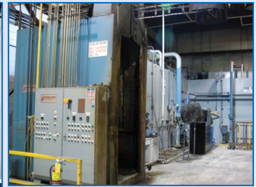
AUTOMATED JETTING SYSTEMS OF CANADA 3 STAGE PRE-TREATMENT

AUCTIONEER'S NOTE: Line May Be Sold 2 Ways, As A Bulk Lot And Individually