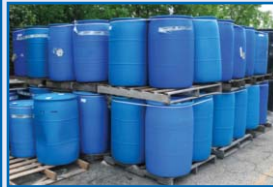
VIEW OF 92 - 55 GALLON DRUMS

(2) Paint Pots DREISSERTERN Hydraulic Extrusion Cutoff ECONOMY Hydraulic Baler Model 3621, sn 57965