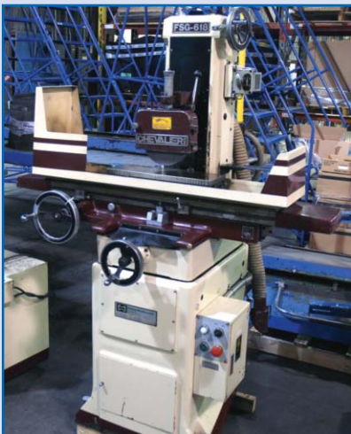
CHEVALIER 6"x18" SURFACE GRINDER