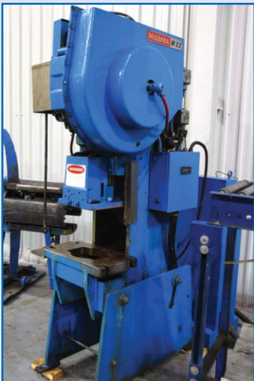
NIAGARA MODEL M22, 22 TON OBI PRESS