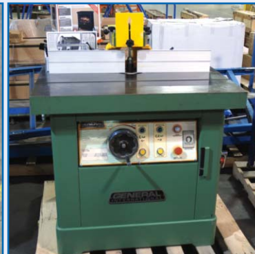
GENERAL 1-1/4" WOOD SPINDLE SHAPER MODEL 40-450