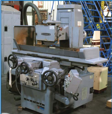
OKAMOTO 12"x24" SURFACE GRINDER