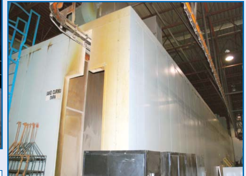
AUTOMATED JETTING SYSTEMS OF CANADA DRY OFF & BAKE OVEN