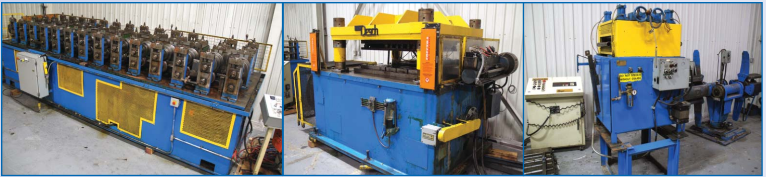
VIEW OF ECONOWAY ROLLING LTD 14 STAND ROLLFORMER MODEL ECO 266, DESCH 100 TON, 4 POST TRIM PRESS, FEEDER & CONTROLS (TOOLING EXCLUDED)