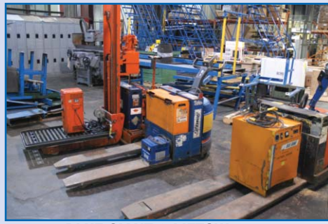
VIEW OF 3 BLUE GIANT & LIFTOW ELEC. LIFTS UP TO 5,000 LB CAP.