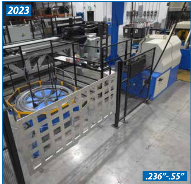
CSM WB-014-A WIRE BENDING SYSTEM

CLOSES: Tuesday June 16 th and Wednesday June 17 th , 10AM PST