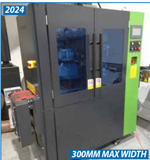
2024 ANHUI ADVANCED GRINDING TOOLS INC. ADV508-RW300 DEBURRING MACHINE 300MM MAX WIDTH