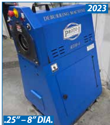
2023 PROTO-1 RDM-8 DEBURRING MACHINE .25" - 8" DIA.

2023 DYNOCOM Mod. 15000 2WD chassis dyno capable of speeds of 240+ mph and 2400+ hp, Inertia 118, torque arm 12", roll diam. 60.95, max RPM 3000. Rotary jack lift 14,000 capacity 4 post lift SN KVM 22L0010 (sold separate)