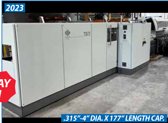
BLM ADIGE TS72 TUBE CUTTING SYSTEM