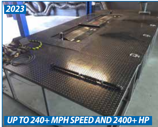
2023 DYNOCOM 15000 2WD CHASSIS DYNO UP TO 240+ MPH SPEED AND 2400+ HP