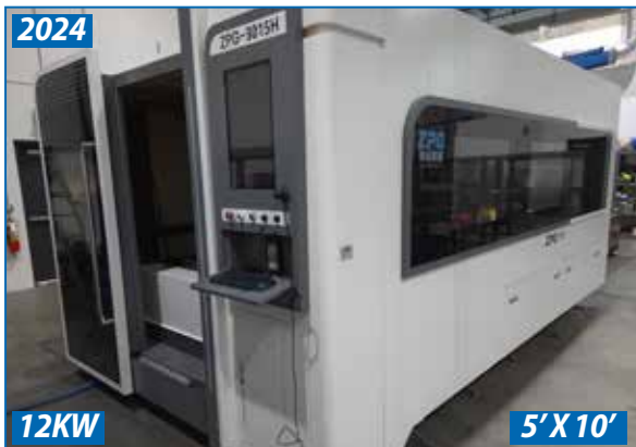
2024 ZHONGPIN GROUP (ZGP) 3015HC LASER CUTTING MACHINE 12KW 5' X 10'