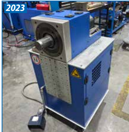
2023 WECOTECH TUBEX TUBE EXPANDER SYSTEM

2023 BLM GROUP CNC MOD. ELECT150BMS mandrel style tube bending system, up to 5.91" (150 mm), cad/ cam programming, Siemens Simatic HMI touch screen control, all electric axis, multi-shack, Hexagon Absolute compact CMM system complete with table CPU and monitor s/n CV062300259