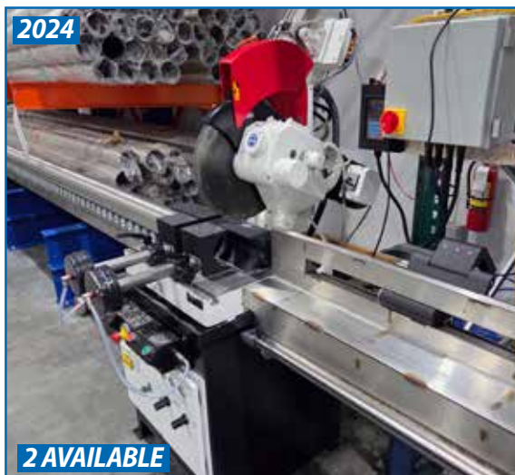
2024 HABERLE H450H SEMI AUTO COLD SAW 2 AVAILABLE