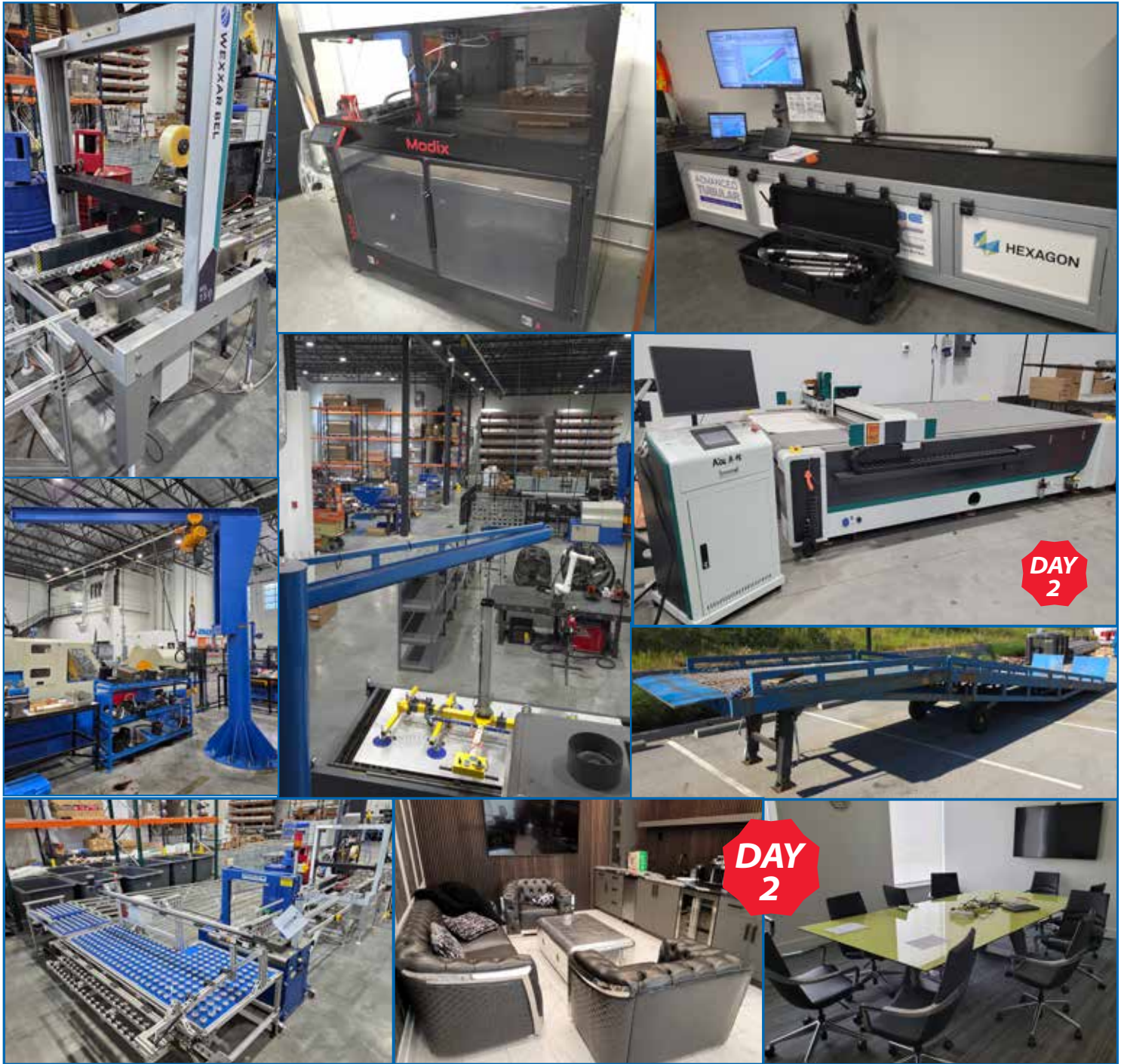
PARTIAL VIEW OF PLANT SUPPORT & OFFICE EQUIPMENT