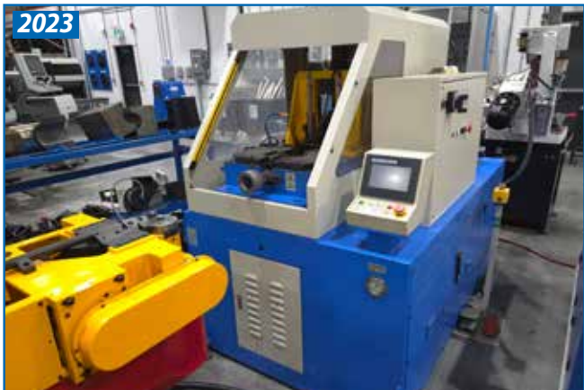
2023 CSM EF50-4 END FORMING/TUBE BENDER SYSTEM