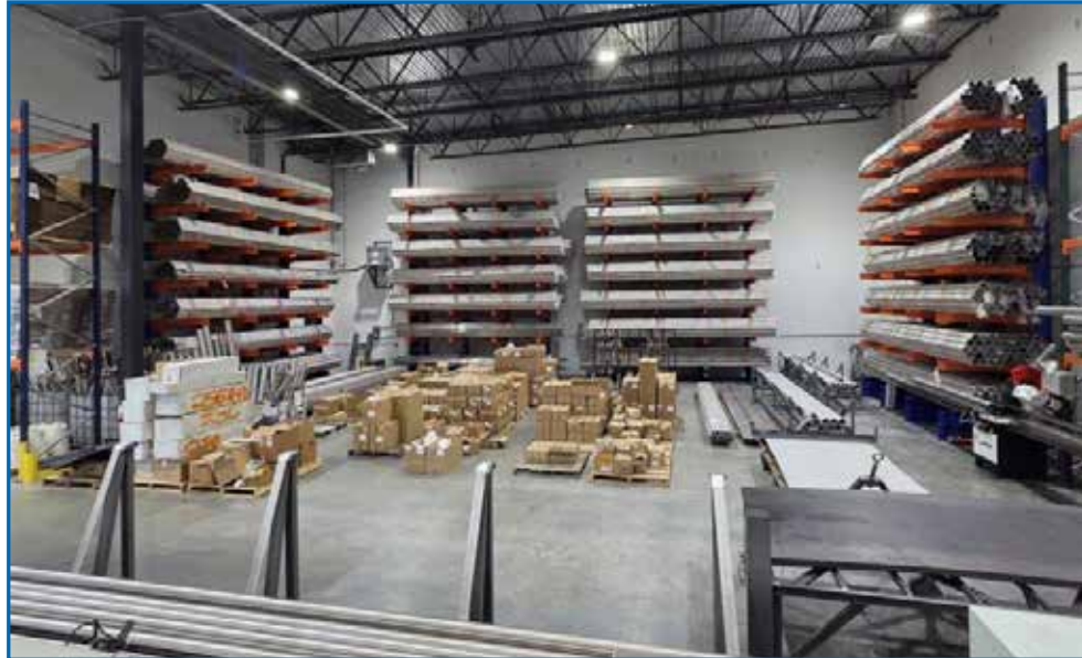
PARTIAL VIEW OF 304 STAINLESS STEEL TUBE & SHEET STOCK