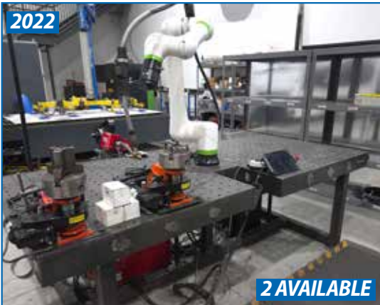
2022 VENTION NEXT-GEN ROBOTIC WELDING SYSTEM 2 AVAILABLE