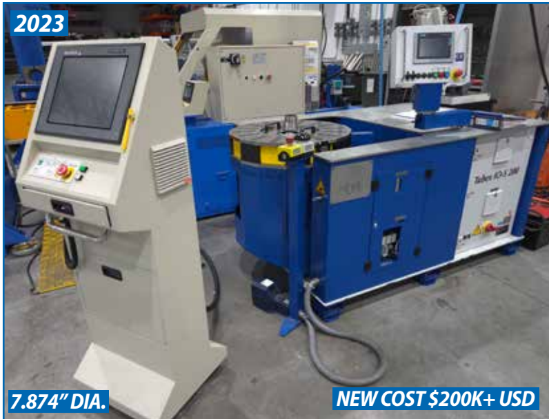
WECOTECH TUBEX IO-5200 TUBE END FORMER SYSTEM