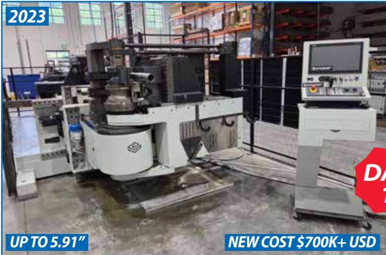
BLM CNC ELECT150BMS MANDREL STYLE TUBE BENDING SYSTEM

Day 1 – 13080 Katonien St., Maple Ridge, BC • Day 2 – 3548 191 St., Surrey, BC