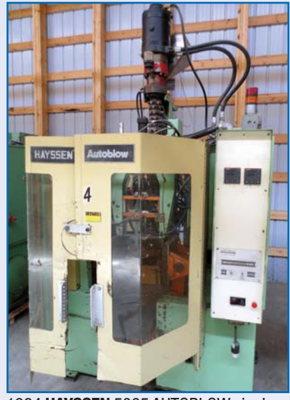
1984 HAYSSEN 5065 AUTOBLOW single extrusion, single die blow molder with dual 175mm die-head, upgraded PLC, vacuum loader, 480 volt, s/n na #4