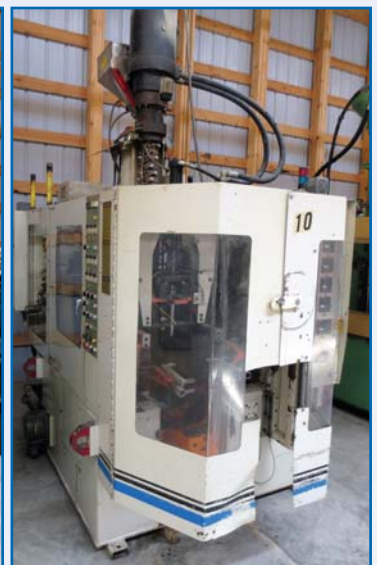
1993 CINCINATTI MILACRON 6065 AUTOBLOW single extrusion, single die blow molder with single diehead with machine trim, visi-stripe capable, vacuum loader, 480 volt s/n na #10