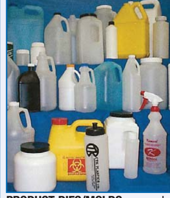
PRODUCT DIES/MOLDS – round, square and rectangular bottle molds with assorted necks, capacity: 250ml, 500ml, 909ml, 1L, 2L, 2.5L, 3.6L, 4L, 5L, 10L.