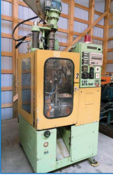
1979 HAYSSEN 2125 single extrusion, single die blow molder with extra die head and manual loader, with duel 250ml & 500ml dies (28-410mm), 220 volt, s/n na #2