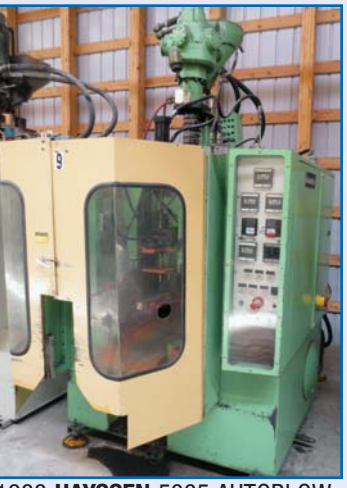
1988 HAYSSEN 5065 AUTOBLOW single extrusion, single die blow molder with upgraded PLC, vacuum loader, 600 volt, s/n na #9