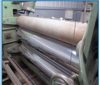
HARTIG plastic sheet extrusion line with 3.5" extruder, 55" die-head, 0.040"-0.440" thickness capacity, SHEETLINER roll temperature controller, all electrical panels, spare roller, hoist, tracks, cut off. Note: motor needs work or replacement