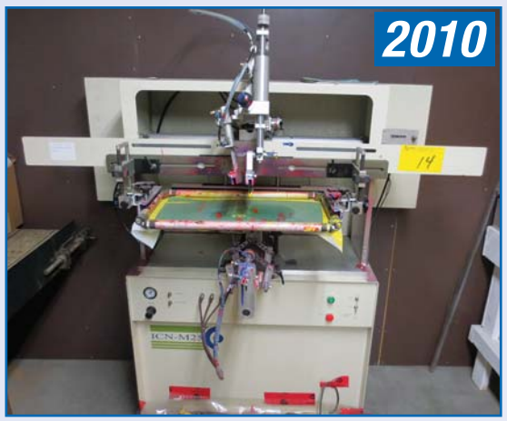
2010 ICN M25 semi-automatic screen printer with ADVANTAGE TIPS-30A-52HF skid mount 30 ton microprocessor control, one or two direction print for flats, cylinders, ovals and cones with 36" x 16" screen size, 25" stroke, 1800 impressions per hour, 110 volt s/n S0411W27