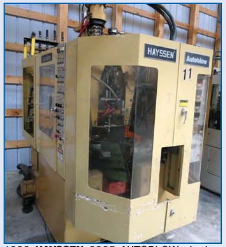
1990 HAYSSEN 6065 AUTOBLOW single extrusion, single die blow molder with vacuum loader, 480 volt, s/n na #11