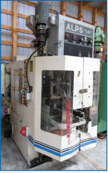
1993 CINCINATTI MILACRON 6065 AUTOBLOW single extrusion blow molder with dual trim 175mm die head, visi-stripe capable, extra screw, vacuum loader, 480 volts s/n na #7