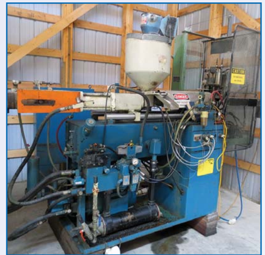
1979 IMPCO B-13 single extrusion, single die blow molder, 600 volt s/n na #1