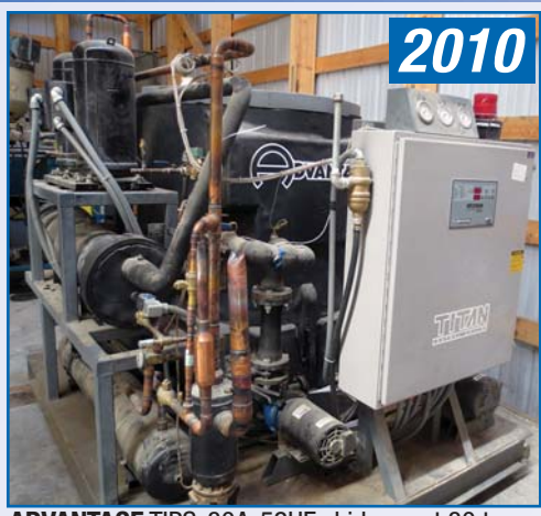
chiller with MAXIUMUM 2000LE control, 600 volt s/n 114315