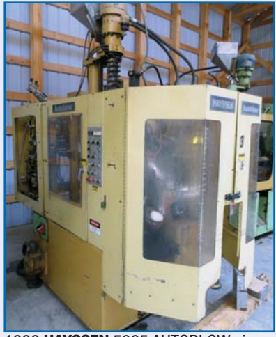
1986 HAYSSEN 5065 AUTOBLOW single extrusion, single die blow molder with upgraded PLC & 2 new screws, vacuum loader, 600 volt, s/n na #3