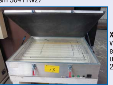
X-VACTOR vacuum exposure unit with 25" x 36" cap.