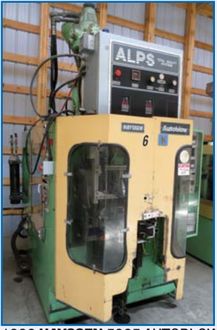
1986 HAYSSEN 5065 AUTOBLOW single extrusion, single die blow molder with trim dual 175mm die-head, PLC, vacuum loader, 600 volt, s/n na #6