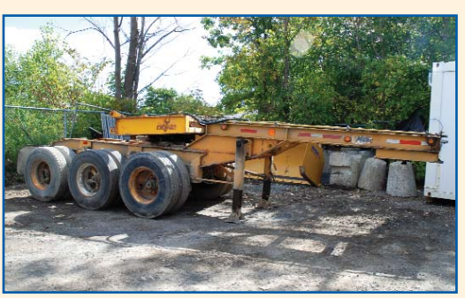
KING TRI AXLE STEERABLE DOLLY. MODEL 52SW

CORNIVER Smooth Drum Vibratory Roller, Model CT-40S, Drum Width 40", VIN S09114