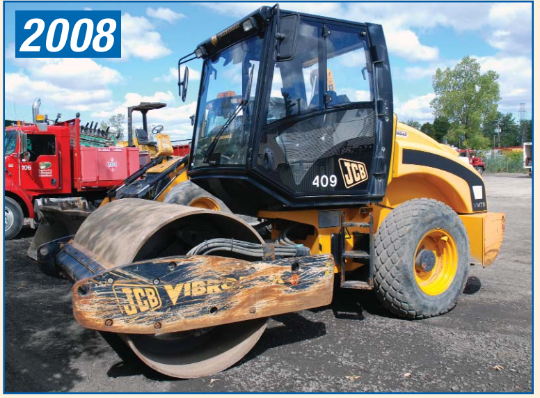
JCB SMOOTH DRUM VIBRATORY ROLLER, MODEL VM75D