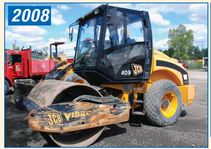
JCB SMOOTH DRUM VIBRATORY ROLLER, MODEL VM75D