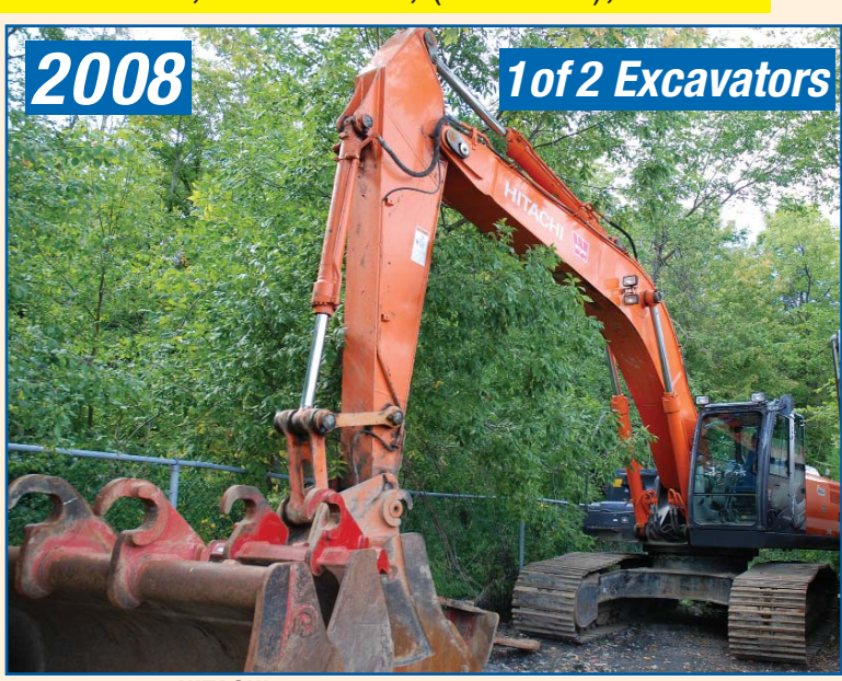
HITACHI HYDRAULIC EXCAVATOR, MODEL ZX350 LC-3