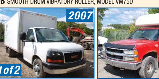
GMC CUBE VAN, MODEL SAVANA G3500