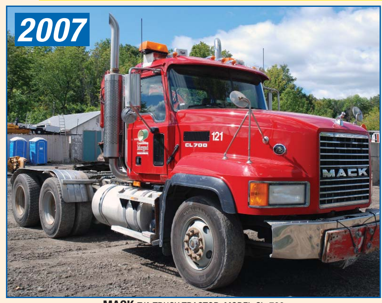
MACK T/A TRUCK TRACTOR, MODEL CL-700

Assets Relocated To: 20425 Avenue Clark Graham, Baie D'Urfé, (Montreal), Quebec