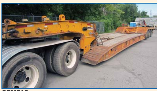
REMFAB 50 TON TRI AXLE LOW BOY TRAILER, MODEL RD80-55A20