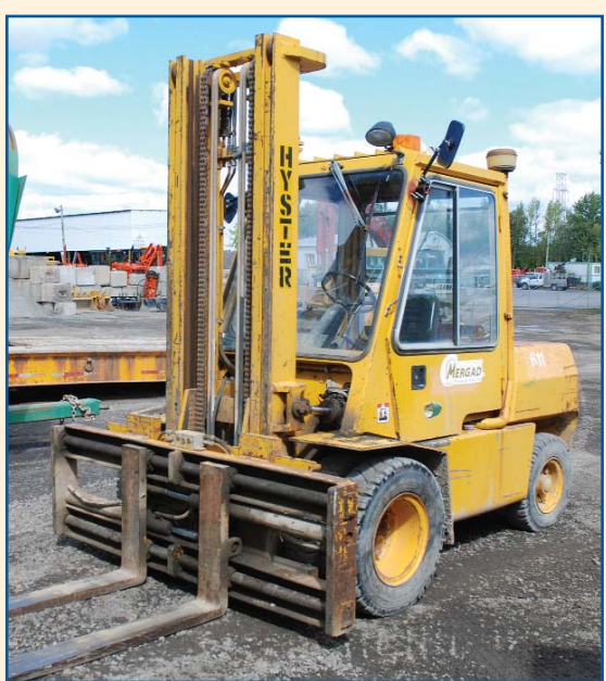
HYSTER FORKLIFT, MODEL H110XL, 11,000 LB CAPACITY