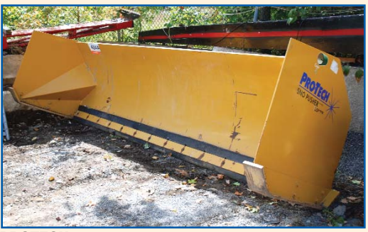
PROTECH MODEL SP12B, 14' SNOW BLADE