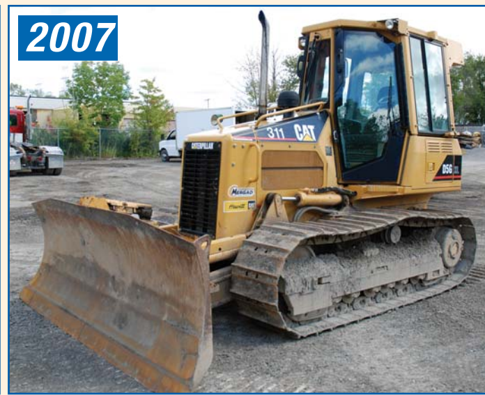
CATERPILLAR CRAWLER TRACTOR, MODEL D5G-XL