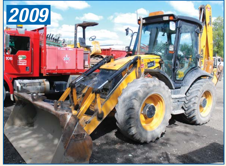
JCB 4X4X4 LOADER BACKHOE, MODEL 4CX15