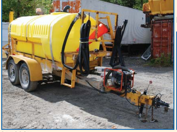
GREGSON COMMERCIAL SPRAYER T/A TRAILER