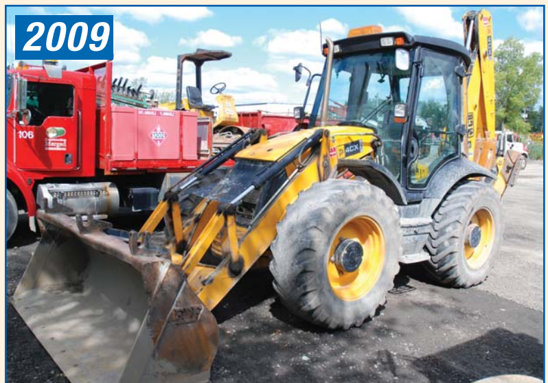
JCB 4X4X4 LOADER BACKHOE, MODEL 4CX15