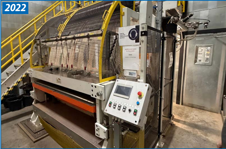
2022 CORE LINE DESIGNED FOR EFFICIENT, HIGH-VOLUME MANUFACTURING OF CELLULAR PAPER PRODUCTS

Complete Honeycomb Packaging Products Manufacturing Facility, Pulp and Paper Mill Surplus Spare Parts, Maintenance Tools & More 223 Morgan Ln Suite B, York, PA, 17406