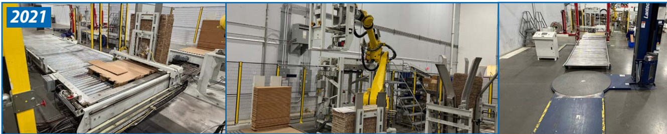
PREMIER TECH RPZ-500 FULLY AUTOMATIC PALLET HANDLING AND LOAD TRANSFER SYSTEM