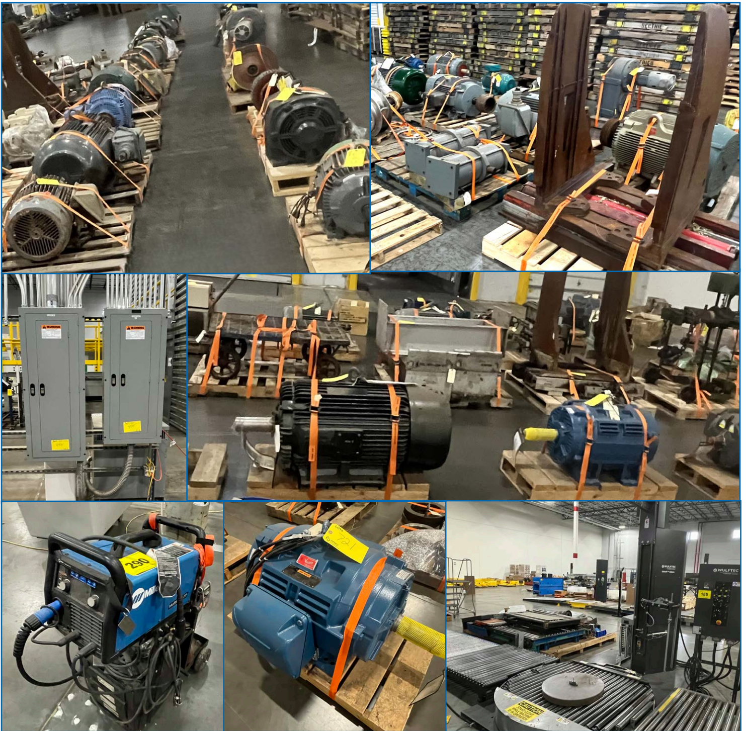
PARTIAL VIEW OF PLANT SUPPORT EQUIPMENT