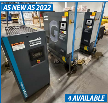
PARTIAL VIEW OF ATLAS COPCO COMPRESSORS