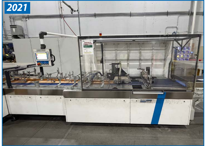
2021 HUGOBECK AUTOMATED FORM-FILL-AND-SEAL SYSTEM