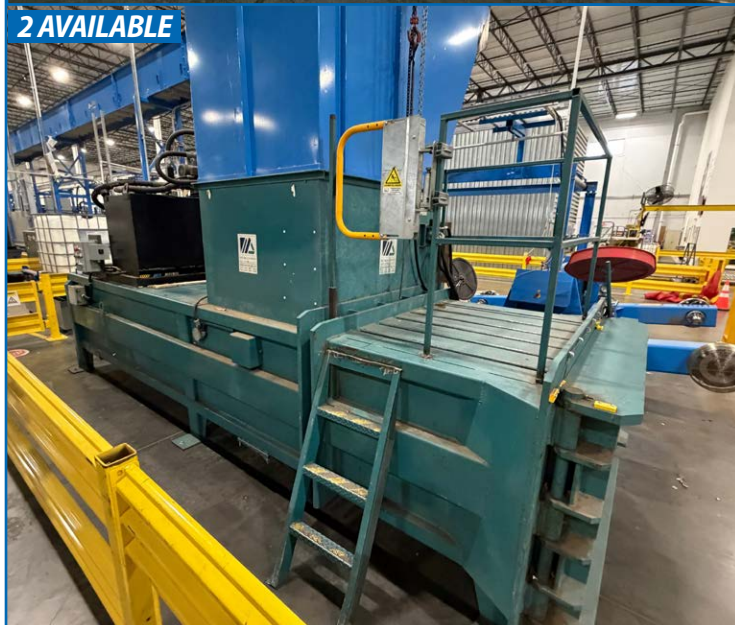
PARTIAL VIEW OF PLANT SUPPORT EQUIPMENT