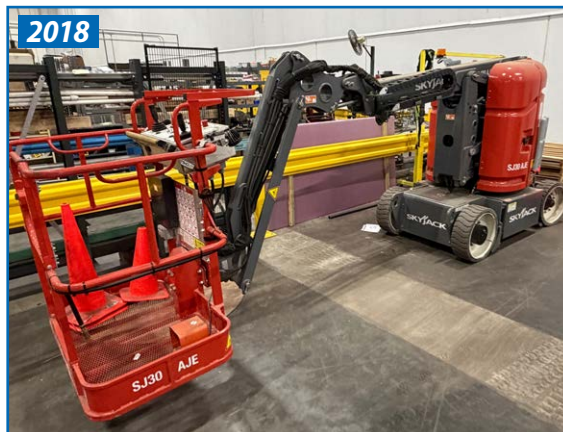
SKYJACK SJ30 AJE ELECTRIC BOOM LIFT