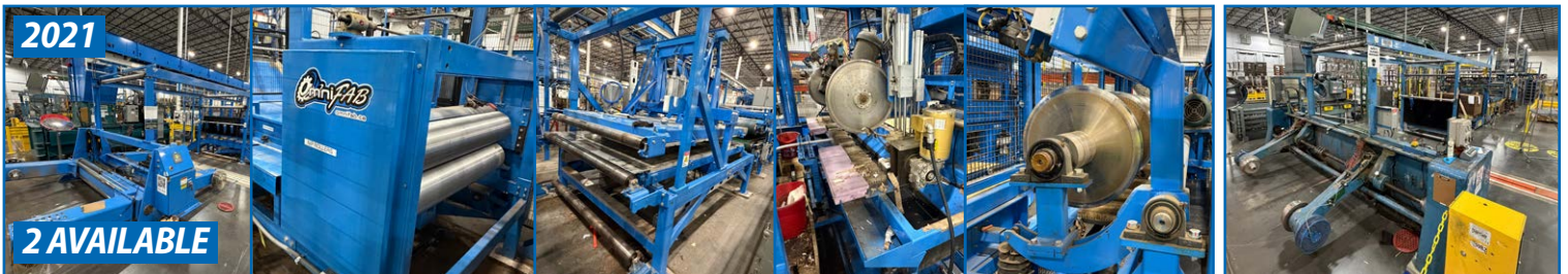
FACING 11 EDF9 PRODUCTION LINE