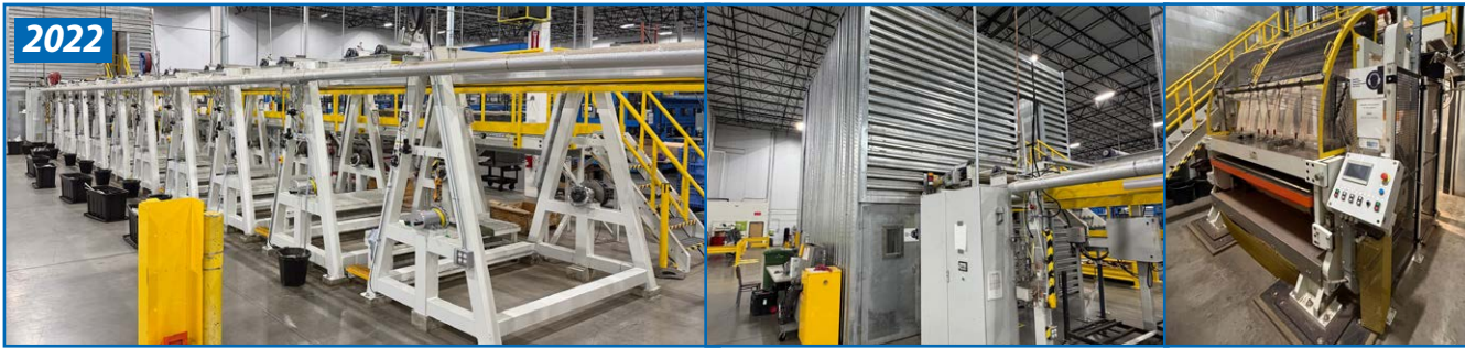
CORE LINE DESIGNED FOR EFFICIENT, HIGH-VOLUME MANUFACTURING OF CELLULAR PAPER PRODUCTS