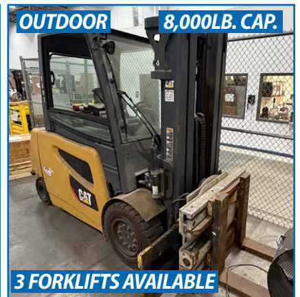
CATERPILLAR 2EP8000 ELECTRIC FORKLIFT