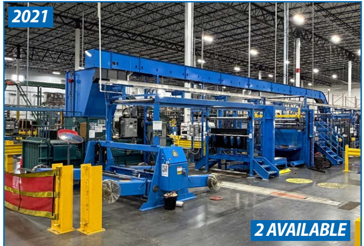
2021 FACING 11 EDF9 PRODUCTION LINE