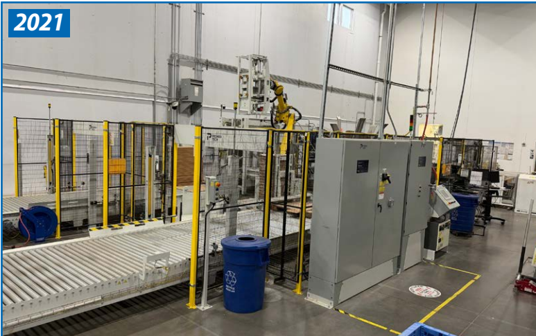
2021 PREMIER TECH RPZ-500 FULLY AUTOMATIC PALLET HANDLING AND LOAD TRANSFER SYSTEM