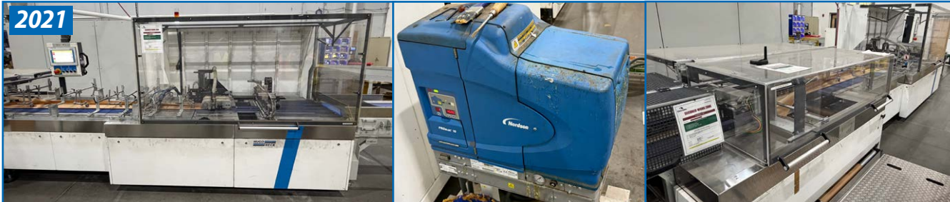
HUGOBECK AUTOMATED FORM-FILL-AND- SEAL SYSTEM