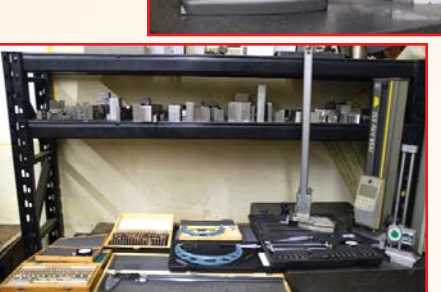
PARTIAL VIEW OF ASSORTED PRECISION MEASURING EQUIPMENT