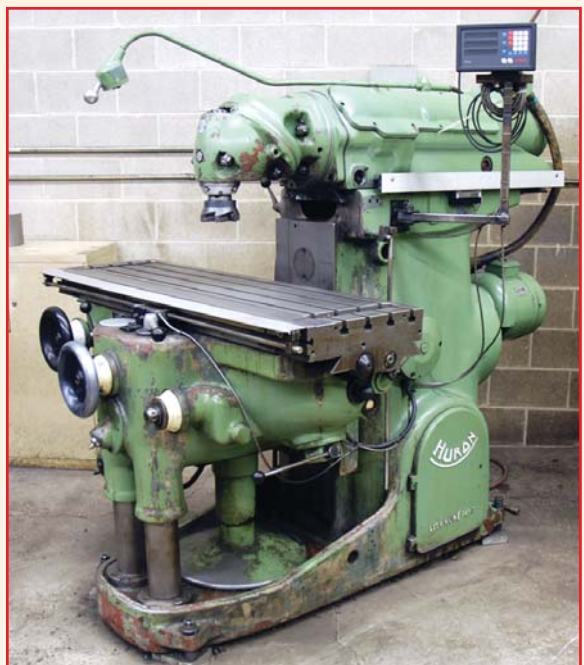
HURON RAM TYPE UNIVERSAL MILL, TYPE KU4