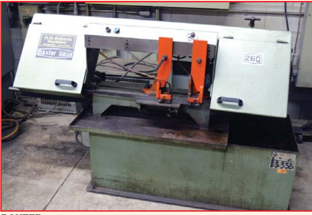
BAXTER HORIZONTAL BANDSAW, MODEL 260