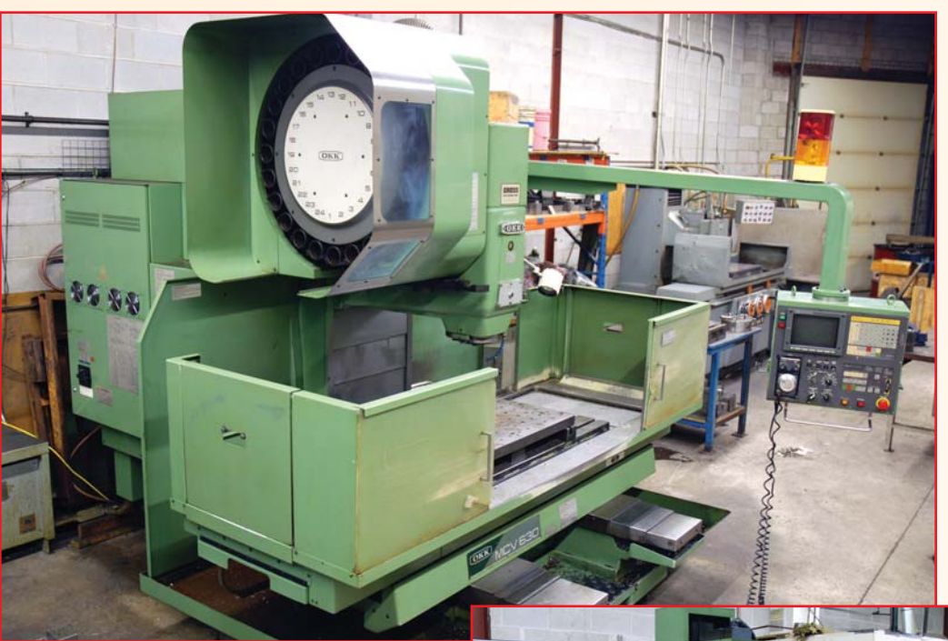
OKK CNC VMC MODEL MCV 630