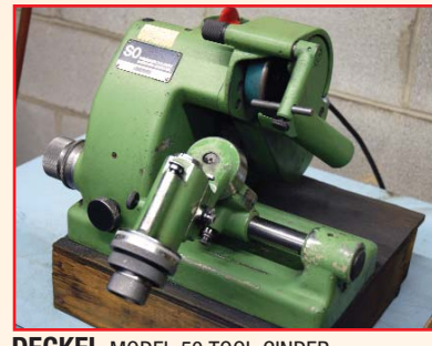
DECKEL MODEL 50 TOOL GINDER