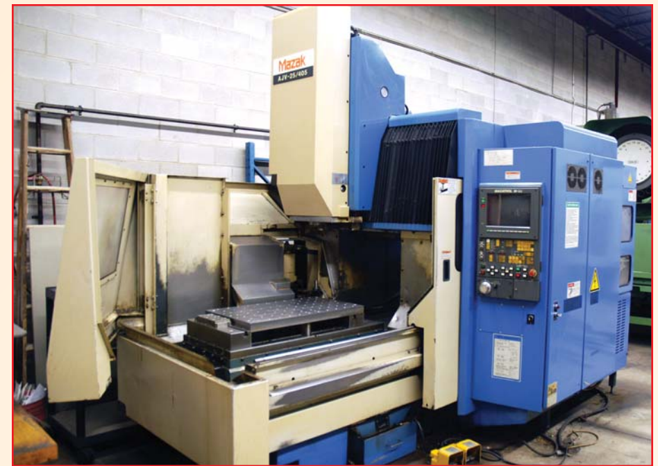
MAZAK CNC VMC MODEL AJV-25/405