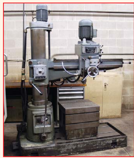
ALZMETALL 3' RADIAL ARM DRILL