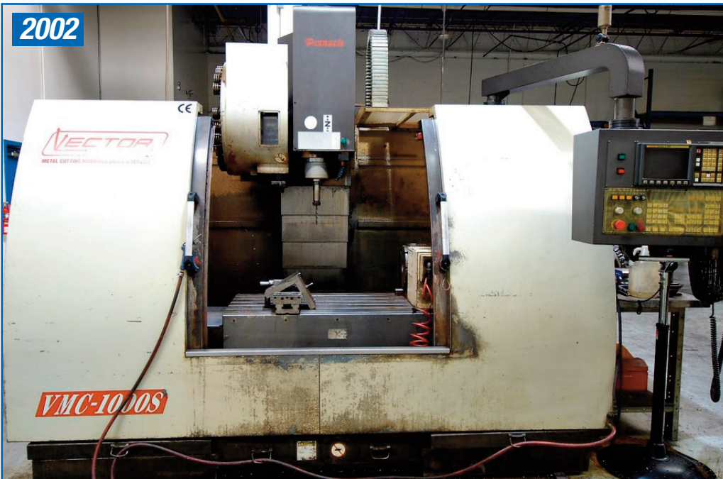
VECTOR VMC-1000S CNC VERTICAL MACHINING CENTER