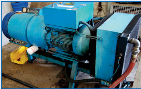
COMPAIR 148 UAS AIR COMPRESSOR