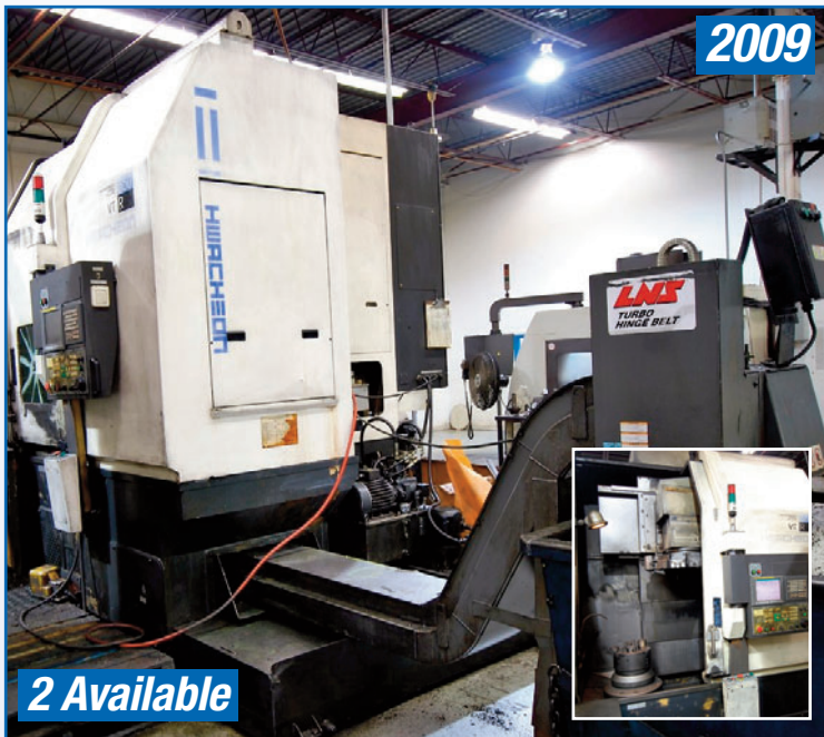
HWACHEON VT-550 R CNC VERTICAL TURNING CENTER