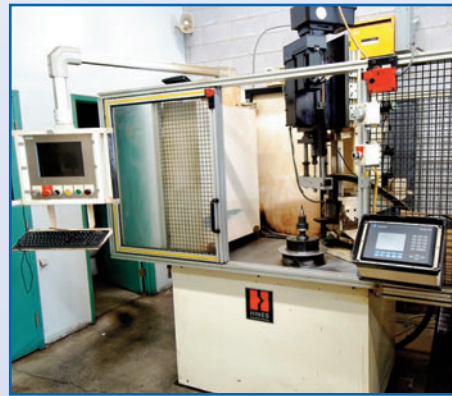
HINES MSM BALANCING MACHINE