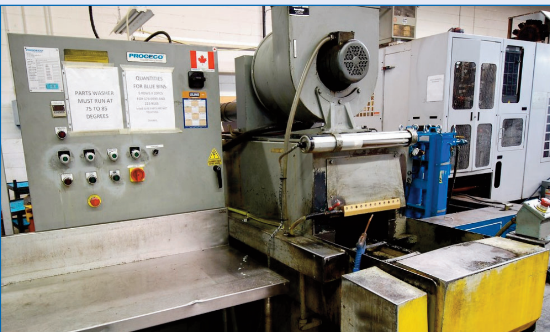
PROCECO MB-S12X12-E-4W-BO PARTS WASHER

TOS FNK 25 Vertical Milling Machine, Heidenhain 2-Axis DRO, Speeds to 4,500 RPM, 12" x 49" Table, s/n 25085