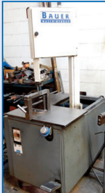
BAUER VERTICAL BANDSAW