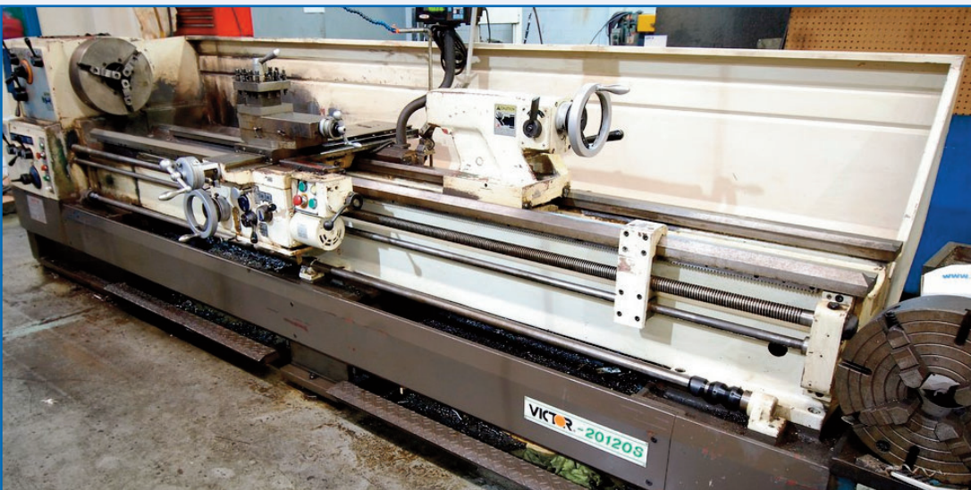
VICTOR 20120S LATHE