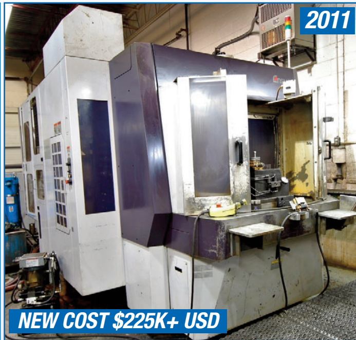
ENSHU JE60S CNC TWIN PALLET HORIZONTAL MACHINING CENTER