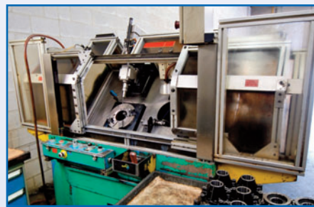
FLM TECHNOLOGY SPM DRILLING MACHINE