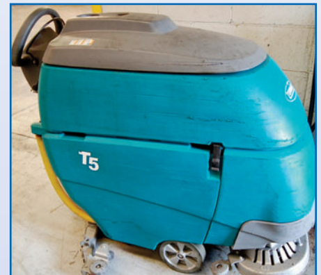
TENNANT T5 FLOOR SWEEPER