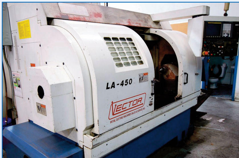
VECTOR LA-450 CNC LATHE