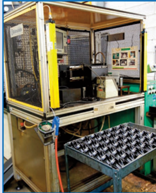
EDMUNDS PRECISION GAUGE MACHINE