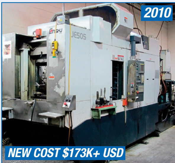
ENSHU JE50S CNC TWIN PALLET HORIZONTAL MACHINING CENTER