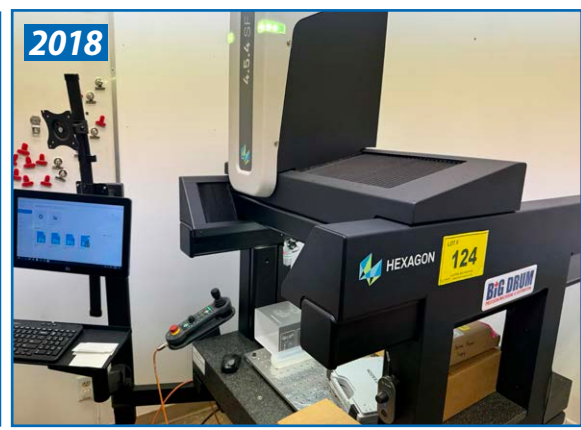
HEXAGON SF 4.5.4 CMM