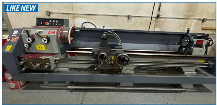
MANEK MGH-267/12 LATHE

2012 GMC Sierra 3500 HD SLE Pickup Truck, Approx. 272,160kms, VIN# 1GT323CG6CZ193210