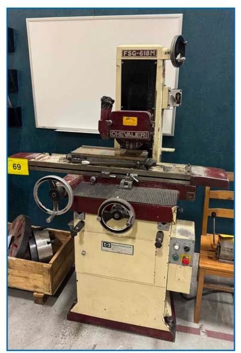
CHEVALIER FSG-618M GRINDER