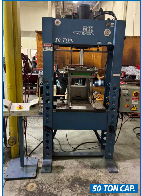
RK MACHINERY HYDRAULIC SHOP PRESS