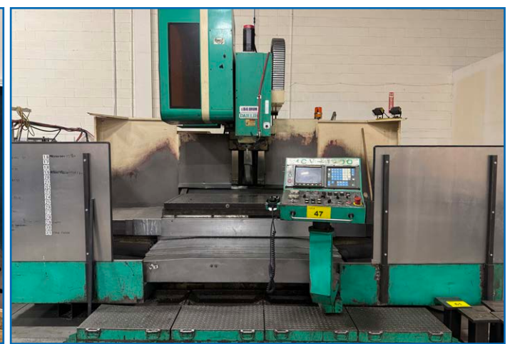
DAHLIH DL-MCV1700 CNC VERTICAL MACHINING CENTER