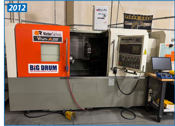
VICTOR VTURN-A26 CNC TURNING CENTER