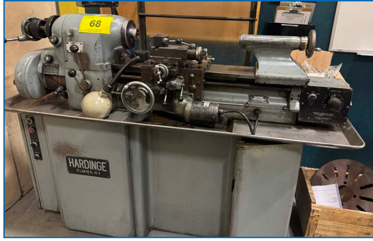
HARDINGE HLV-H TOOLROOM LATHE