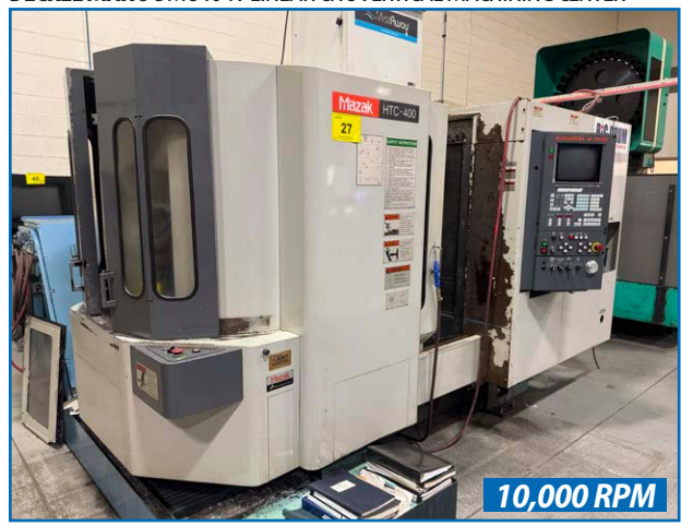
MAZAK HTC-400 CNC HORIZONTAL MACHINING CENTER