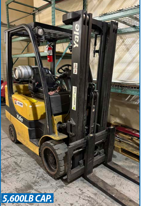
YALE PROPANE FORKLIFT