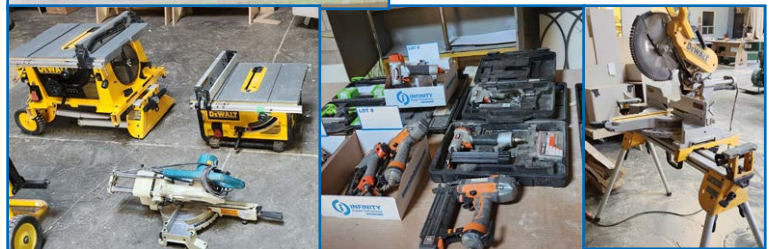
PARTIAL VIEW OF SUPPORT EQUIPMENT