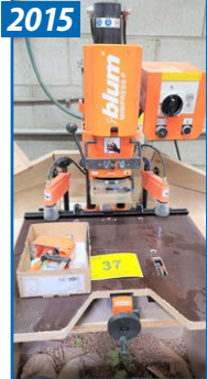
BLUM MINIPRESS P

PLUS: CRAFTEX Dust Collectors, RIDGID , DEWALT , MAKITA , RYOBI , PORTER CABLE , BOSCH Power Tools, End Mills, Cutting Tools, Table Saws, Overhead Router, Free Standing Jib, Air Compressors, Paint Spray Booths, Commercial Kitchen Equipment, BESSEY & Bar Clamps, Hardware, Wood Inventory, Edge Banding Inventory, Office Furniture & Much More!