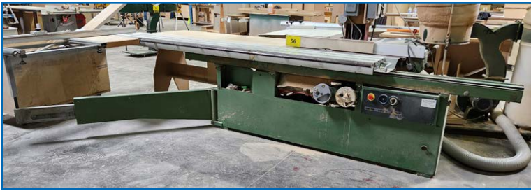
MACHINE CASADEI KS/3200 SLIDING TABLE SAW