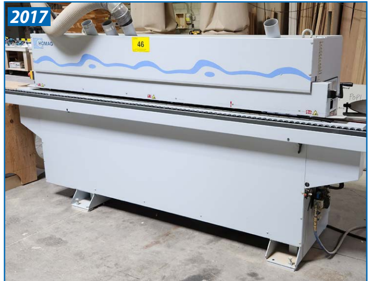
HOMAG KDN AMBITION 1110 EDGE BANDER