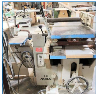
MIDA THICKNESS PLANER