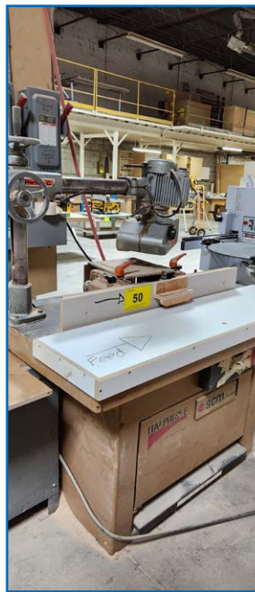
SCM T120K SHAPER

2021 SCM MORBIDELLI N100 15C CNC Nesting Machining Center for Drilling and Routing w/ SCM EYE-M CNC 21.5" Touch Screen Control, X-Y Axis 35 m/min, Stroke 250mm, Z Axis 150mm (Panel Travel), (12) Vertical Spindles, (6) Horizontal Spindles, 21HP, 24,000 RPM Routing, 8,000 RPM Drilling, (15) Tool Changer, s/n AH00002841