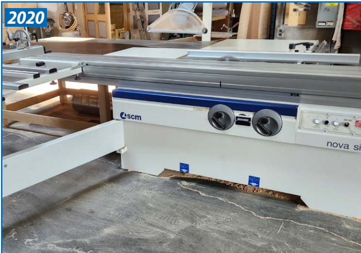
SCM NOVA SI400 SLIDING TABLE SAW