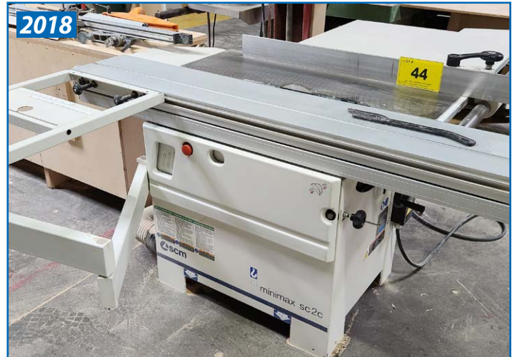
SCM MINIMAX SC2C SLIDING TABLE SAW