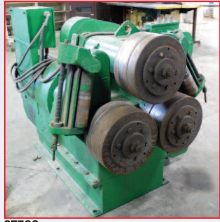
STECO Hydraulic Angle Rolls, 14" Diameter x 7" Rolls, Approx 4"x4"x1/2" Capacity