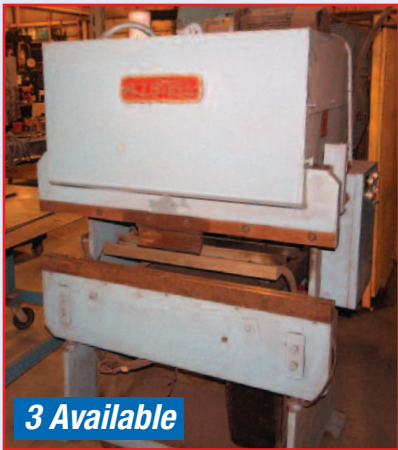
ALLSTEEL 33 Ton Press