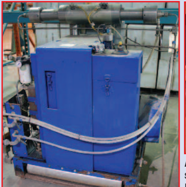
CALYPSO WATERJET INGERSOLL RAND Pump, Model 300EM, 30 HP, sn 555427-1