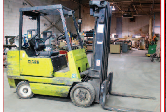
CLARK 5,000 lb Capacity Propane Forklift, Model GCS-30MB, 3 Stage Mast, 42" Forks, In/Out Tires, sn G138MB-535-1671