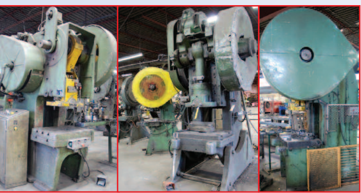
10 OBI Punch Presses 30 Ton To 100 Ton Capacity

FORD SMITH Dual Sided Sanding / Buffing Machine, Model 601, Up To 3" Belt Capacity with Belt Attachment, 2 HP, 550V, sn 5492