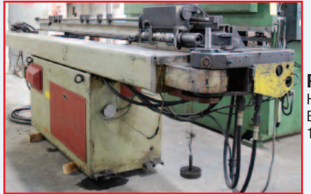
PEDRAZZOLI Horizontal Tube Bender With 1.5" Capacity