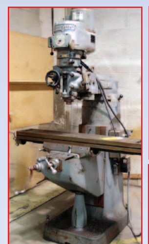
HARTFORD Vertical Mill, 9"x42" Variable Seed. 2 HP BRIDGEPORT Vertical Mill