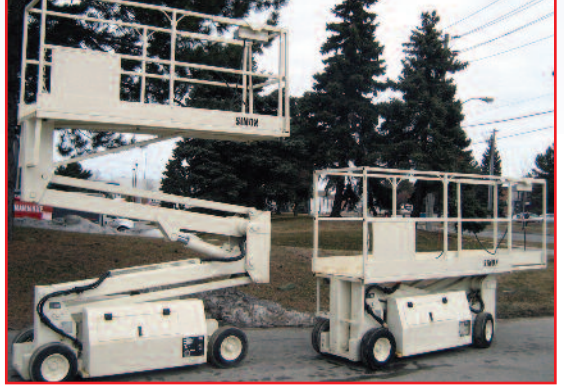
(2) Electric Scissor Lifts