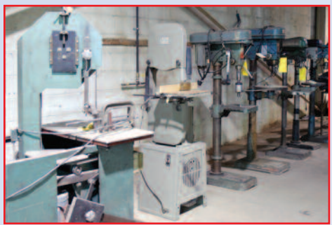
Partial View Of Saws & Drill Presses