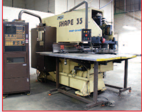
PIERCE ALL CNC Turret Punch Model Shape 35 Perf-O-Mator, Producer Control