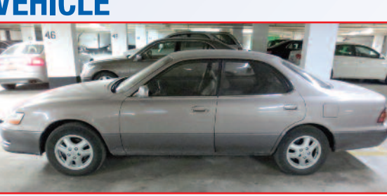
1994 LEXUS ES300, 6 Cylinder, 4 Door Sedan, Heated Leather Seats, Alloy Wheels, Mint Condition, Only 156,000 km, VIN: JT8GK13T8R0001042

DIRECTIONS: From Toronto Intl Airport To: 420 Eddystone Avenue, Downsview, Ontario, M3N1H7: Approx. 16km, 15 mins Exit Airport, Follow Signs to 401 East, Follow Signs to 400 North, Exit 25, Finch Ave W, Turn Right on Oakdale Road, Turn Left on Eddystone Ave, Destination on Left