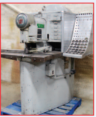
WALES STRIPPIT 25 Ton Punch, 15" Throat, 23"x30" Table, 20" Arm Extension, Large Selection Assorted Punches & Dies, sn 31632859