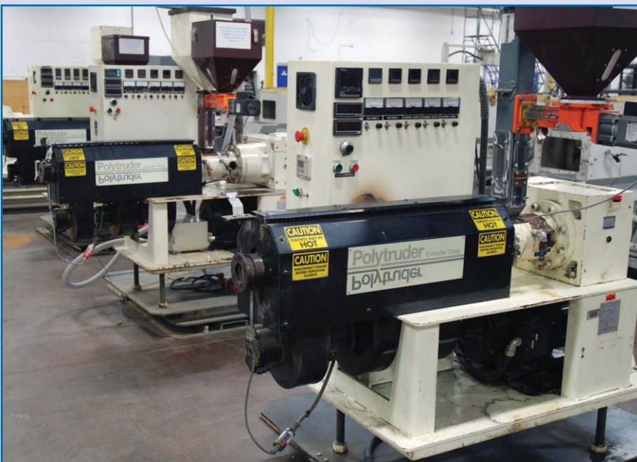
VIEW OF (4) POLYTRUDER COEXTRUDERS, MODEL 1.5-24-15