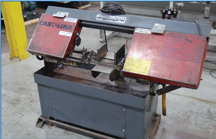
CAROLINA HORIZONTAL BANDSAW