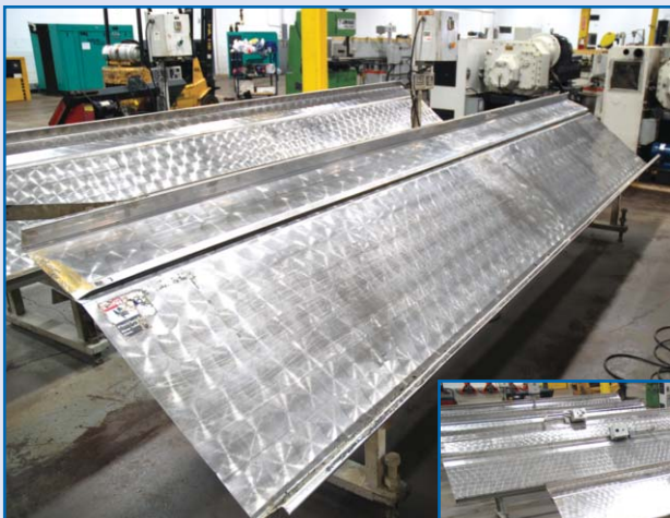
VIEW OF 7 CDS RUN OFF TABLES