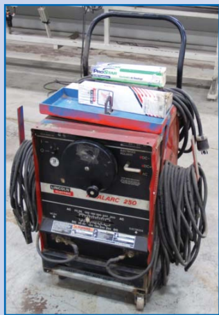
LINCOLN ELECTRIC IDEALARC 250