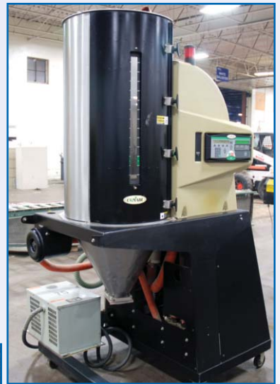
CONAIR PORTABLE DRYER & CONVEYOR, MODEL MDCW100