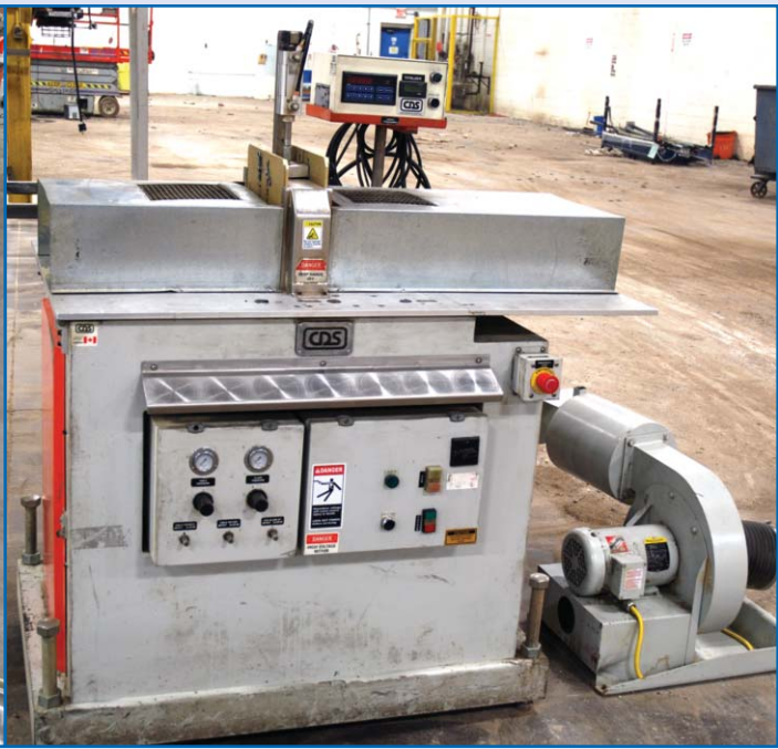
VIEW OF 8 CDS SAWS