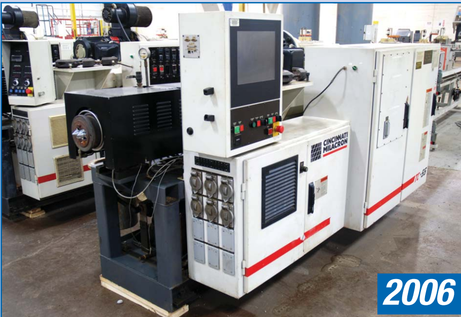
CINCINNATI MILACRON TWIN SCREW EXTRUDER, MODEL TC-55