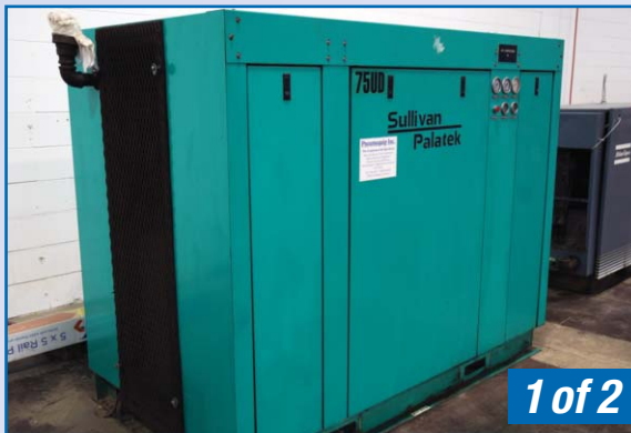
SULLIVAN PALATEK 75 HP COMPRESSOR