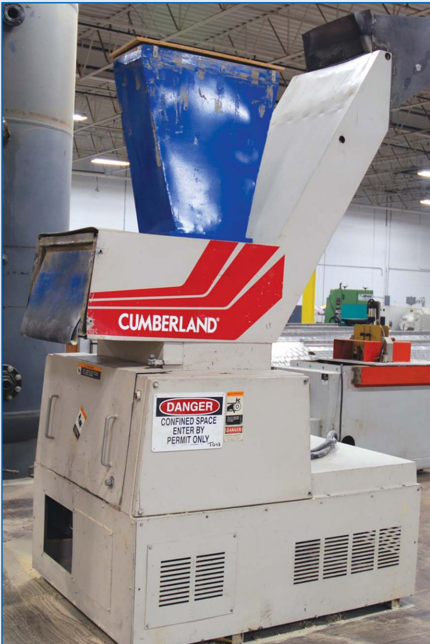
CUMBERLAND 75 HP GRANULATOR, MODEL 14261