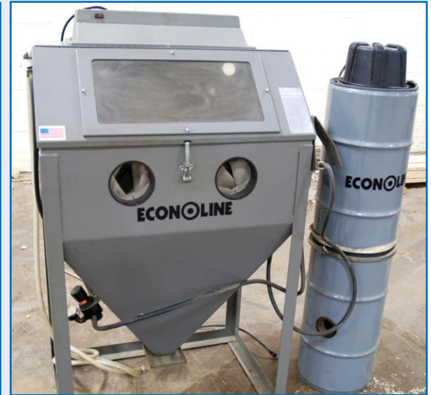
ECONOLINE SANDBLAST CABINET