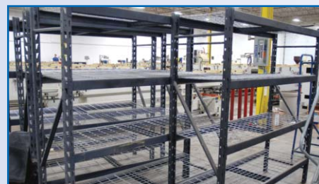
RACKING WITH MESH DECKING