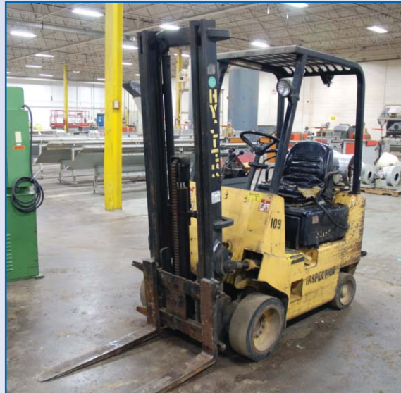
HYSTER 3,900 LB CAPACITY FORKLIFT