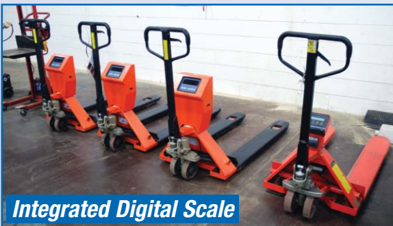
ECO PALLET JACK MODEL TRANSPALLET I-55