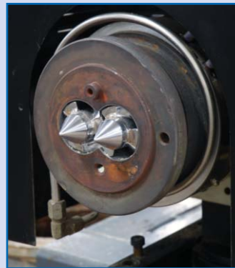
VIEW OF TWIN SCREW