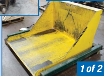
SOUTHWORTH BIN TIPPER, MODEL ZTU2-85