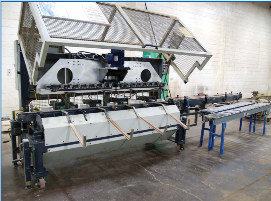
BOERHOF WELDING 18 SPINDLE MULTI DRILL