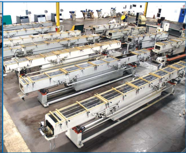
VIEW OF 12 CDS COOLING TANKS