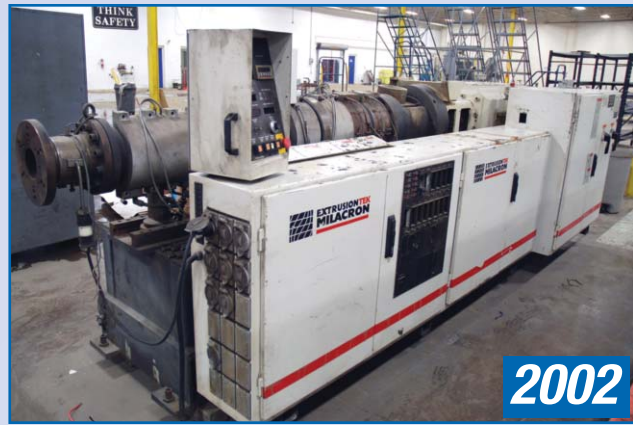
CINCINNATI MILACRON EXTRUDER, MODEL TC 86