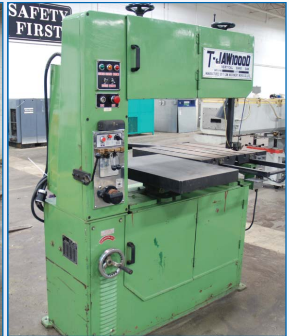
T-JAW 1000D VERTICAL BANDSAW