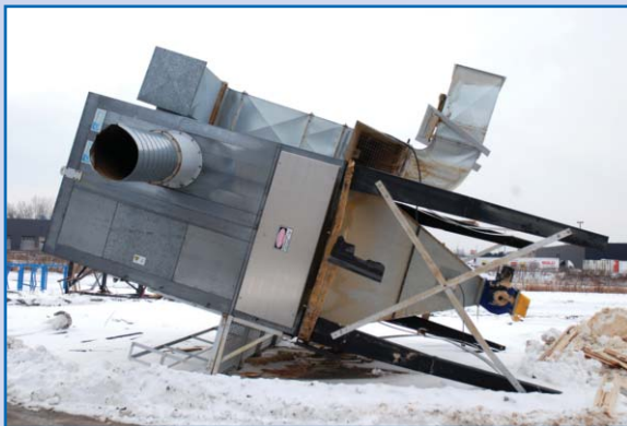
CORAL 60 HP DUST COLLECTOR